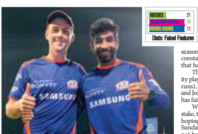
Trent Boult & Jasprit Bumrah pose for photo after win against CSK

With their big-hitting ability, the Pandya brothers and Pollard are a threat to any oppo-