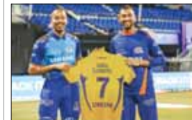
Pandya brothers Hardik and Krunal pose with CSK skipper MS Dhoni's jersey at the end of IPL match between Mumbai Indians and Chennai Super Kings