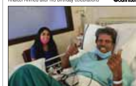
India's first World Cup-winning captain Kapil Dev is well on road to recovery after a successful recovery coronary angioplasty, and this is evident from a photo in which the legendary all-rounder is seen flashing a double thumbs up sign from his hospital bed