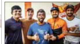
Wriddhiman Saha poses for photo with his Sunrisers Hyderabad teammates Priyam Garg, Abhishek Sharma, Manish Pandey and Khaleel Ahmed after his birthday celebrations