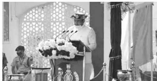
Junior Home Minister G Kishan Reddy addresses ITBP force on its 59th Raising Day at paramilitary's facility in Greater Noida

The senior official's remarks came in the midst of a growing global concern over China's expansionist behav-