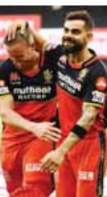
Virat Kohli & AB de Villiers

CSK is expected to continue giving opportunities to the youngsters, treating the remaining three games as an audition for the next season.