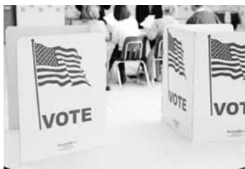
will "definitely be voting," a contrast to 47 per cent during the 2016 elections.

Youth enthusiasm to vote and likelihood of turning out on track will hit record levels in 2020, with 63 per cent of respondents indicating they