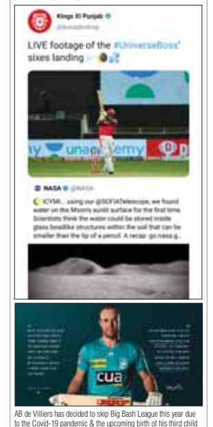
AB de Villiers has decided to skip Big Bash League this year due to the Covid-19 pandemic & the upcoming birth of his third child