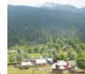
August last year, non-residents could not buy any immovable property in Jammu & Kashmir.

Before the Abrogation of Article 370 and Article 35-A in