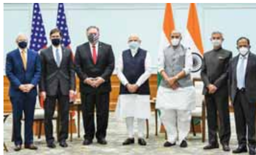
Prime Minister Narendra Modi with US Secretary of State Mike Pompeo and US Defence Secretary Dr Mark T. Esper during a meeting. In New Delhi on Tuesday, External Affairs Minister S. Jaishankar, Defence Minister Rajnath Singh, National Security Adviser Ajit Dhol and US Ambassador to India Ken Juster are also seen.

The two countries discussed ways to further strengthen four pillars of the Strategic Energy Partnership (SEP) covering Oil & Gas, Power and Energy Efficiency, Renewables and Sustainable Growth. Pompeo said the US "stands with India to deal with any threat."