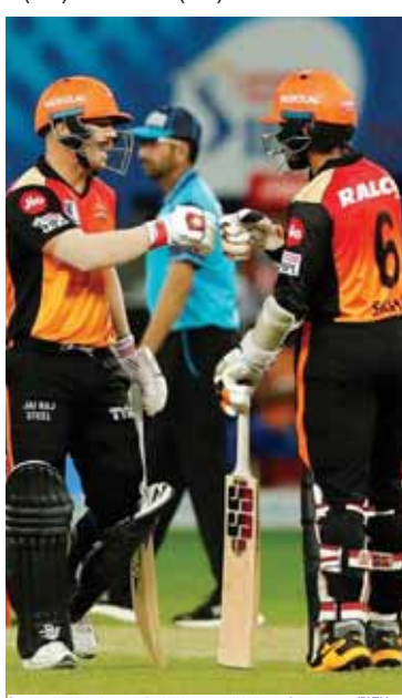
Sunrisers Hyderabad openers David Warner and Wridhiman Saha