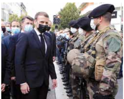
French President Emmanuel Macron meets soldiers after a knife attack at Notre Dame church in Nice, southern France, on Thursday

It was the third attack in two months in France that authorities have attributed to Muslim extremists, including the beheading of a teacher. It comes during a growing furor over caricatures of the Prophet that were republished in recent months by the satirical newspaper Charlie Hebdo, renewing vociferous debate in France and the Muslim world over the depictions that Muslims consider offensive but are protect-