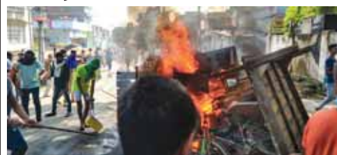
Protesters set on fire furniture after clashes with the police over immersion of Goddess Durga idols in Munger on Thursday