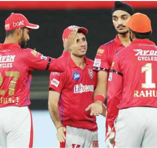
The Kings XI Punjab celebrate the win during Indian Premier League