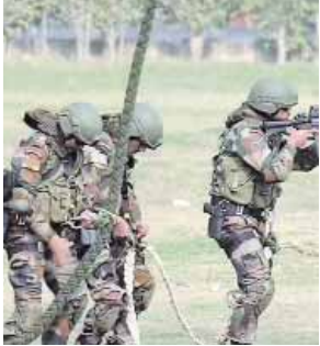
has violated ceasefire over 3,190 times in which 24 civilians have been killed and over 100 have been injured near the LoC in J&K.