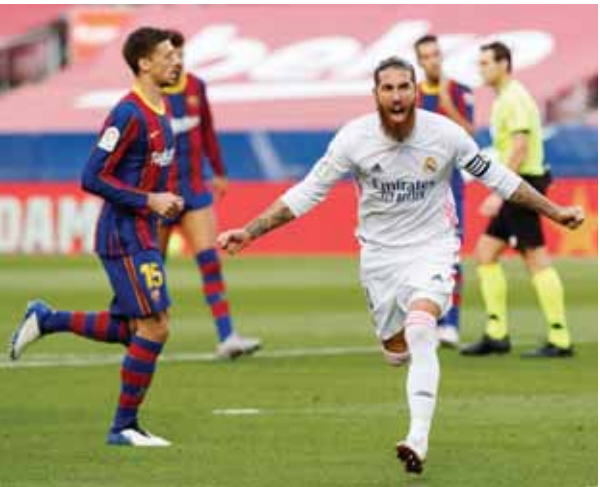
Sergio Ramos celebrates after scoring Real's second goal against Barca