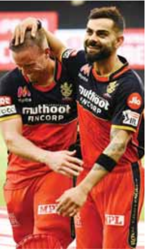
Virat Kohli & Ab de Villiers

They run into a RCB squad which has grown in confidence as the tournament has progressed. Virat Kohli and his men are placed third on the points table with 14 points, the same as