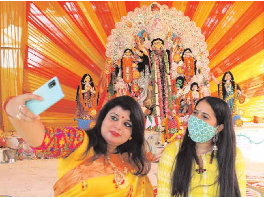
Women taking selfie in front of Devi Durga idol installed at a community puja pandal Kali Bari at Chitrtranjan Park in Delhi on Saturday

PNS ■ LUCKNOW Launched by Chief Minister Yogi Adityanath to ensure safety, dignity and empowerment of women and girls, Mission Shakti, completed its first phase with active participation from 24 government departments, private establishments, social organisations and NGOs. The ambitious programme was launched on the first day of Sharadiya Navratra on October 17. The Mission Shakti, to be continued for the next six months till Basant Navratra, witnessed a series of events in conformity with its theme and created awareness not only among women but the society in general. An official communiqué confirmed on Saturday that some major decisions and endeavours initiated during the first phase reaffirmed the CM's commitment towards protection of women's rights and their rightful place in the society. At the outset, Yogi had directed to identify 100 role models among women and girls in every district aiming to showcase their achievements and contributions which could be inspirational for others to emulate. The communiqué said that a series of decisions were also taken to further the cause of