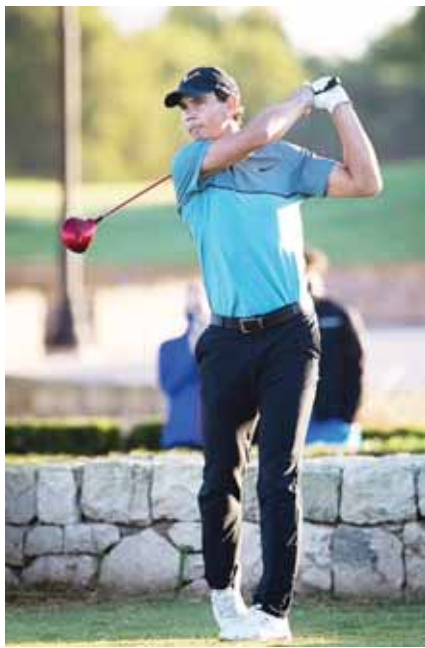
Rafael Nadal plays a shot as he took part in the Balearic Championship in Mallorca on Saturday