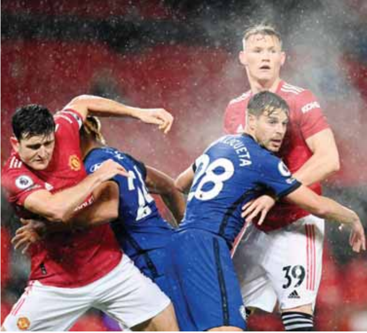
Man United's Harry Maguire, left, and Scott McTominay, right, jostle for position with Chelsea's Cesar Azpilicueta, second right, and Reece James during Premier League clash at Old Trafford

Mason Greenwood returned for United as a late substitute and Mendy