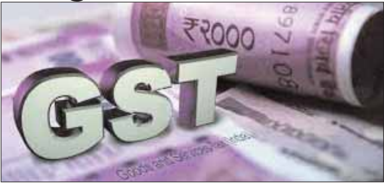
"In view of the same, on the recommendations of the GST Council, it has been decided to extend the due date for filing

New Delhi: The government on Saturday extended the deadline for furnishing GST annual returns for FY 2018-19 by two months till December 31. The government had last month extended the last date for filing GST annual return and audit report for the 2018-19 fiscal by a month till October 31, 2020. In a statement, the Central Board of Indirect Taxes and Customs (CBIC) said the government has been receiving a number of representations regarding need to extend due date for filing Annual Return (Form GSTR-9) and Reconciliation Statement (Form GSTR-9C) for FY 2018-19. The representations have been made on the grounds that due to the COVID-19 pandemic related lockdown and restrictions, normal business operations have still not been possible in several parts of the country, it said. The statement said it has been requested that the due dates for the same be extended beyond October 31, 2020 to enable the businesses and auditors to comply in this regard.