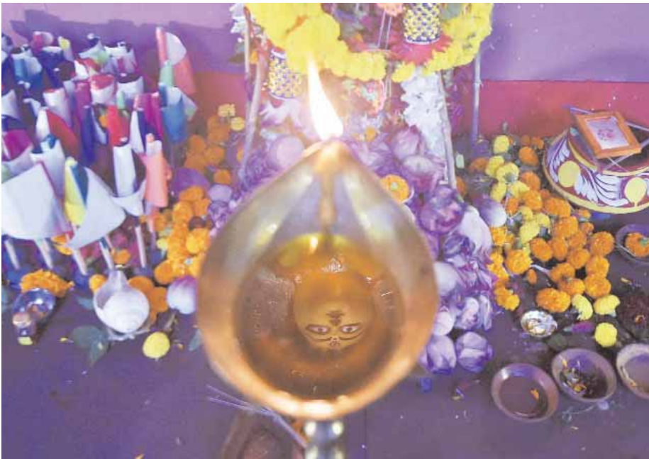
Reflection of the face of Devi Durga idol on the diya (lamp) during Sandhi puja at a community puja pandal, in Kolkata on Saturday

and DSO to issue ration cards to all sex worker's families identified by NACO and distribute ration to them as per the 2003 Act. Details of the sex worker's families identified by NACO available in the District Legal Services Authority and the Uttar Pradesh AIDS Controller Society have to submit to the government by 26th October based on 6 points. On receiving this order, the department has started collecting the information of sex workers. After not getting the information from NACO's office in the district, now the department's last hope is the District Legal Services Authority from where it can get the number of families of sex workers.