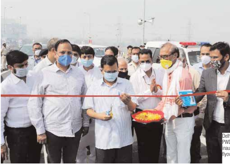
Delhi Chief Minister Arvind Kejriwal along with PWD Minister Satyendar Jain during the inauguration of newly-constructed Shastri Park flyover, in New Delhi on Saturday

by ministers to fill their own pockets or as bribes. This was the money that came from the innocent citizens of Delhi. But we do not indulge in bribes and take money from officials or engineers, and we are saving the money of the citizens. It is with this money of the people that we save, that we are able to provide free amenities, healthcare, medicines and quality education to our citizens," he said. The chief minister further said "I am certain that these flyovers will contribute further towards providing them a hassle-free ride. In the last five years, a lot of progress has taken place in this area, including establishing water and sewer connections, etc," he said. PWD Minister Satyendar Jain said, "Today two flyovers were inaugurated by the chief