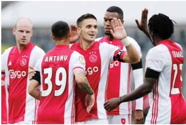
Ajax players celebrate after scoring goal against VVV during Eredivisie clash on Saturday. The Dutch team defeated their opponents 13-0