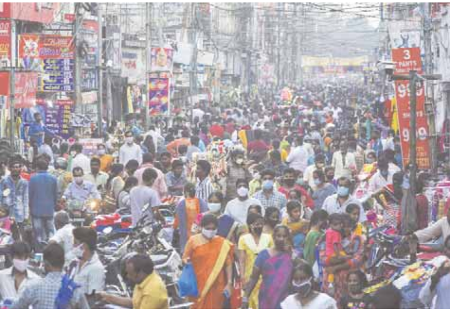
People through the Besant Road market for shopping on the eve of Dassehra festival in Vijayawada on Saturday

Beed, Nanded, Wardha and Chandrapur, 2 each in Raigad, Satara, Kolhapur, Sindhudurg, Jalna and Osmanabad and one death each in Palghar, Ratnagiri and Washim. In addition, one person from outside the state died in Maharashtra. With 50 deaths, the Covid-19 toll in Mumbai shot up from 10,009 to 10,059, while the infected cases rose by 1,257 to trigger a jump in the infections from 248,802 to 250,059. Meanwhile, the mortality rate in the state stood at 2.63 per cent. The number of "active cases" in the state dropped from 1,43,922 to 1,40,194. Pune district, which continued to be the worst-affected city-district in Maharashtra, saw the total number of cases increase from 3,28,397 to 3,29,205, while the total number of deaths in Pune increased from 6581 to 6595. Thane district remained in the third spot --after Pune and Mumbai -- after the total number of infections from 2,16,596 to 2,18,352, while the pandemic toll rose from 5258 to 5,268. Out of 85,48,036 samples sent to laboratories, 16,38,961 have tested positive (19.17 per cent) for COVID-19 until Saturday. Currently, 25,03,510 people are in home quarantine while 14,170 people are in institutional quarantine.