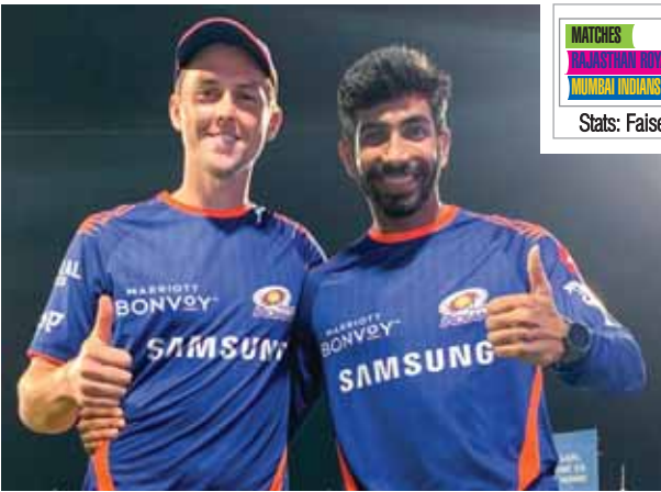
Trent Boult & Jasprit Bumrah pose for photo after win against CSK

But Rohit's absence was hardly felt on Friday as the young Ishan Kishan (261 runs) launched into CSK bowlers with gusto.