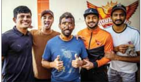
Wriddhiman Saha poses for photo with his Sunrisers Hyderabad teammates Priyam Garg, Abhishek Sharma, Manish Pandey and Khaleel Ahmed after his birthday celebrations