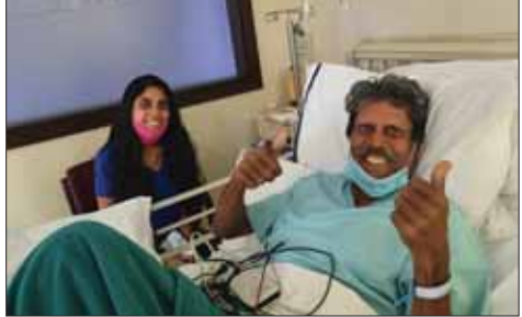
India's first World Cup-winning captain Kapil Dev is well on road to recovery after a successful emergency coronary angioplasty, and this is evident from a photo in which the legendary all-rounder is seen flashing a double thumbs up sign from his hospital bed