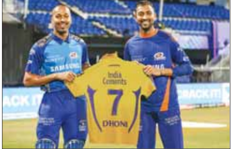
Pandya brothers Hardik and Krunal pose with CSK skipper MS Dhoni's jersey at the end of IPL match between Mumbai Indians and Chennai Super Kings