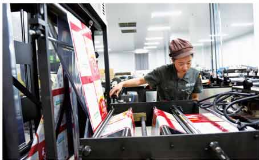
In north China's Hebei Province, a worker is busy making pet-product packing boxes in a factory.