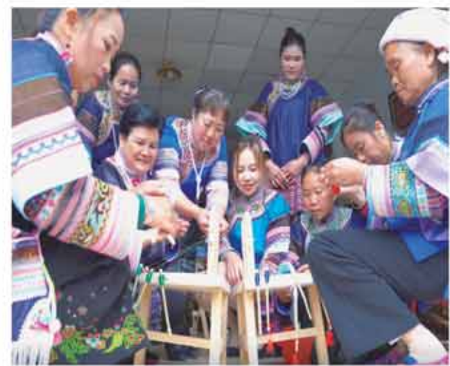
Zhuang women are learning how to make Zhuang brocade.