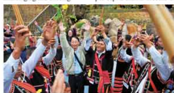
Villagers of Laodabao receive tourists.

In the province as a whole, in 2019, more than 1,000 poor villages developed cultural tourism on a certain scale. Rural tourism attracted 360 million visitors to these villages, bringing in 230 billion yuan and lifting 110,000 people out of poverty. (Duan Jianxin)