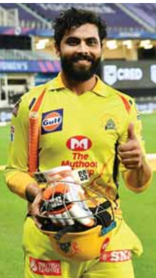
Ravindra Jadeja celebrates after win IPL T20 ■ DUBAI

Ravindra Jadeja smashed consecutive sixes in the final over as Chennai Super Kings put a big dent in Kolkata Knight Riders' chances of reaching the IPL play-offs with a thrilling six-wicket win here on Thursday.