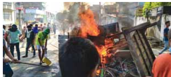
Protesters set on fire furniture after clashes with the police over immersion of Goddess Durga idols in Munger on Thursday