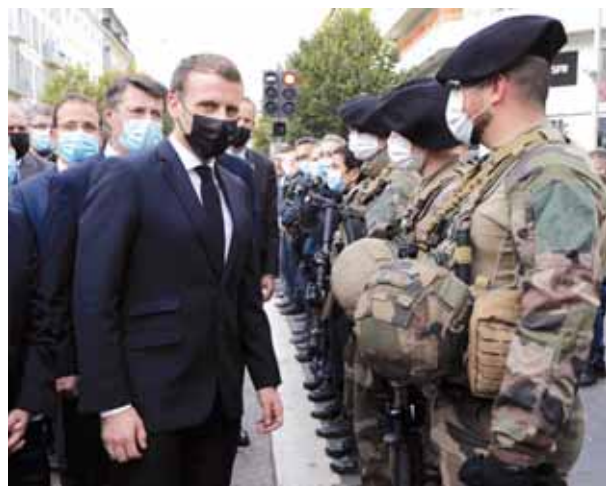
French President Emmanuel Macron meets soldiers after a knife attack at Notre Dame church in Nice, southern France, on Thursday

It was the third attack in two months in France that authorities have attributed to Muslim extremists, including the beheading of a teacher. It comes during a growing furor over caricatures of the Prophet that were republished in recent months by the satirical newspaper Charlie Hebdo, renewing vociferous debate in France and the Muslim world over the depictions that Muslims consider offensive but are protect-