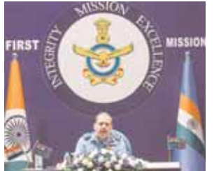
IAF chief Rakesh Kumar Singh Bhadauria addresses a Press conference in New Delhi Monday

In a stern message to India's neighbours, IAF chief RKS Bhadauria on Monday said his force is ready to take on China and "there is no question it can get better of us." Assuming that the armed forces are "well positioned" to deal with any threat, he also said the IAF is prepared to fight a two-front war.