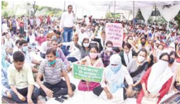
Power employees protesting against privatisation at head office of Electricity department in Prayagraj

After the negotiations between the Power Corporation Management and Vidyut Karmachari Sanyukt Sangarsh Samiti were inconclusive, the struggle across the divisions was declared by delegation of the Samiti. However, Vidyut Karmachari Sanyukt Sangarsh Samiti reiterated its resolve to positively improve the power system and appealed to Chief Minister Yogi Adityanath to intervene in the