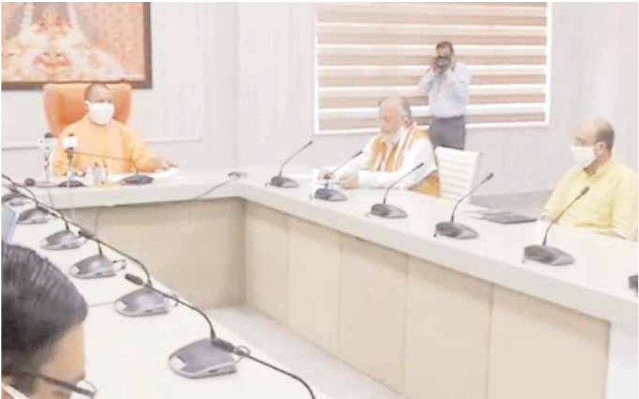
Chief Minister Yogi Adityanath inaugurated a 220-bed Covid hospital in Prayagraj and unveiled state's first COBAS-6800 lab through video-conferencing on Monday

Prasad said over 4.1 lakh surveillance teams had covered 1,31,336 areas of the state and visited 2.61 crore houses to check the health of over 12.94 crore people.