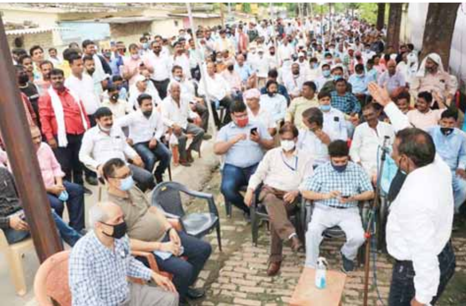
Power employees staging protest in Varanasi on Monday

Under the banner of Power Employees' Joint Action Committee, power employees held a meeting at PVVNL headquarters at Bhikharipur here which was attended by hundreds of employees and engineers and while addressing the power staff, the speakers strongly criticised the state government for its policy of privatisation and adopting rigid attitude as all the meetings to resolve the problems failed to bring any consensus. They also raised many other demands including restoration of old pension schemes. The power employees also held meetings at many other districts of Varanasi, Allahabad, Gorakhpur, Azamgarh, Vindhyachal (Mirzapur) and Basti divisions. On the first day of the strike, though in the