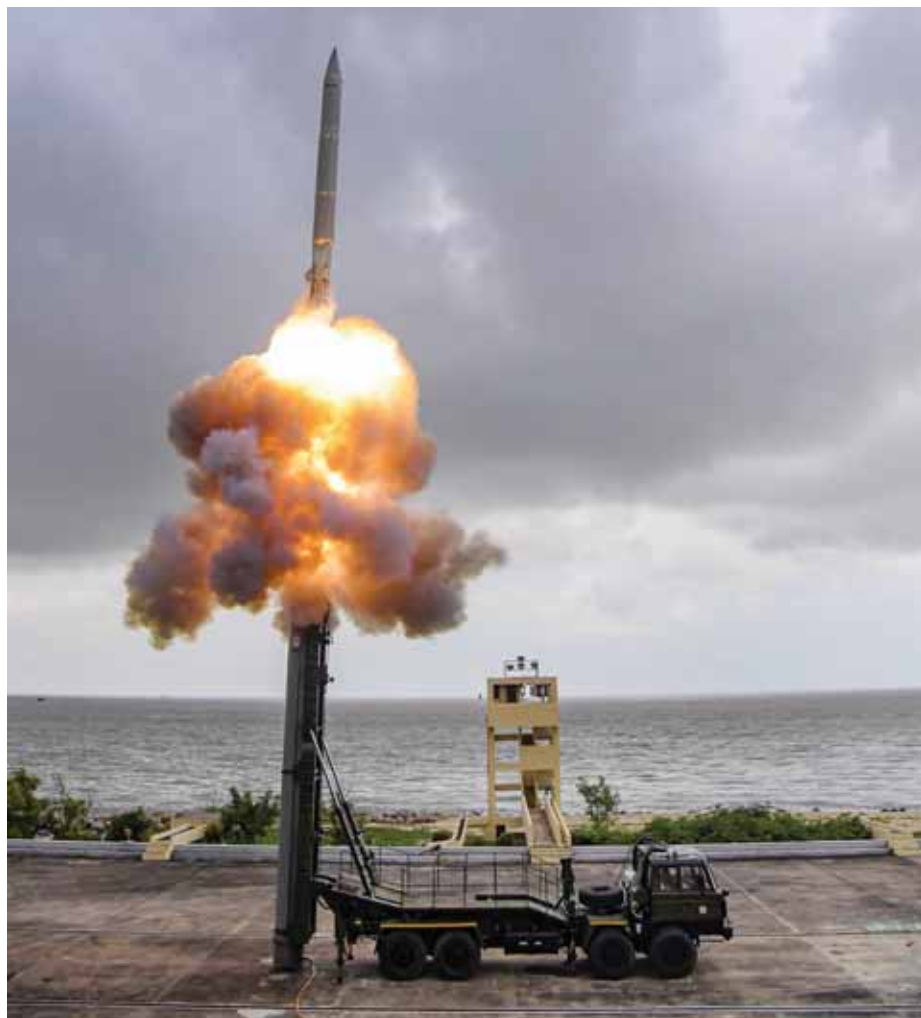
Defence Research and Development Organisation (DRDO) successfully flight-tests the Supersonic Missile Assisted Release of Torpedo (SMART) from Wheeler Island off the coast of Odisha