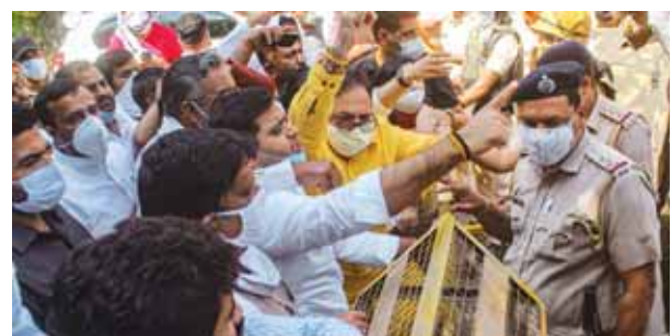
Police personnel try to stop Congress workers while they were marching toward Mahatma Gandhi statue during a protest over the gangrape and murder of a 19-year-old Dalit woman in Hathras, in Gurugram, on Monday

According to a press note issued by the BJP, the chief minister said that some of the recent incidents have exposed the conspiracy of such elements in this regard.