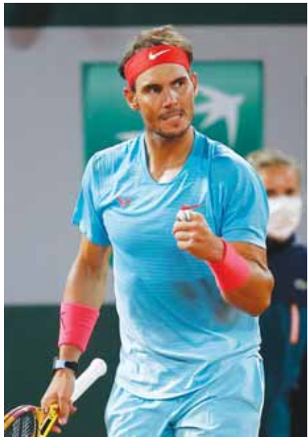
Rafael Nadal clenching his fist after winning the first set

Still, as much as Nadal wouldn't engage in a discussion about his chance to catch Federer after beating Diego Schwartzman 6-3, 6-3, 7-6 (0) in the semifinals Friday, he did acknowledge that "it's good for tennis" if others talk about it.