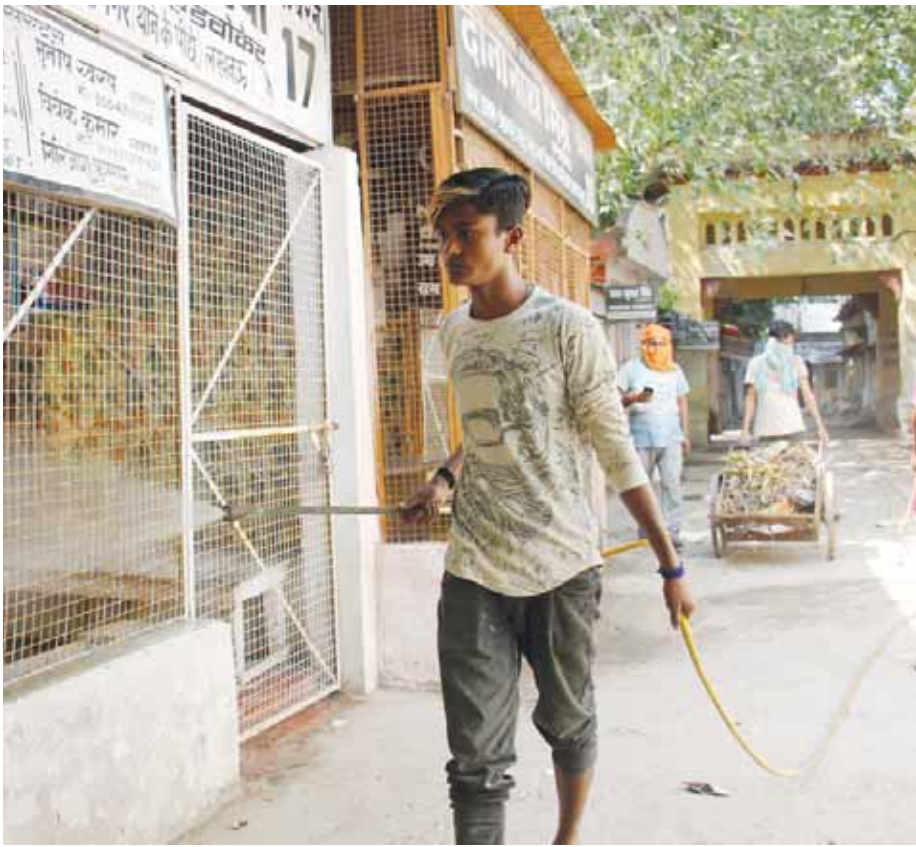
LMC workers conducting sanitisation inside family court premises on Saturday

Across the state, 3,099 persons tested positive, including