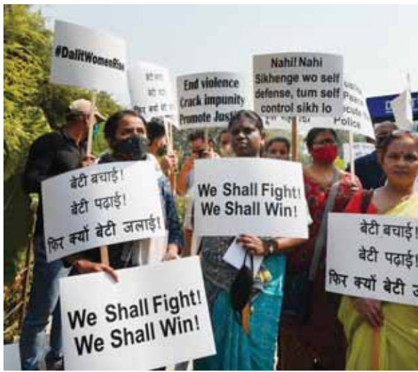
Activists hold placards during a protest demanding justice for the 19-year-old Dalit woman, who died after four men allegedly gangraped and assaulted her last month, at Ambedkar Bhawan in New Delhi on Saturday.

The law also enables the police to register an FIR or a "Zero FIR", in case the crime is committed outside the jurisdiction of police station, in the event of receipt of information on commission of a cognisable