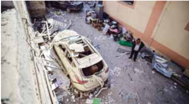
A man stands amongst the damage a day after shelling by Armenian's artillery during fighting over the separatist region of Nagorno-Karabakh in Ganja, Azerbaijan on Monday.