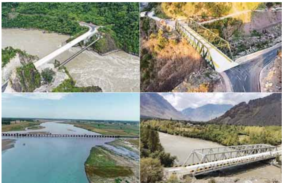
Four among 44 bridges, built by BRO across seven States and UTs, which were dedicated to the nation by Defence Minister Rajnath Singh on Monday

Defence Minister inaugurates 44 bridges, mostly in border areas, to boost military infrastructure