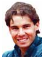
Tennis player —Rafael Nadal

Roland Garros means everything to me. We've played plenty of times together. One day wins one, another day wins the other.