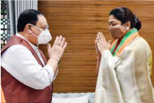
BJP national president JP Nadda greets Tamil film actress and former Congress spokesperson Khushbu Sundar at party HQ in New Delhi on Monday

"I will work like any other party workers," said the actress who also worked in Hindi films like Sunil Dutt-directorial 'Dard ka Rishta' wherein she played the role of his daughter.