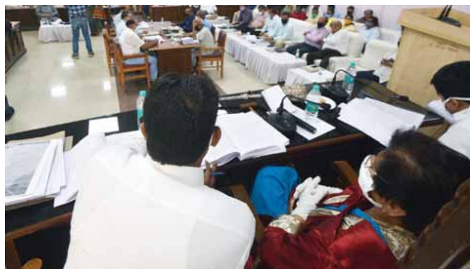
Mayor Sanyukta Bhatia presiding over LMC house session on Monday