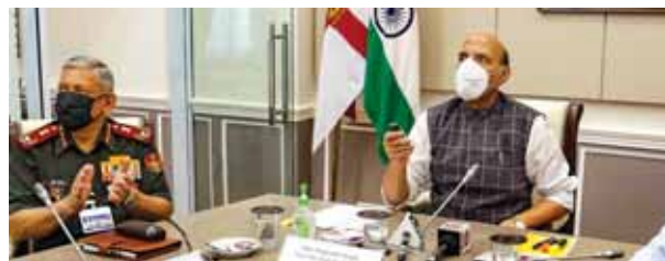
Defence Minister Rajnath Singh dedicates 44 major permanent bridges to the nation from New Delhi on Monday