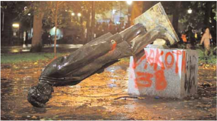
Statues of former presidents Theodore Roosevelt and Abraham Lincoln toppled by protesters in Portland's South Park Block.

Portland (US): Protesters overturned statues of former Presidents Theodore Roosevelt and Abraham Lincoln in Portland, Oregon, in a declaration of “rage” toward Columbus Day. Protest organisers on Sunday night dubbed the event “Indigenous Peoples Day of Rage,” in response to Monday’s federal holiday named after 15th-century Italian explorer Christopher Columbus, a polarising figure who Native American advocates have said spurred centuries of genocide against indigenous populations in the Americas. The group threw chains around Roosevelt’s statue, officially titled “Theodore Roosevelt, Rough Rider.” They