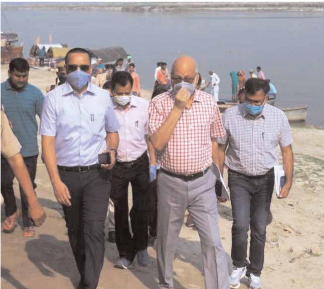
Divisional Commissioner, inspecting the Parmat Ghat on Monday.