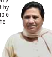
BSP leader —Mayawati

Like in Rajasthan, the attack on a temple priest in Gonda district by the land mafia to grab the temple land is shameful. Now, even the saints are not safe under the Government led by a saint.