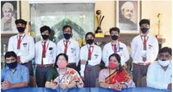
Jaipuria Public School Principal , teachers and students inform presspersons about Comfest on Tuesday.