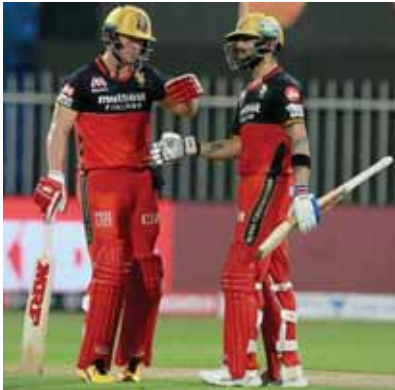
Virat Kohli congratulates AB de Villiers on fifty IPLT20

"I have been not out four times (three actually) in seven games which is probably never happened to me in the history of my career. So, it has been a strange transition for me batting at five and one that I feel, I have started to become more accustomed to."