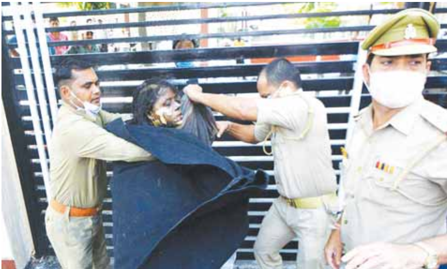
Policemen came to the rescue of woman who attempted to immolate herself