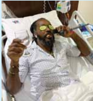
KXIP batsman Chris Gayle attends treatment for food poisoning Instagram Thursday) , a team source told PTI .

"He is fine now and it is likely that he will be playing the game against RCB (on