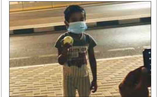
A young fan poses with the ball that was hit out of the Sharjah Cricket Ground for a big six by Royal Challengers Bangalore batsman Ab de Villiers in an IPL game on Monday @RCBTweets