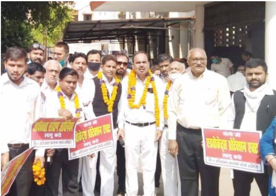
City lawyers take out Adhivakta march on Tuesday