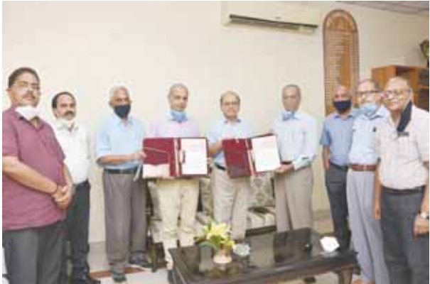
BHU, FAARD exchanging MoU papers at VC Lodge in Varanasi on Tuesday