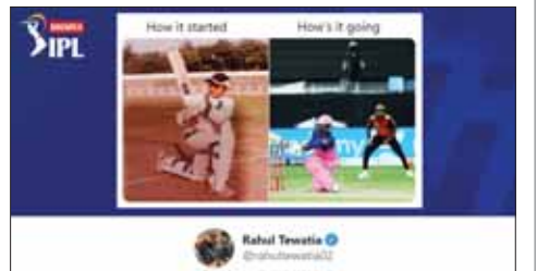
IPL Twitter handle share Rajasthan Royals Indian all-rounder Rahul Tewatia's throwback picture for 'How it started-How it's going' meme captioning 'Rahul Tewatia's inspirational journey'