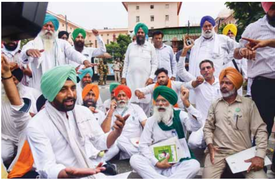
Farmers from Punjab stage a protest outside Krishi Bhawan after they walked out of a meeting with Agriculture Secretary over the new farm bills in New Delhi on Wednesday

Meanwhile, Union Minister Prakash Javadekar said the Government is always open for discussion with farm-