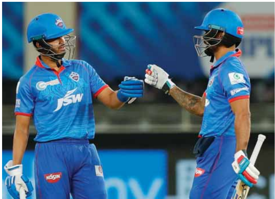
Shreyas Iyer congratulates Shikhar Dhawan after he completes his fifty against Rajasthan Royals