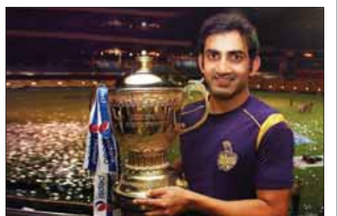
Kolkata Knight Riders wish former captain Gautam Gambhir on his 39th birthday. KKR won two IPL trophies (in 2012 and 2014) under Gambhir's leadership @KKRiders