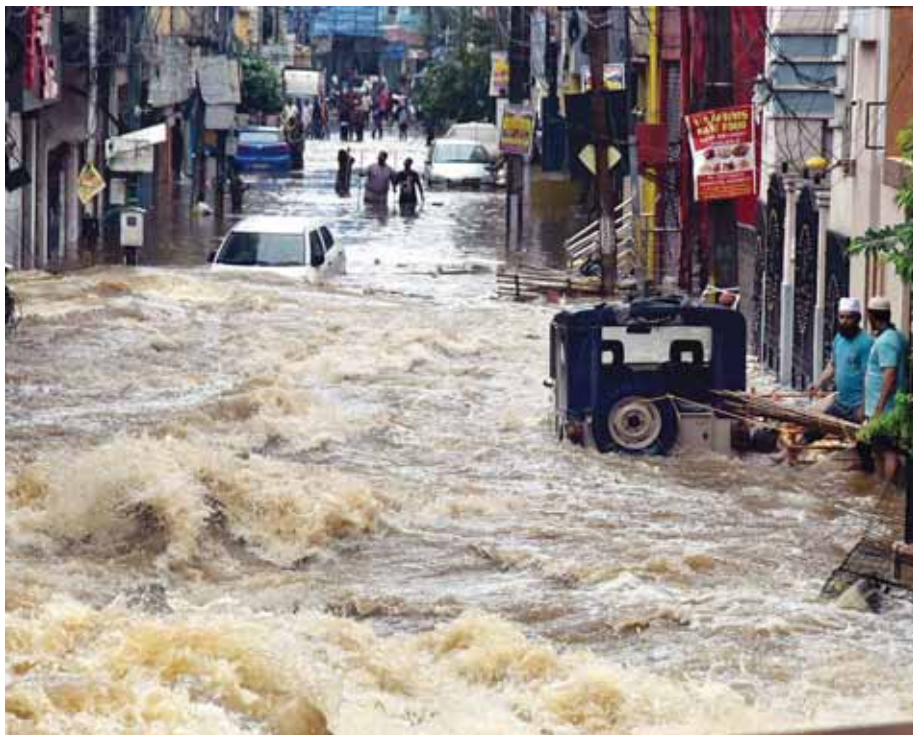
Floodwaters gush through a street following heavy rain at Falaknuma in Hyderabad on Wednesday