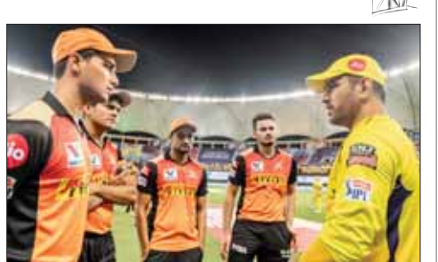
Sunrisers Hyderabad players Abhishek Sharma, Priyam Garg, Shahbaz Nadeem and Abdul Samad chat with Chennai Super Kings skipper MS Dhoni at the end of IPL game