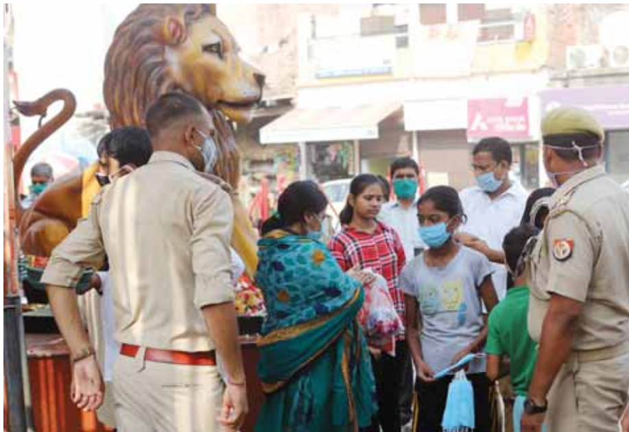
Devotees wear mask and sanitise before offering prayer to Alopsankari Devi on the occasion of Navratra at Alopipevi temple in Prayagraj

In Kalindipuram hospital a total of 19 patients were admitted while eight were discharged, in Railway Hospital 21 admitted and one discharged, in Beli 71 admitted, 10 dis-