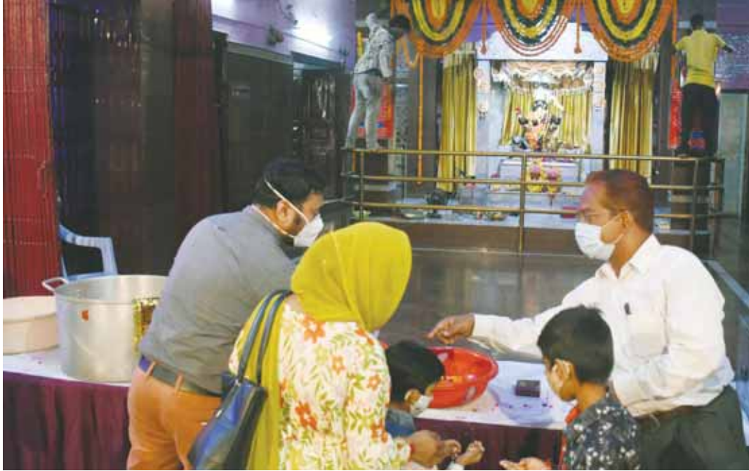
Devotees paying obeisance to the deity at Kail Badi temple in Lalbagh on the second day of Navratri on Sunday

“The nikah will not be valid whether the conditions are written in the nikah letter or not,” it declared. The Muslim youth was advised to forget the girl and not do anything against Islam.