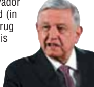
Mexican President —Andrés Manuel López Obrador

It is a very regrettable fact that a former Defence Minister (Salvador Cienfuegos) has been arrested (in the US), accused of links to drug trafficking. Of course, all of this must be proven.