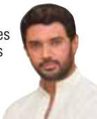
LJP chief —Chirag Paswan

I don't need to use Prime Minister Narendra Modi's photos for campaigning. He lives in my heart, I am his Hanuman.