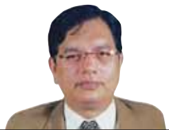
RAM KRISHNA SINHA

Nationalism, sans some of its ill-effects, has constructive potential to emerge as a powerful push for policy actions and reforms