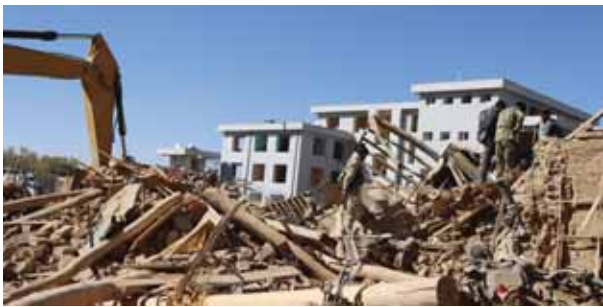
Afghan security inspects the site of a suicide car bombing in Ghor province western of Kabul, Afghanistan on Sunday