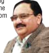
BJP president —JP Nadda

Be it the Congress party or any regional outfit, people are busy protecting brother-sister, mother-son, or the son. If a party office operates from a politician's residence, then the party belongs to that person.