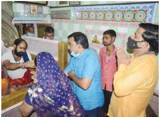
Devotees offering prayer at Brahmcharini Devi temple on second day of Navratra in Varanasi on Sunday

The state government has made a comprehensive action plan in this direction. The