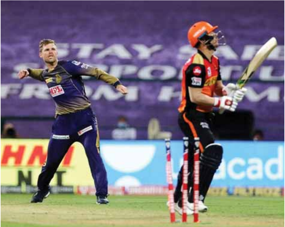
Lockie Ferguson celebrates the wicket of David Warner during IPL match at Sheikh Zayed Stadium on Sunday