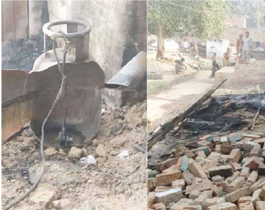
LPG cylinder exploded in a farmer's house in Derapur police area of Kanpur Dehat on Sunday morning.

As many as nine persons of a family sustained serious burns when the cooking gas cylinder of their house suddenly exploded in Sargaon Khurd village under Derapur police station of Kanpur Dehat on Sunday morning. Due to the powerful explosion, the room of the farmer's house also collapsed. The local cops and firemen extinguished the fire and sent the injured to a hospital. According to reports, Suraj Kumari, wife of farmer Jagdeo, was preparing breakfast when the LPG cylinder suddenly caught fire due to leakage of gas. Seeing the fire, she ran out of the kitchen raising an alarm. In the meantime, other household articles in the kitchen also caught fire. When the family members and neighbours were trying to extinguish the fire by pouring water on it, the cooking gas cylinder suddenly exploded and the ceiling of the kitchen collapsed. Jagdeo, Suraj Kumari, Himanshu, Kalloo, Arman, Vivek, Vishram, Ranno and