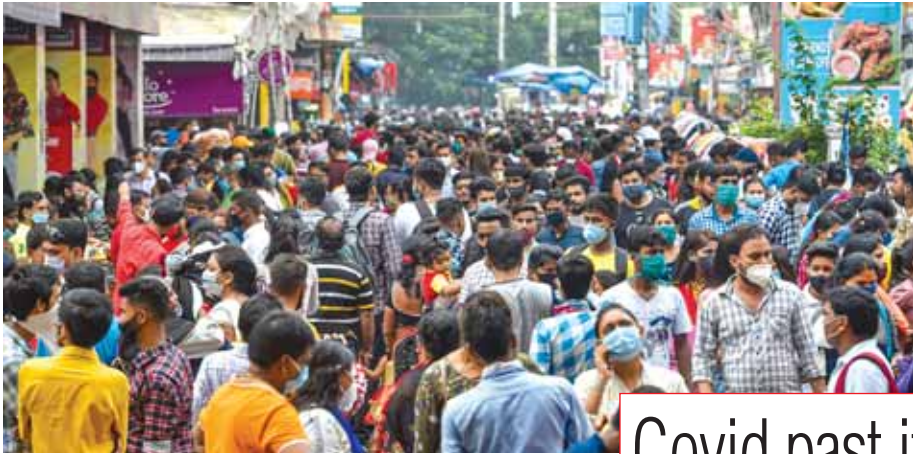
People shop at New Market area ahead of Durga Puja festival in Kolkata on Sunday