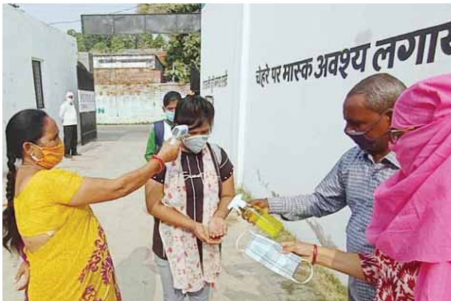
A student's hands being sanitised before entering the school in Prayagraj

At the same time, the sequence of health workers turning into Covid positives from corona warriors has been accelerated. Lab technician, pharmacist, SRN staff nurse, railway hospital nursing superintendent, IFFCO chief manager and two bank officers among others have been corona posi-