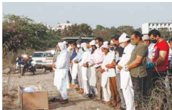
Relatives, along with graveyard workers, offer funeral prayers for a Covid-19 victim before his burial at a graveyard in New Delhi on Tuesday

"There has been no scarcity in oxygen supply in the last 10 months with the daily production capacity enhanced to