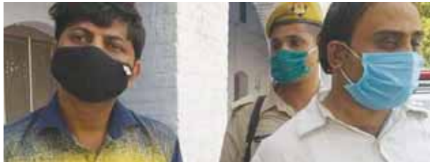
Accused of fake telephone exchange arrested by city police on Tuesday.