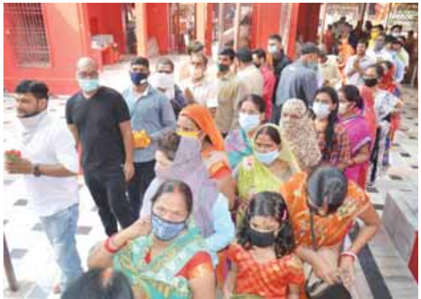
Devotees line up to offer prayer at Kushmanda Devi (Durga Kund) temple on fourth day of Navratra in Varanasi on Tuesday