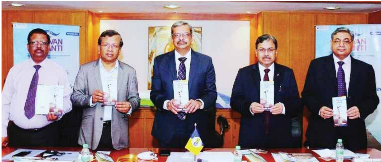
Life Insurance Corporation of India launched New Jeevan Shanti Plan on Thursday.