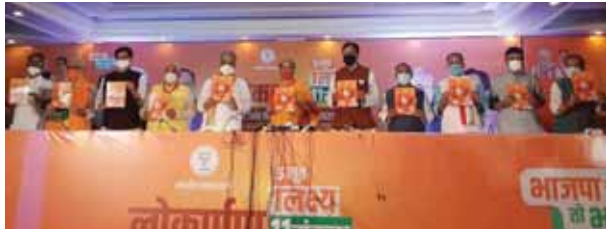
Union Finance Minister Nirmala Sitharaman releases manifesto for Bihar poll in the presence of senior leaders Bhupender Yadav, Nityanand Rai, Ashwini Choubey and Pramod Kumar in Patna

Earlier, RJD chief ministerial candidate Tejashwi Yadav had promised 10L Govt jobs