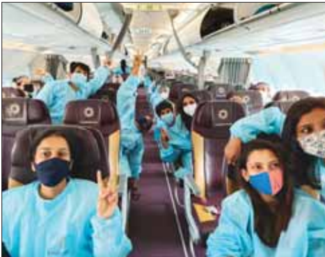
Indian women cricketers pose for photo after boarding flight to UAE for Women's T20 Challenge

The England players and staff are expected to be in quarantine for at least a week after arriving but will be allowed to attend training during that time.