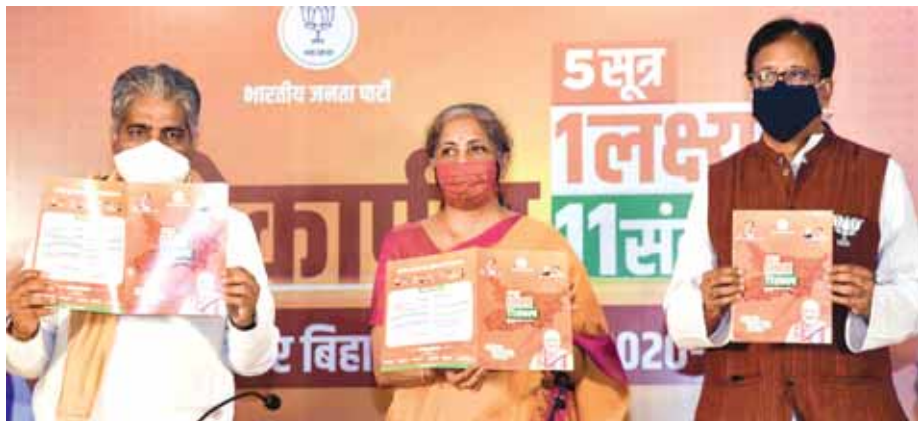
Union Finance Minister Nirmala Sitharaman, along with BJP general secretary Bhupendra Yadav and Bihar BJP president Sanjay Jaiswal, releases the party manifesto ahead of the Bihar Assembly elections, in Patna on Thursday

"GOI just announced India's Covid access strategy. Kindly refer to the State-wise election schedule to know when will you get it, along with a hoard of false promises," Congress leader Rahul Gandhi tweeted.