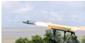
produce the NAMICA.

In the ongoing drive to hone operational readiness, India on Thursday successfully test fired the Nag anti-tank guided missile(ATGM). It was the final user trial of the indigenously designed lethal weapon system and will shortly be deployed at the Line of Actual Control(LAC)facing China.