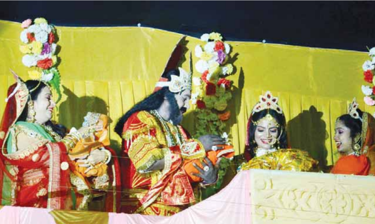
Artistes performing Ramlila at Katra in Prayagraj