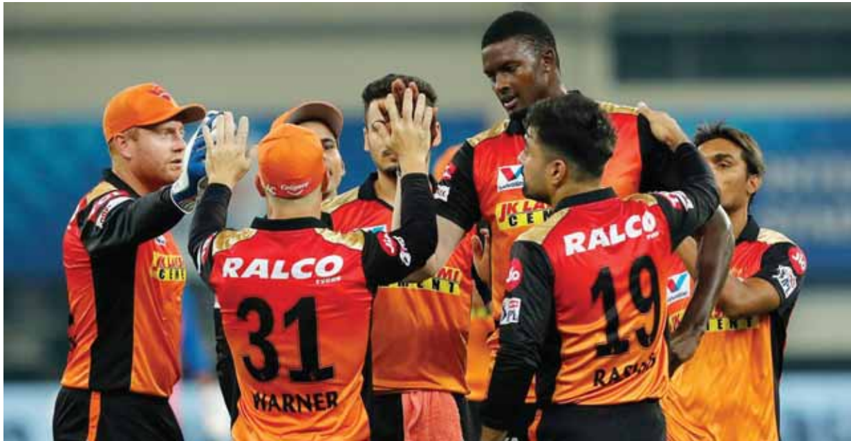
Jason Holder celebrates with his Sunrisers Hyderabad teammates after taking wicket of Rajasthan Royals batsman during IPL clash on Thursday