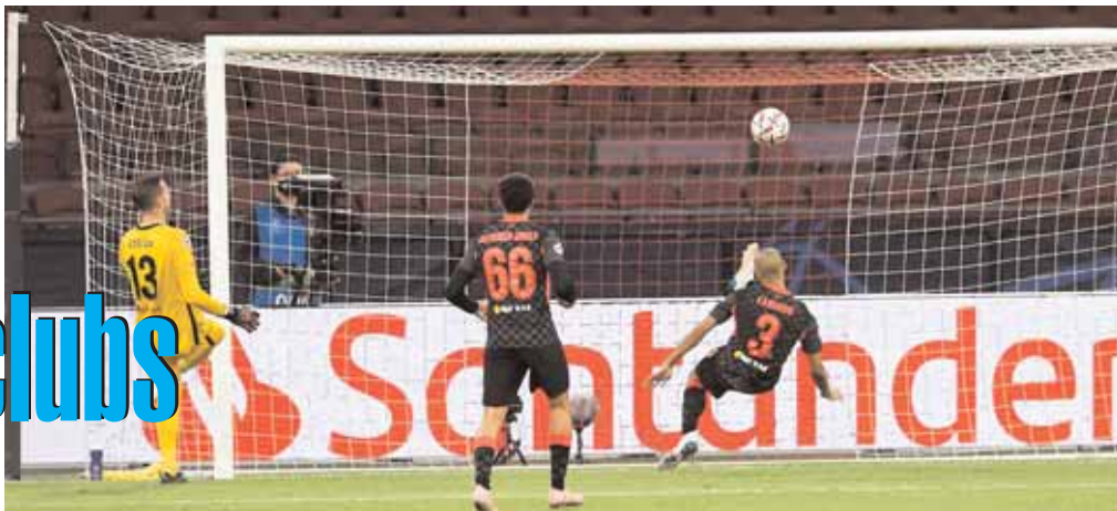
Liverpool's make-shift centre back Fabinho makes stunning goal line clearance to stop Ajax from equaliser goal during Champions League clash at Johan Cruyff Arena on Wednesday

Two months after scoring the winner in the final against Paris Saint-Germain in Lisbon, Kingsley Coman put Bayern ahead against Atletico in Group A and later scored a stunning individual effort