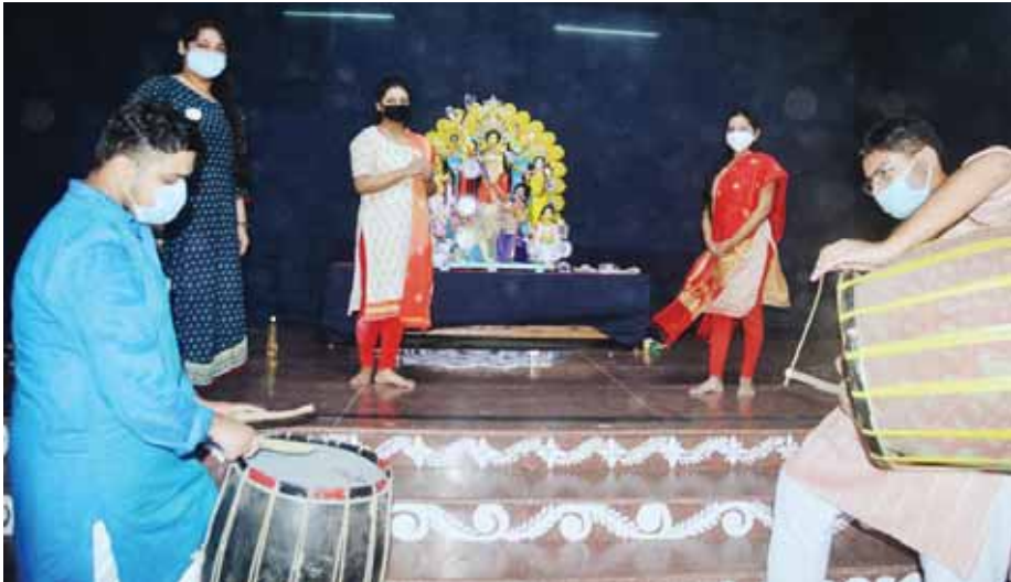
Idol of Maa Durga being installed at Jim Sporting (Bhelupur) in Varanasi on Thursday

Though the puja was started by the Bengalis, later on,