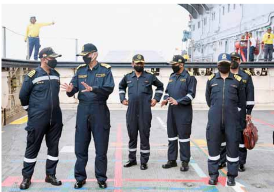
Admiral Karambir Singh (2nd L), the Chief of the Naval Staff (CNS), while reviewing the operational preparedness and combat readiness of the Indian Navy's principal combatants on Thursday

BJP leader Varun Gandhi took to Twitter and wished the Home Minister on his birthday: "Shri @AmitShah Ji's life has been one of great त्याग and tapasya towards making India prouder, stronger & more self-reliant. He is a perfect mix of tradition & modernity. May all divine blessings protect him & fill his path with happiness & peace. Happy birthday, Sir."