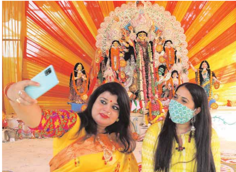
Women taking selfie in front of Devi Durga idol installed at a community puja pandal Kail Bari at Chittranjan Park in Delhi on Saturday

Border tussle between Mizoram and Tripura also witness during the past two weeks forcing the two states to deploy additional forces along the borders and promulgated prohibitory orders.