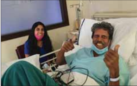
India's first World Cup-winning captain Kapil Dev is well on road to recovery after a successful emergency coronary angioplasty, and this is evident from a photo in which the legendary all-rounder is seen flashing a double thumbs up sign from his hospital bed