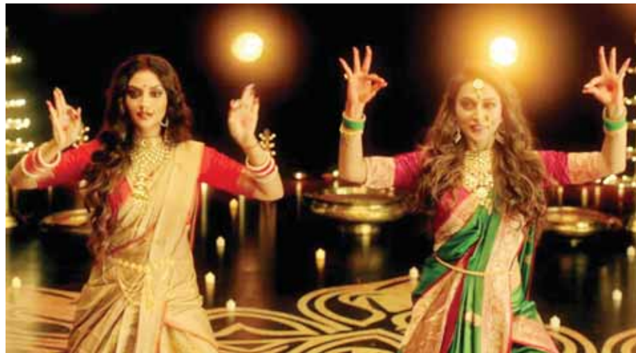
TMC MPs Nusrat Jahan, Mimi Chakraborty dance to traditional dhakis on Durga Puja Maha Ashtami in Kolkata

"As a nation, we all should think of the loss caused to the people and the country when such projects (Girnar ropeway) of public importance are stalled for a long time," he said, adding that the new project will facilitate the pilgrims and tourists, and create job opportunities.