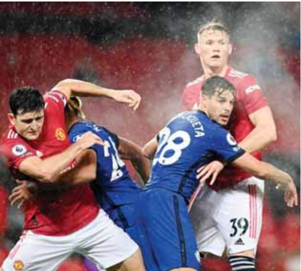
Man United's Harry Maguire, left, and Scott McTominay, right, jostle for position with Chelsea's Cesar Azpilicueta, second right, and Reece James during Premier League clash at Old Trafford

Those shots came either side of Azpilicueta — who fea-