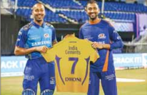
Pandya brothers Hardik and Krunal pose with CSK skipper MS Dhoni's jersey at the end of IPL match between Mumbai Indians and Chennai Super Kings