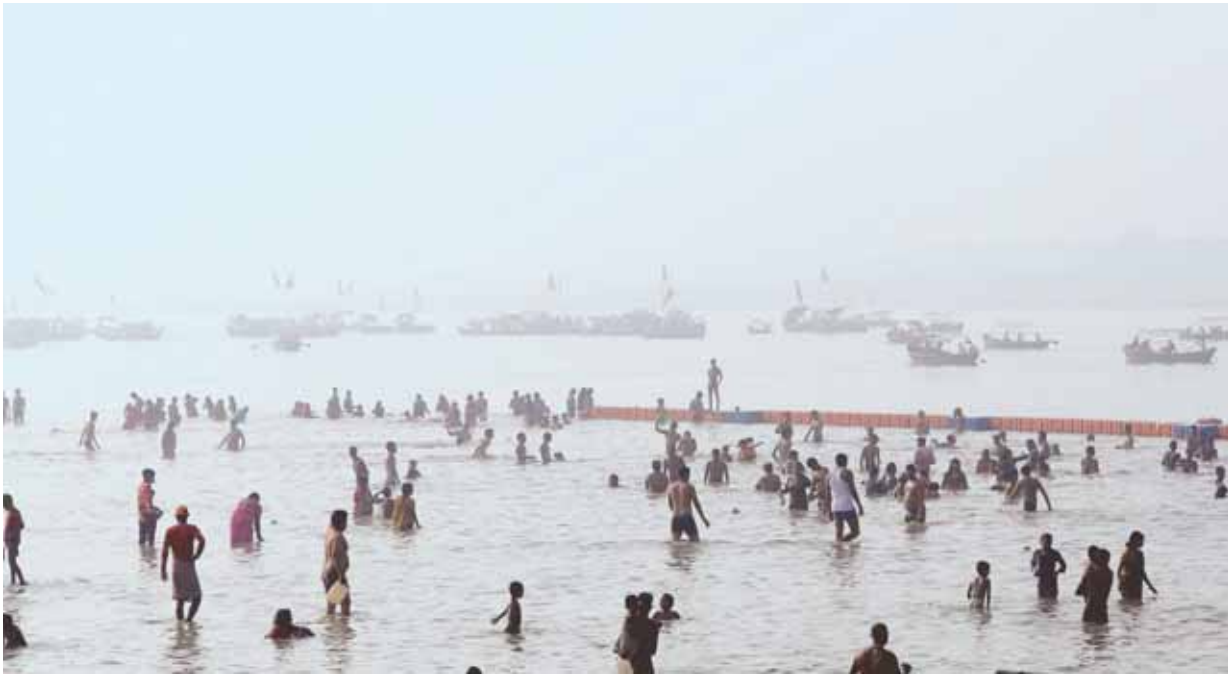
Devotees take holy dip in the Ganga river on the occasion of Ashtmi during Navratri in Prayagraj on Saturday