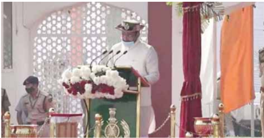
Junior Home Minister G Kishan Reddy addresses ITBP force on its 59th Raising Day at paramilitary's facility in Greater Noida

"This has taught us that the enemy can raise its head anytime, anywhere and we should be fully prepared to face any possibility." The ITBP is an important pillar of that preparedness of the country,"