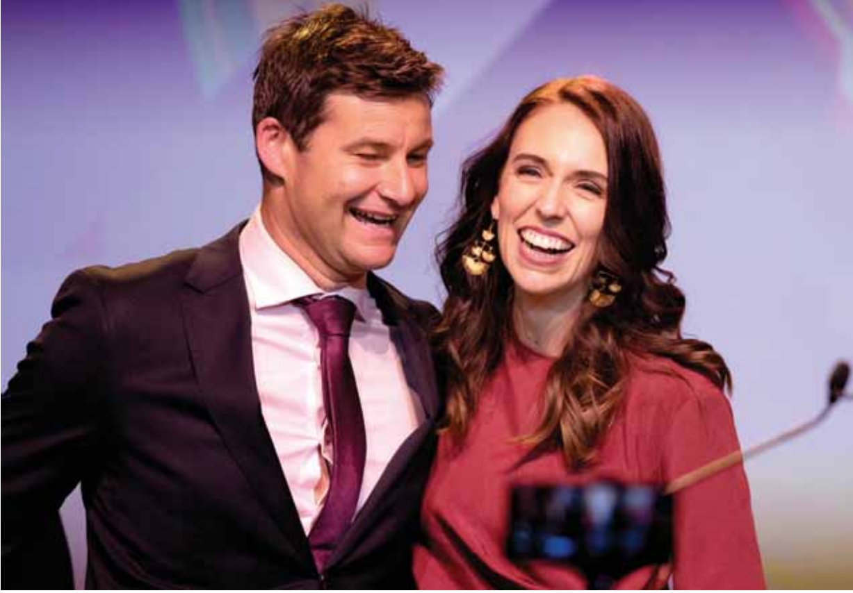
New Zealand Prime Minister Jacinda Ardern is congratulated by her partner Clarke Gayford following her victory speech to Labour Party members at an event in Auckland on October 17

Second, when a volcanic eruption rocked the White Island or Whakaari, a small volcanic Isle in New Zealand's