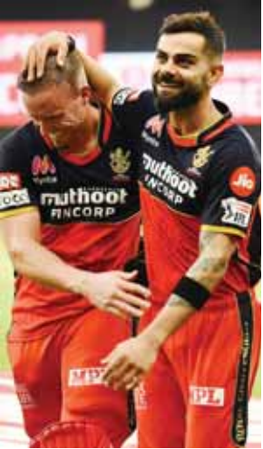
Virat Kohli & Ab de Villiers

They run into a RCB squad which has grown in confidence as the tournament has progressed. Virat Kohli and his men are placed third on the points table with 14 points, the same as