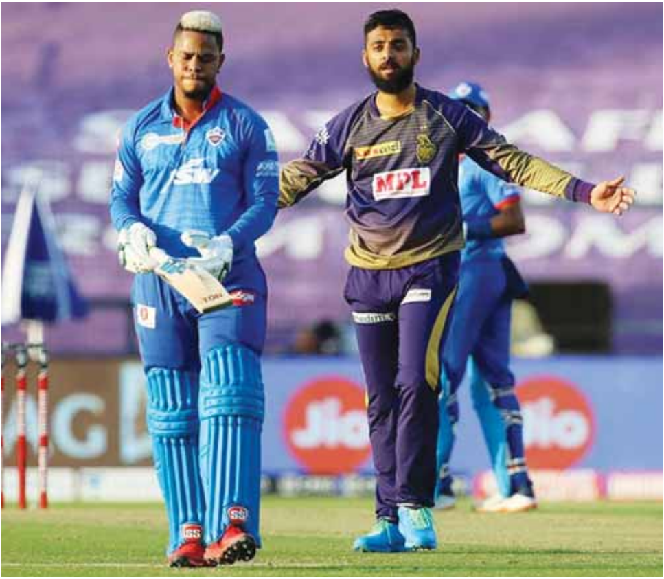
Varun Chakravarthy reacts after he dismiss Delhi Capitals Shimron Hetmyer during run chase on Saturday

The spinner opened his account after Pant holed out at deep square leg and in his next over he got two in two, dismissing Shimron Hetmyer (10) and Iyer off consecutive balls.