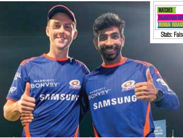
Trent Boult & Jasprit Bumrah pose for photo after win against CSK

But Rohit's absence was hardly felt on Friday as the young Ishan Kishan (261 runs) launched into CSK bowlers with gusto.