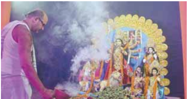
Puja being offered at Durga Puja pandal at Pandey Haveli on Ashtmi in Varanasi

The rush was mainly seen in Lahurabir, Sagra, Luxa, Godowlia, Sonarpura-Bhelupur, Maidagin, and many areas in trans-Varuna area including Shivpur, Pandeypur, Orderly Bazar, Pahadihya and some others. As the city has been extended a lot in trans-Varuna, several pandals were set up at Shivpur Mini Stadium, Orderly Bazar and Pandeypur but they did not invest such huge amount on their pandals this time as they generally did in the previous years. In many pandals, though all the traditional rituals were performed by the puja samiti members, the visitors were only asked to