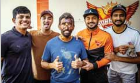
Wriddhiman Saha poses for photo with his Sunrisers Hyderabad teammates Priyam Garg, Abhishek Sharma, Manish Pandey and Khaleel Ahmed after his birthday celebrations