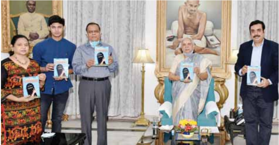
Governor Anandiben Patel releasing a book titled ‘Bye Bye Corona’

“Cartoons are the most effective way of communicating with human beings as they not only tickle us but are also capable of delivering tough messages in a simple, subtle and riveting manner. Human mind is hard wired to take their messages on board ahead of other forms of communication. A science toon is a cartoon communication based on science. Science toons are meant to inform and sensitive people about science and scientific concepts in an intelli-