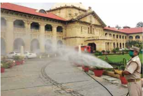
Policeman sanitising Allahabad High Court campus in Prayagraj (File photo)

On Wednesday, the list of Corona-infected people included