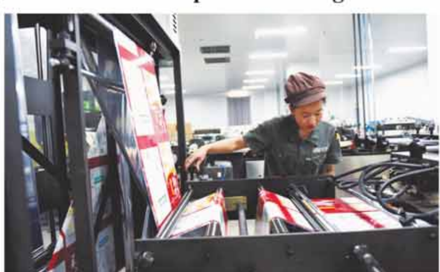
In north China's Hebei Province, a worker is busy making pet-product packing boxes in a factory.

will help China build a complete domestic supply and demand system and meet people's growing need for a better life. "Domestically, China will focus on meeting people's needs as well as boosting technological innovation to create new engines of growth," Zhang said. "On the external side, China will continue to expand opening-up and build an open economic system at higher levels. Under the new development pattern, China will open its doors wider to the outside world instead of simply seeking self-sufficient domestic development." More effort will be made to boost domestic demand, spur consumer buying, open more industries — including finance — to foreign investors and gain a key edge in global competition. Wang Changlin, president of the Academy of Macroeconomic Research of the National Development and Reform Commission, said China's new economic initiative is not intended