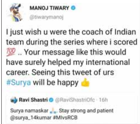
Former cricketer Manoj Tiwary praised Team India head coach Ravi Shastri’s tweet on Suryakumar Yadav after his match-winning knock against Royal Challengers Bangalore