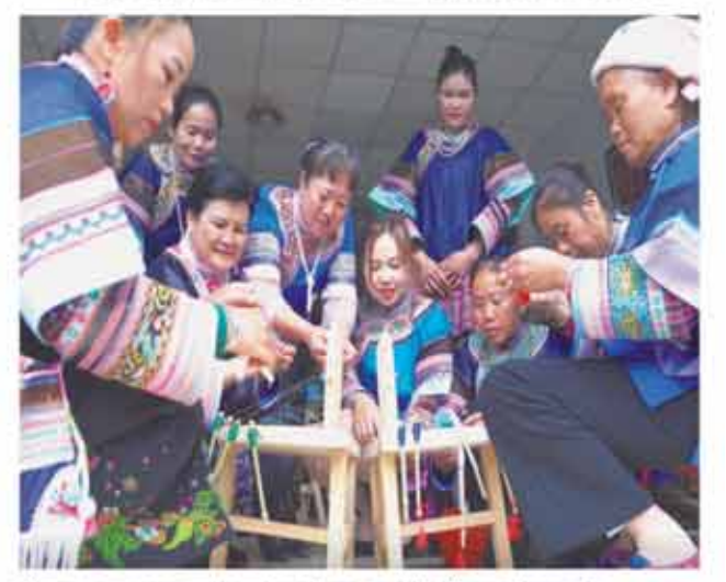
Zhuang women are learning how to make Zhuang brocade.