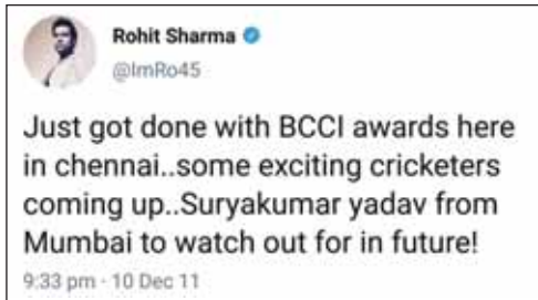
Rohit Sharma knew it way before that Suryakumar has the potential to be a big player. In his tweet that he posted way back in 2011, Rohit Sharma had stated that his IPL and state teammate Suryakumar would be a player to watch out for in future.