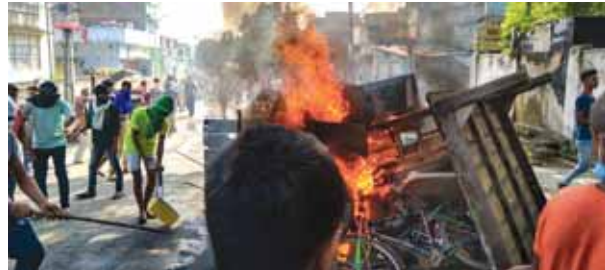
Protesters set on fire furniture after clashes with the police over immersion of Goddess Durga idols in Munger on Thursday