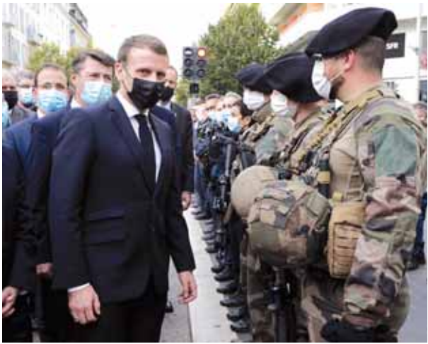
French President Emmanuel Macron meets soldiers after a knife attack at Notre Dame church in Nice, southern France, on Thursday

It was the third attack in two months in France that authorities have attributed to Muslim extremists, including the beheading of a teacher. It comes during a growing furor over caricatures of the Prophet that were republished in recent months by the satirical newspaper Charlie Hebdo, renewing vociferous debate in France and the Muslim world over the depictions that Muslims consider offensive but are protect-