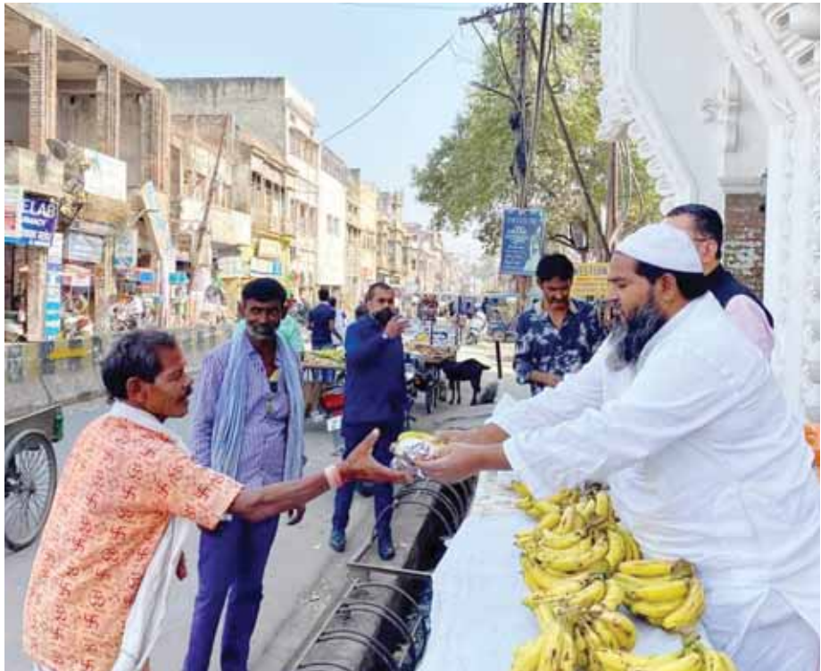
Fruits being distributed on the eve of Prophet Mohammed’s birth anniversary, popularly known as Eid-e-Milad-un-Nabi, in Lucknow on Thursday

The mayor later visited Alambagh Gurdwara and told the Gurdwara Prabandhak Committee that they could submit any project of any museum or monument which could inspire the coming generations then she would take up the project for posterity. The renaming coincided with the 550th Prakash Utsav of Guru Nanak Dev.