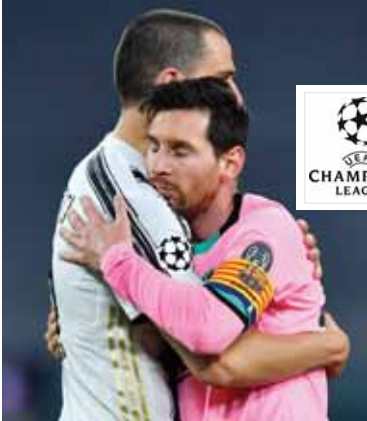
Lionel Messi hugs Leonardo Bonucci after Barca beat Juventus in Turin on Wednesday

Ronald Koeman’s side had luck on their side as they took the lead through a deflected Ousmane