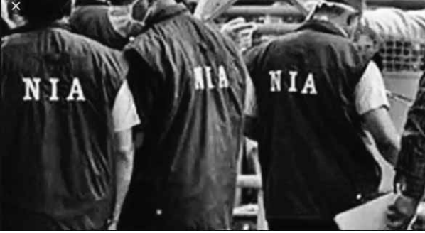
After completion of investigation, the NIA had filed chargesheets against 16 accused persons in 2016-2017

"This case had a huge impact on the like-minded people who were likely to join ISIS. After the arrest of the ISIS terrorists, their activities were