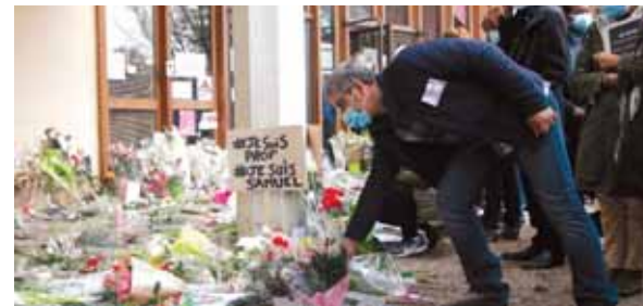
A man lays a flower outside the school where a slain history teacher was working, in Conflans-Sainte-Honorine, Paris, on Saturday

France's anti-terrorism prosecutor's office said authorities investigating the killing of Samuel Paty in Conflans-Sainte-Honorine on Friday also arrested nine suspects, including the teen's grandfather, parents and 17-year-old brother. Paty had discussed carica-