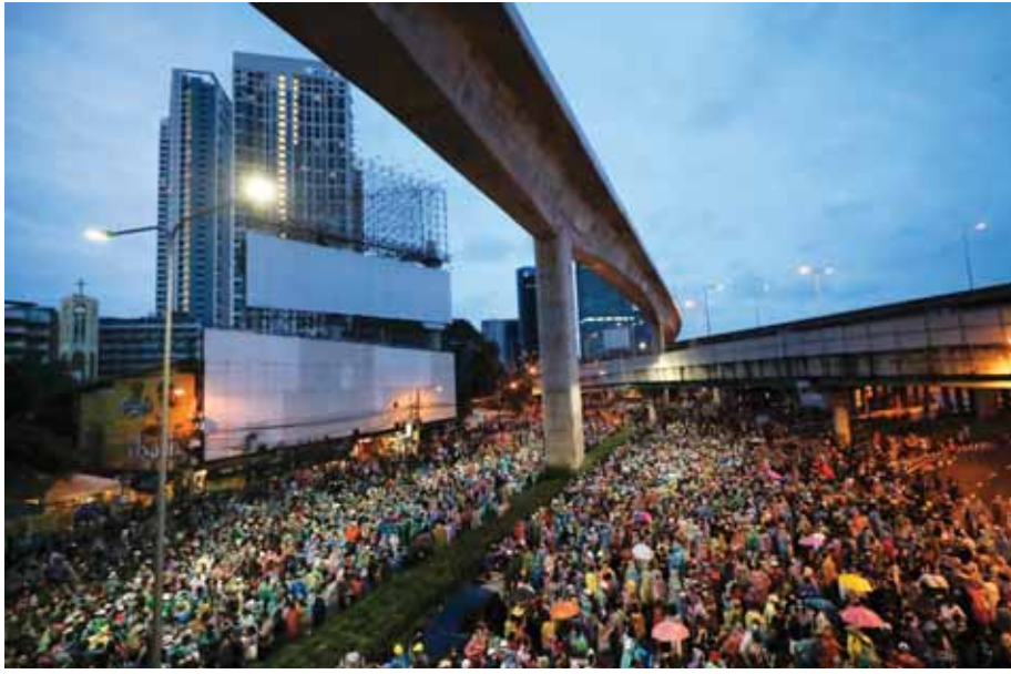
Pro-democracy protesters gather during a protest in Bangkok on Saturday

govern for all New Zealanders. “We are living in an increasingly polarized world, a place where, more and more, people have lost the ability to see one another’s point of view,” she said. “I think in this election, New Zealanders have shown that this is not who we are.” A record number of voters cast early ballots in the two weeks leading up to the election. On the campaign trail, Ardern was greeted like a rock star by people who crammed into malls and spilled onto streets to cheer her on and get selfies with her. Her popularity soared earlier this year after she led a successful effort to stamp out the coronavirus. There is currently no community spread of the virus in the nation of 5 million and people are no longer required to wear masks or social distance. AP