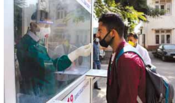
A health worker collects a nasal swab sample to test for Covid-19 at a Government hospital in Jammu on Saturday

The PMO said two pan-India studies on the Genome of SARS-CoV-2 (Covid-19 virus) in India conducted by ICMR and Department of BioTechnology (DBT) suggest