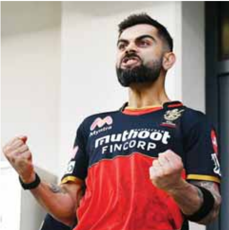
Skipper Virat Kohli reacts after RCB win

"I didn't hit even one of them (sixes) off the mid-