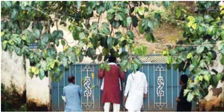
People outside Kelly Bungalow where RJD chief Lalu Prasad is lodged at RIMS, Ranchi.

Kelly bungalow became the new address of Lalu Prasad where he was shifted in August from the paying ward of RIMS to protect him from Covid-19 infection.