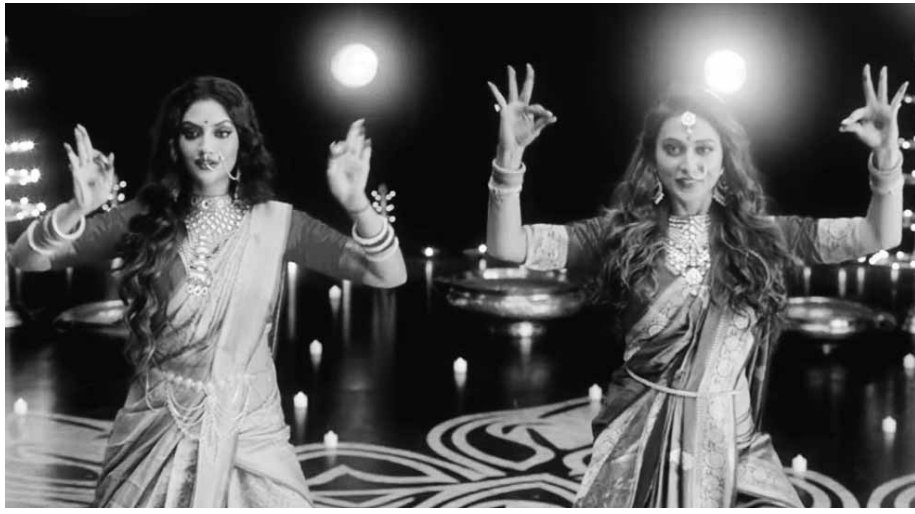
TMC MPs Nusrat Jahan, Mimi Chakraborty dance to traditional dhakis on Durga Puja Maha Ashtami in Kolkata

“As a nation, we all should think of the loss caused to the people and the country when such projects (Girnar ropeway) of public importance are stalled for a long time,” he said, adding that the new project will facilitate the pilgrims and tourists, and create job opportunities.