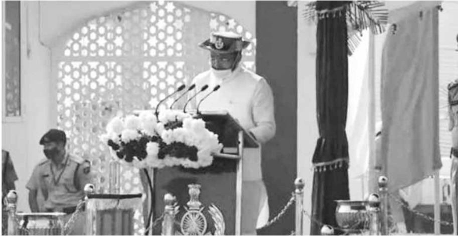
Junior Home Minister G Kishan Reddy addresses ITBP force on its 59th Raising Day at paramilitary’s facility in Greater Noida

The senior official’s remarks came in the midst of a growing global concern over China’s expansionist behav-