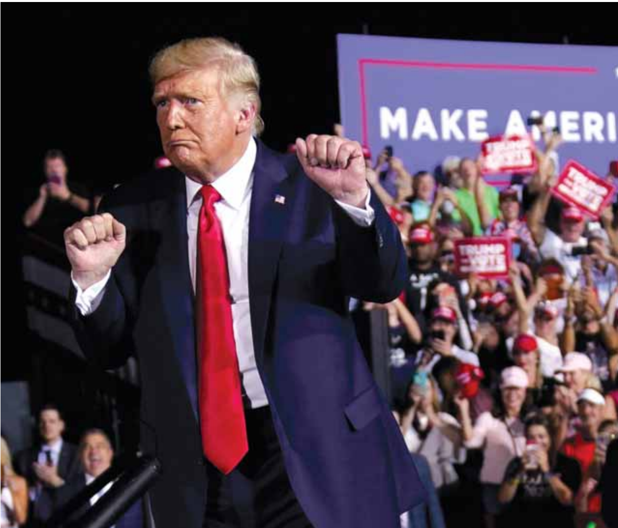
President Donald Trump dances after a campaign rally at Pensacola International Airport in Pensacola on Friday

It was in 2016 that the presumptive candidate, Hillary Clinton, was leading till late in the US elections but the white collared vote along with the ecclesiastical support base of the WASP majority let him sail through with the flailing Star-Spangled Banner. Will it be the same fate of the US elections in line with what transpired in the 2016 contest with Hillary Clinton? This happens to be a million dollar question. Al