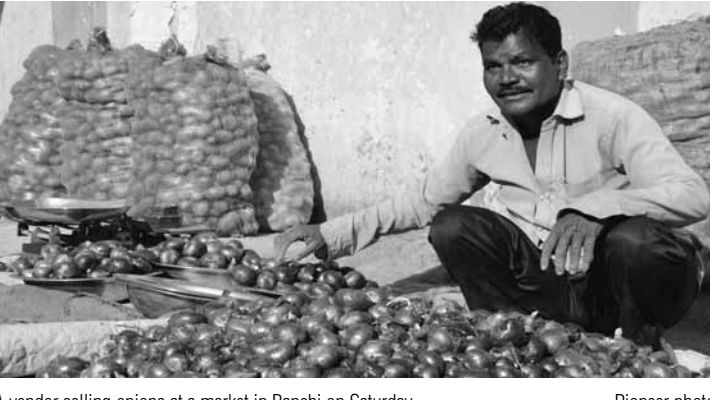
A vendor selling onions at a market in Ranchi on Saturday

Significantly, the traders of the wholesale market of onion are saying that there is no hope of relief for a month at the moment. It is estimated that the onion will be expensive till the new crop comes. The cost of onion will increase due to shortage, because after Navratri, its consumption can increase more rapidly. The government has banned the export of onion, but it does not have much effect.