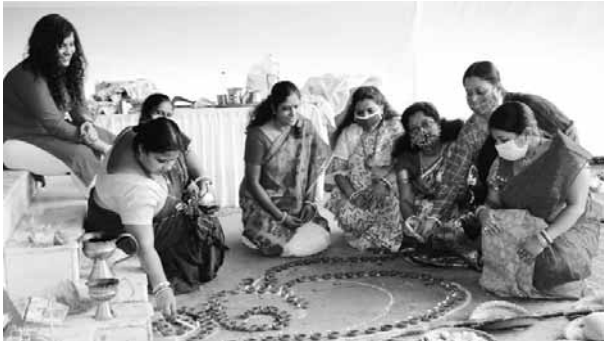
Durga Puja Committee.

“Though due to Covid-19 we are taking every precaution but still we are doing our best to give a traditional feel to the pandals. When it comes to the celebration the creative talents of artists get a free flow, bringing out an array of interesting pandals by each of the more than 300 puja samitis in the city every year,” said a member of