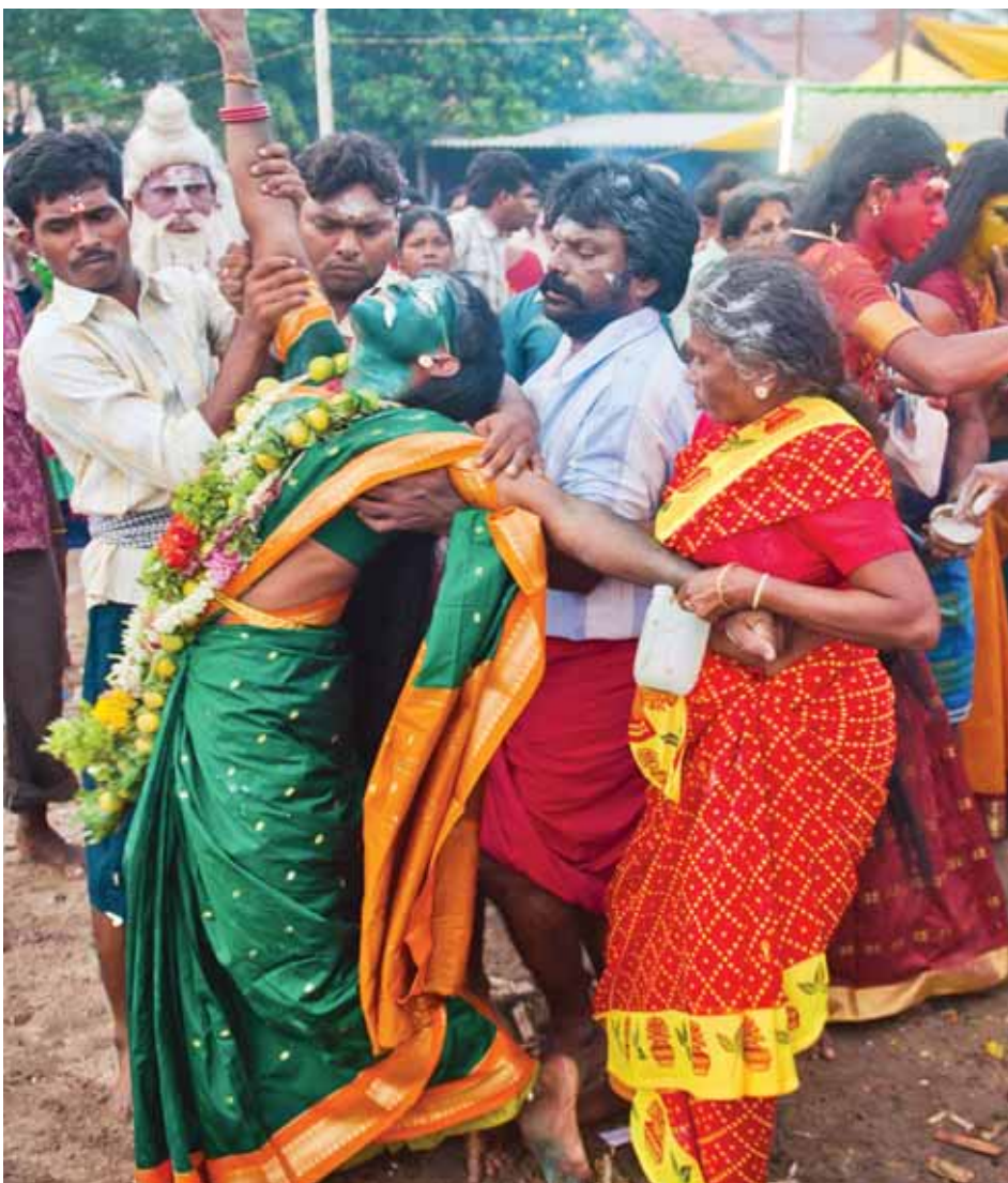
Once a person wears the Kali outfit, they go into a state of trance and start dancing almost maniacally. It is said that the Goddess Kali possesses whoever wears the Kali outfit and those people become manifestations of her divine form