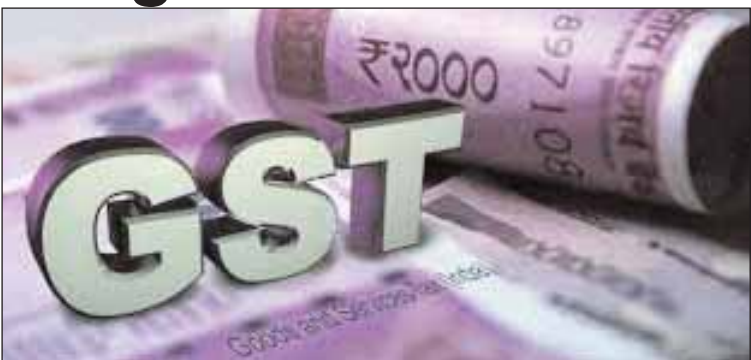
"In view of the same, on the recommendations of the GST Council, it has been decided to extend the due date for filing

(Form GSTR-9) and Reconciliation Statement (Form GSTR-9C) for FY 2018-19. The representations have been made on the grounds that due to the COVID-19 pandemic related lockdown and restrictions, normal business operations have still not been possible in several parts of the country, it said. The statement said it has been requested that the due dates for the same be extended beyond October 31, 2020 to enable the businesses and auditors to comply in this regard.