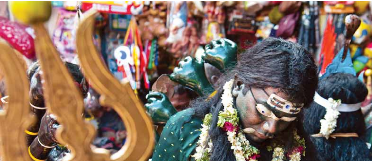
The trident represents the three supreme beings of Hindu Mythology, which are Brahma, Vishnu and Shiva. It is also said to represent the past, present and the future, the seven chakras and the three energy channels of Ida , Pingala and Sushmana