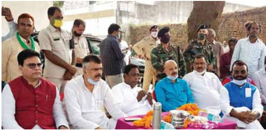
Rural Development Minister Alamgir Alam alongwith Congress party leaders during an election campaign at Bermo on Saturday.