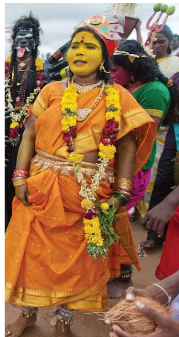
A number of villages and towns in Tamil Nadu field participants during the festival who divide themselves into groups of 6-10 people. These people dress up as mythological characters, saints and Goddess Kali. An accompanying orchestra team that loudly announces their arrival and presence further enhances this procession