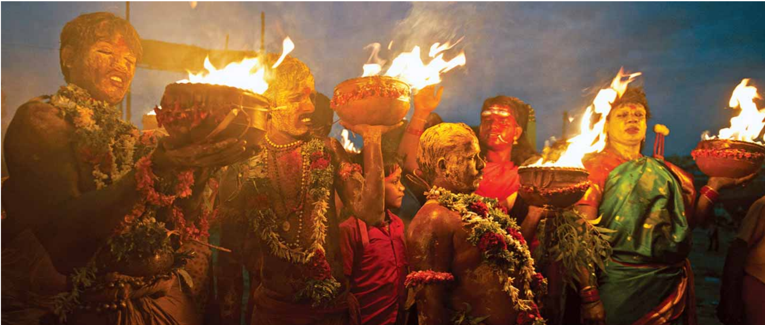
Devotees carry fire in earthenware pots and bowls, as fire is considered holy in Hindu mythology and is used during the festival to signify purity and the new beginnings that it brings

IT'S NOT THAT GOOD DOESN'T TRIUMPH OVER EVIL, IT'S THAT THE POINT SPREAD IS TOO SMALL — BOB THAVES