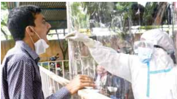
A medic collects swab samples from a person for COVID-19 test, amid the ongoing Unlock 5.0, in Ranchi on Saturday