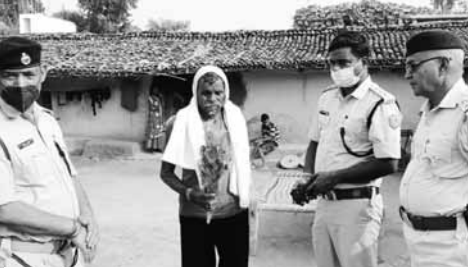
SDPO (in blue mask) and team at a martyr's family in Paton.