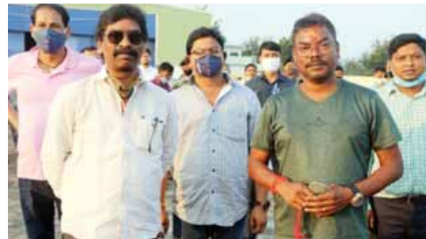
Chief Minister Hemant Soren alongwith JMM candidate of Dumka constituency Basant Soren during an election campaign in Dumka on Saturday

Targeting the BJP Soren said that there should be a limit to telling lies. "People change parties, election symbols, colour of flags etc but by changing all these a person's thought process also changes. Our principal opposition party BJP has