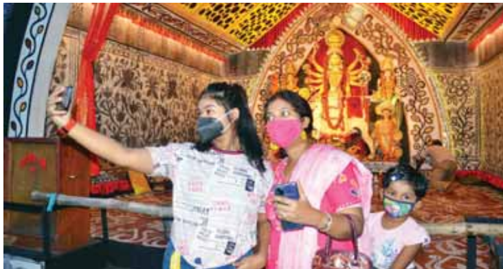
Devotees take a selfie outside a Puja Pandal in Ranchi on Saturday

"This is for the 50th year that we would be conducting Durga Puja festivities and were looking forward to hold grand celebrations. Keeping the present situation in mind, the festival will not be celebrated like every other year this time. Arrangements for online darshan through our Facebook page YouTube channel- OCC Club and Durga Puja Pandal Committee