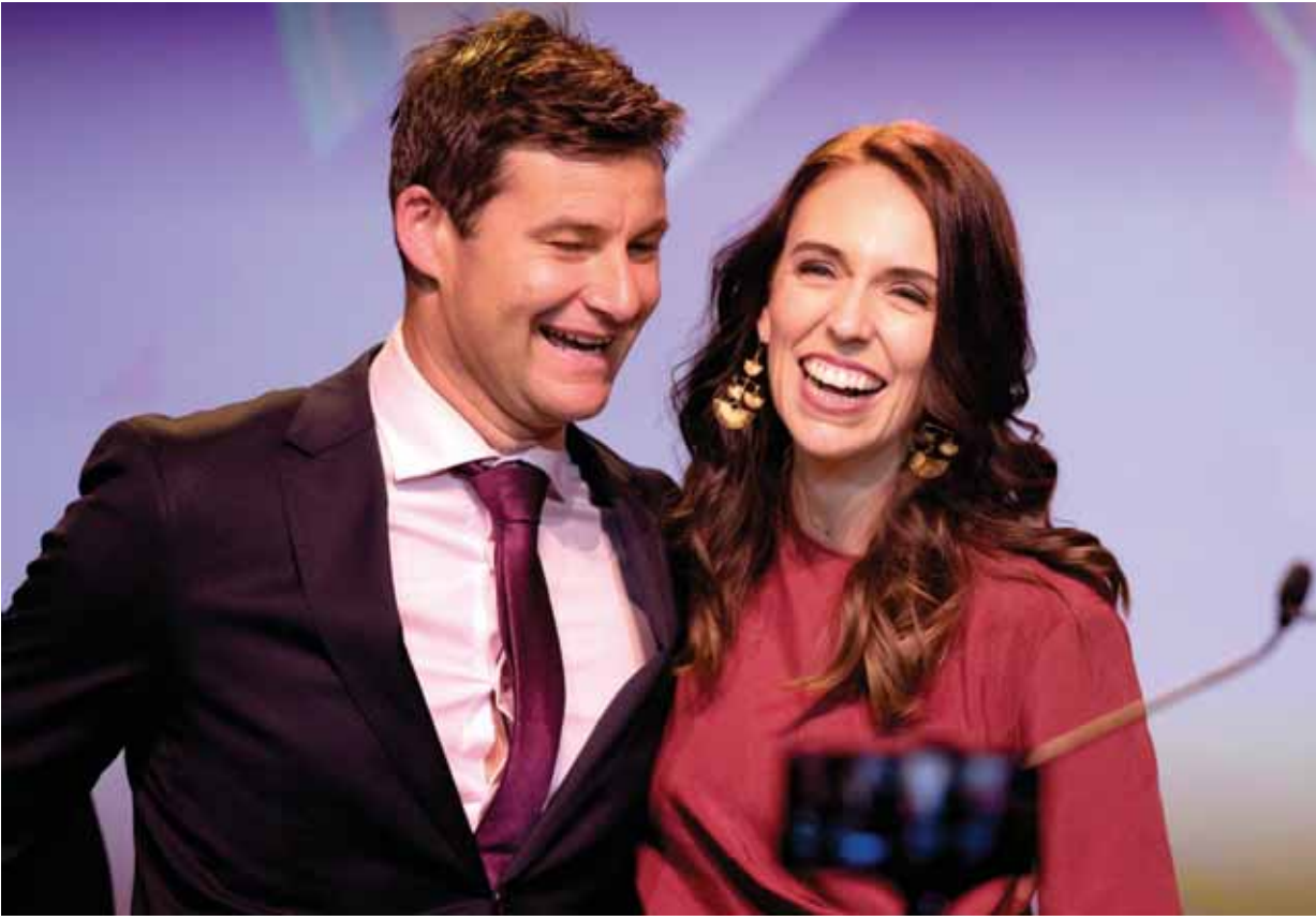
New Zealand Prime Minister Jacinda Ardern is congratulated by her partner Clarke Gayford following her victory speech to Labour Party members at an event in Auckland on October 17

Second, when a volcanic eruption rocked the White Island or Whakaari, a small volcanic Isle in New Zealand’s