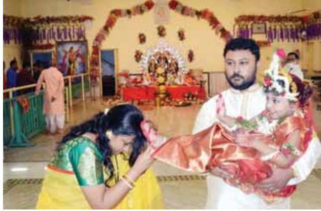
A woman performs 'Kumari Puja' at a Durga Puja pandal during the ongoing Durga Puja festival, amid the coronavirus pandemic in Ranchi on Saturday.

Targeting families from the weaker section of the society, the committee members are identifying beneficiaries who are being blessed with a girl child in Sadar Hospital, Sewa Sadan and other places where people from well-off families do not go for delivery.