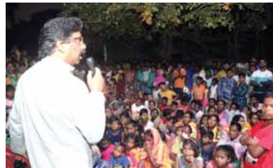
Chief Minister Hemant Soren addresses villagers during an election campaign, ahead of the Dumka bypoll, in Dumka on Tuesday

The CM is going all out to ensure victory of his younger brother Basant Soren, who is contesting from Dumka on JMM's ticket after the seat was vacated by the Sr Soren. Santhal Pargana being a stronghold of the JMM, the prestige of the party is attached with the