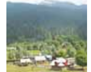
August last year, non-residents could not buy any immovable property in Jammu & Kashmir.

Before the Abrogation of Article 370 and Article 35-A in