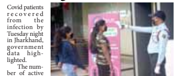
Covid patients recovered from the infection by Tuesday night in Jharkhand, government data highlighted.

While the number of Covid casualties has been on the rise in Jharkhand, the state's recovery rate too has improved significantly. The Covid-19 recovery rate in the state reached 93.66 per cent on Tuesday against the national Covid recovery rate of 90.60 per cent. As many as 93,974