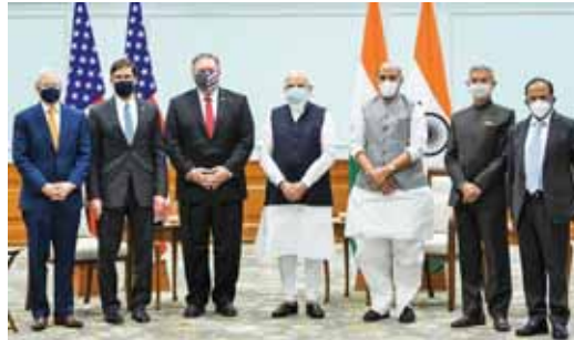
Prime Minister Narendra Modi with US Secretary of State Mike Pompeo and US Defence Secretary Dr Mark T Esper during a meeting. In New Delhi on Tuesday, External Affairs Minister S Jaishankar, Defence Minister Rajnath Singh, National Security Adviser Ajit Doval and US Ambassador to India Ken Juster are also seen

In a joint statement later, the two nations reaffirmed their commitment to fight the scourge of terrorism and resolved to jointly face the challenge posed by the coronavirus pandemic. The two countries discussed ways to further strengthen four pillars of the Strategic Energy Partnership (SEP) covering Oil & Gas, Power and Energy Efficiency, Renewables and Sustainable Growth. Pompeo said the US "stands with India to deal with any threat."