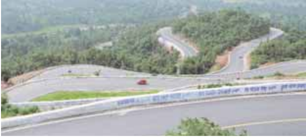
A view of Ranchi-Patratu serpentine highway

Nestled in Deoghar in the S a n t h a l Pargana, Baba B a i d y a n a t h dham is one of 12 Jyotirlingas of Lord Shiva. The temple complex has one main temple of Baba Baidyanath, along with 21 other temples. The Jyotirlinga is in the main temple.