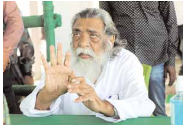
JMM Chief and Rajya Sabha MP Shibu Soren during an election campaign meeting ahead of the Dumka bypoll, in Dumka on Thursday

"What do you want from us? Do you want us to leave mainstream politics here?" former Chief Minister Omar Abdullah asked.