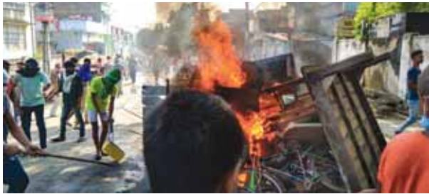
Protesters set on fire furniture after clashes with the police over immersion of Goddess Durga idols in Munger on Thursday PTI