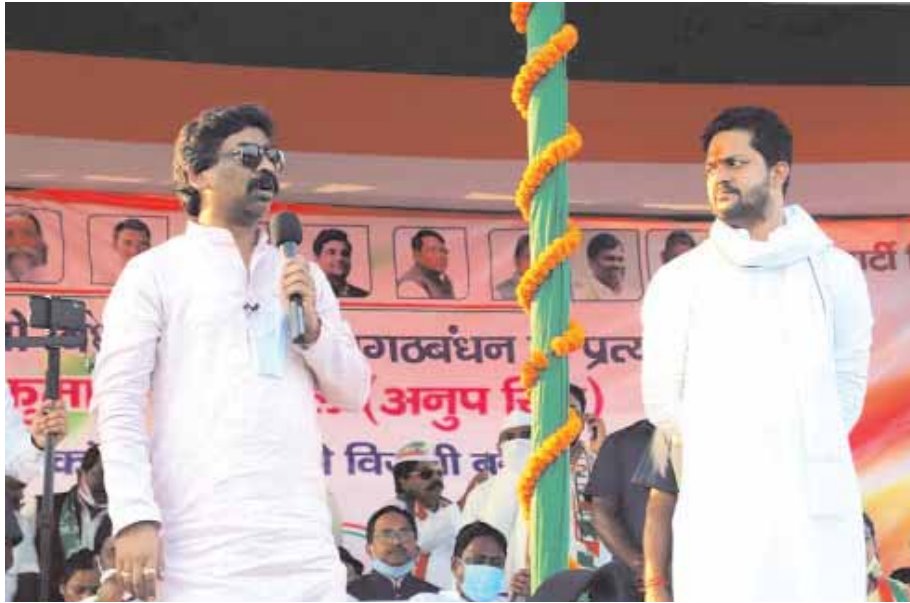
Chief Minister Hemant Soren addresses a gathering during an election campaign rally in support of Congress candidate Kumar Jaimangal, ahead of the Bermo bypoll, in Bermo on Thursday

"The BJP government only worked on anti-people policies. Ration cards of 11.5 million poor people was cancelled.