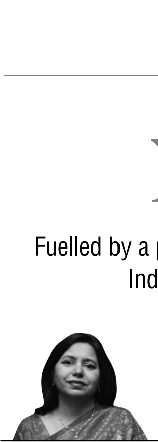
REENA AMOS DYES

This mess needs to be immediately rectified by the Ministry and if Tyagi is to be removed, a new V-C must be found post-haste. This is a situation that is unprecedented and if elections and a pandemic were not ongoing, this would be the top headline of the day. This development is not surprising after decades of Ministers and bureaucrats striking at the autonomy of Central universities. Institutions of higher learning thrive when they are allowed to function independent of the Government and where the V-C is prided for his integrity and not seen as a political appointee.