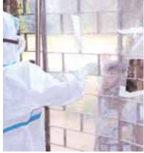
A medic collects swab samples from a girl for COVID-19 test, amid the ongoing Unlock 5.0, in Ranchi on Thursday

districts in Jharkhand reported a triple digit spike in Covid cases, Ranchi reported the highest number of cases among all the districts in the state on Thursday. As per government records, there were around 1700 active cases of Covid-19 infection in Ranchi on Thursday, while around 1300 people were battling the infection in East Singhbhum.