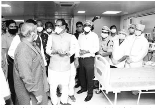
Madhya Pradesh Chief Minister Shivraj Singh Chouhan inspects newly constructed Covid Intensive Care Unit centre after its inauguration at Madhav Nagar hospital in Ujjain, Madhya Pradesh on Friday.