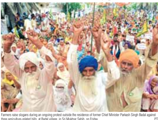
Farmers raise slogans during an ongoing protest outside the residence of former Chief Minister Parkash Singh Badal against three agriculture-related bills, at Badal village in Sri Muktsar Sahib, on Friday

Protests in Maharashtra, Punjab, Haryana, Telangana, Chhattisgarh, western UP; farmers' body plans rail roko from September 24 to 26