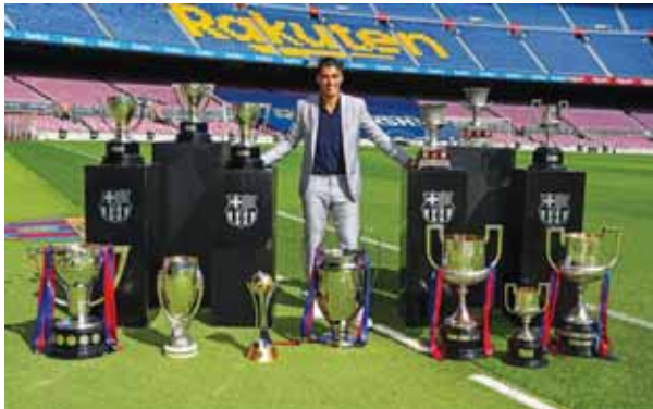
Luis Suarez poses with all the trophies that he won during his 6-year Barcelona's career which includes 2015 UEFA Champions League, UEFA Super Cup, FIFA Club World Cup, 4 La Liga, 4 Copa del Rey, one Supercopa de España

keeper Jordan Pickford. Also, Newcastle thrashed League Two Morecombe 7-0.