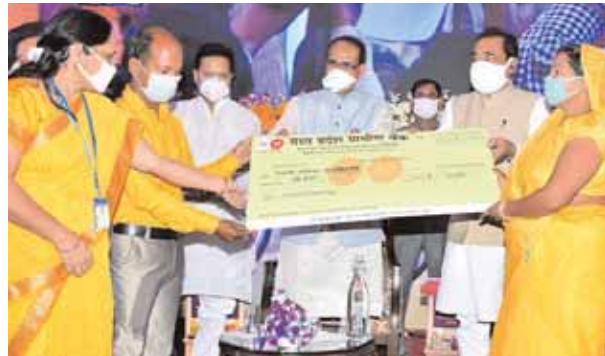
Madhya Pradesh Chief Minister Shivraj Singh Chouhan giving away cheques to beneficiaries under rural street vendors loan scheme at Minto hall in Bhopal on Thursday