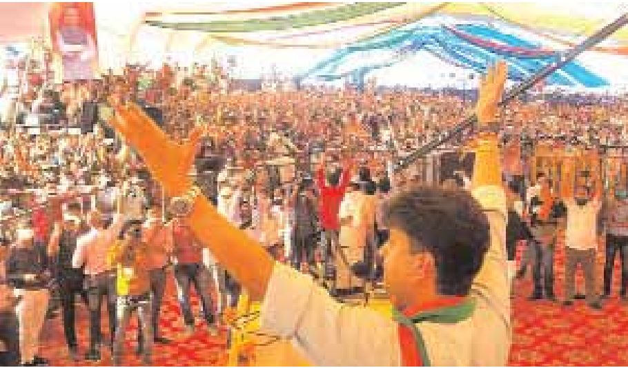
BJP leader and Rajya Sabha MP Jyotiraditya Scindia addresses during foundation stone laying programme for various development projects at Rajpur, Ashok Nagar district, Madhya Pradesh on Thursday