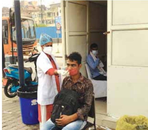
A healthcare worker takes swab sample from a passenger for Covid-19 test at Sarai Kale Khan Bus Terminal in New Delhi on Thursday

Chouhan said that big companies will not be allowed to snatch away the business of small businessmen. Addressing the street vendors, Chief Minister Chouhan said that I have faith in your hard work, therefore I am taking the guarantee of your loan and the gov-