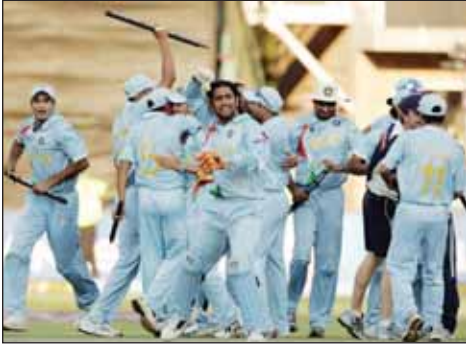
13 years ago on September 24, 2007, India under MS Dhoni beat Pakistan by 5 runs in the final of the inaugural edition of World T20 at Wanderers Stadium in Johannesburg

KL RAHUL BREAKS SACHIN'S RECORD Kings XI Punjab captain KL Rahul on Thursday became the fastest Indian batsman to reach 2000 IPL runs. Rahul overtook Sachin Tendulkar, who till Thursday held the record for being the fastest to 2000 IPL runs. Tendulkar, who played all six seasons of IPL for Mumbai Indians, had reached the milestone in 63 innings. Rahul did it in 60 innings. Gautam Gambhir is the 3rd on the list, who had scored 2000 runs in 68 innings followed by Suresh Raina (69) and Virender Sehwag (70)