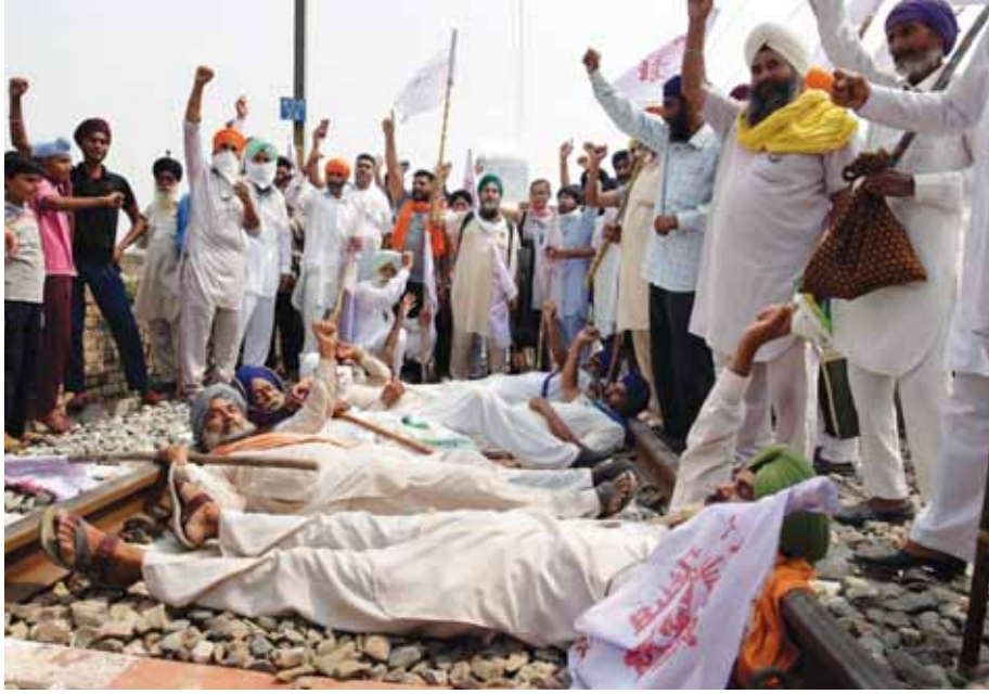
Farmers block a railway track as they participate in Rail Roko Andolan during a protest against the Farm Bills passed in both the Houses of Parliament, at village Devi Dass Pura, about 20km from Amritsar, on Thursday

Among the trains that will remain suspended are the Golden Temple Mail (Amritsar-Mumbai Central), Jan Shatabdi Express (Haridwar-Amritsar), New Delhi-Jammu Tawi, Karambhoomi (Amritsar-New