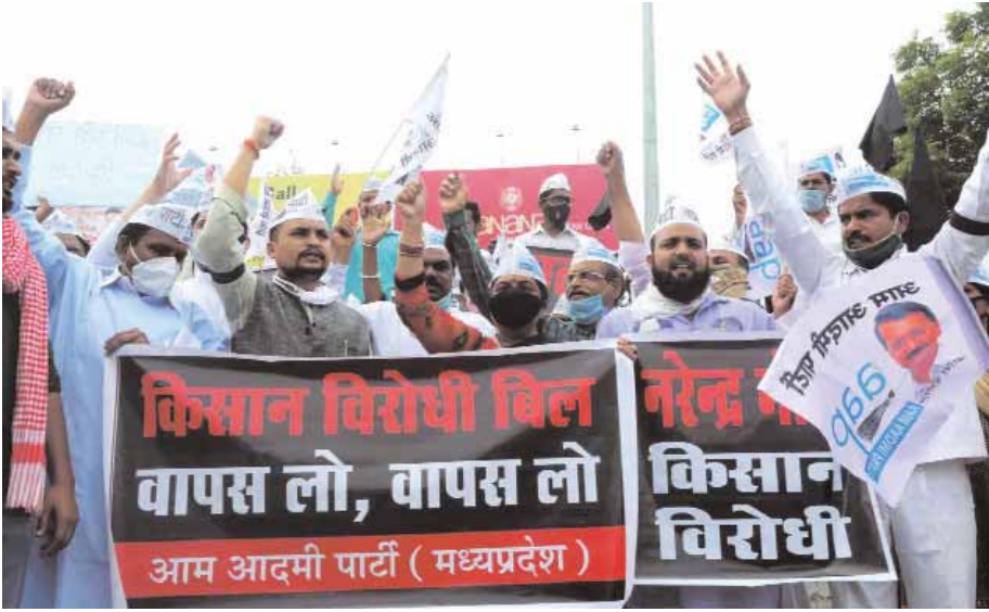
Aam Aadmi Party (AAP) workers protest against the farm bills passed in Parliament recently, in Bhopal on Thursday