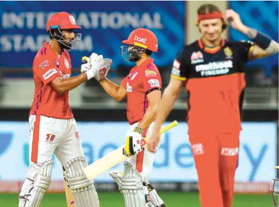
Kings XI Punjab captain KL Rahul celebrates with teammate Karun Nair after he hits Dale Steyn for a six