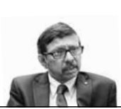
A SURYA PRAKASH

The Constitution gives its citizens the right 'to reside and settle in any part of the territory of India' and no political power should try to redefine it