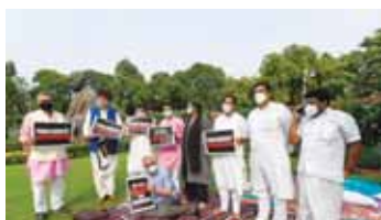
TMC MPs Derek O'Brien and Dola Sen, Jammu & Kashmir National Conference MP Farooq Abdullah and others stage a protest over the suspension of 8 Rajya Sabha members, in New Delhi on Monday

The protest will continue overnight and the suspended members will again attempt to