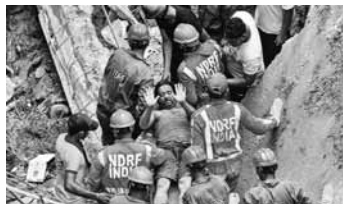
National Disaster Response Force (NDRF) and Fire Brigade carry an injured person from the site after a three-storey building collapsed at Thane district on Monday

The injured were rushed to the hospitals at Bhiwandi and nearby Thane.