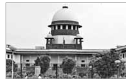
a "deep-seated conspiracy."

The very phrases like "love jihad" and "enticement of wives and daughters" were coined to show the community in a bad light. It is a bare-faced calumny to say that the Muslim youth join the civil services as part of