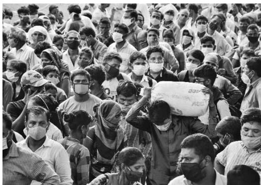
Migrants from various States arrive at Thane Railway Station to reach their workplaces, amid the coronavirus pandemic, in Thane on Wednesday

There are 15,326 active cases in the state. As many as 1,07,970 samples were tested for COVID-19 in the past 24 hours while 52,02 lakh samples have been examined for coronavirus infection across Bihar so far, it said. PTI