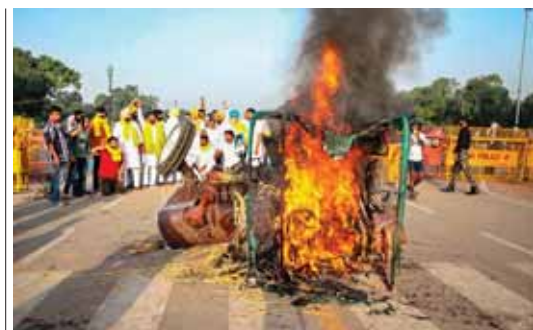
Punjab Youth Congress members set on fire a tractor near India Gate during a protest against the new farm laws in New Delhi on Monday

"This would enable the States to bypass the unacceptable anti-farmers provisions,"