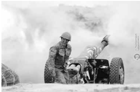
an Armenian soldier fires an artillery piece during fighting with Azerbaijan's forces in the breakaway region of Nagorno-Karabakh on Tuesday

fighting killed dozens and left scores wounded. The Nagorno-Karabakh Defense Ministry reported 84 servicemen killed so far. Azerbaijan's president, Ilham Aliyev, said Tuesday that 10 civilians were killed on its side, but he didn't offer any details on the country's military