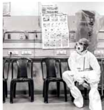
A doctor ready to enter the critical zone ward at AIIMS