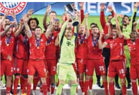
Bayern Munich players celebrate with the UEFA Super Cup trophy

Martínez delivers emotional extra-time Super Cup for Bavarians