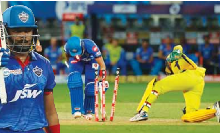
MS Dhoni stumped out Prithvi Shaw during Delhi Capitals innings

Prithvi shines as Delhi Capitals make 175/3 against CSK