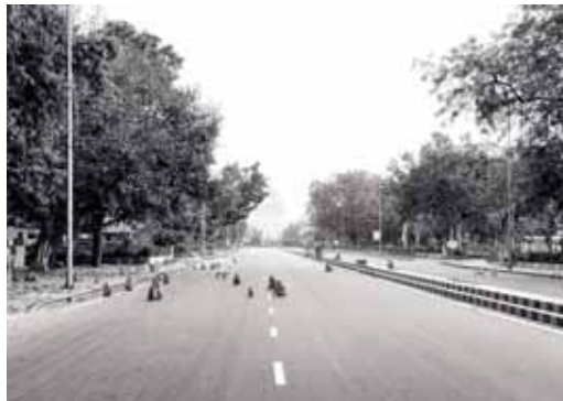
Delhi's permanent rulers, Rhesus monkeys, recaptured North Avenue mocking the virus and the residents who covered inside their government flats