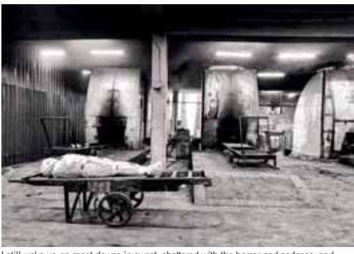
I still wake up on most dawns in sweat, shattered with the horror and sadness, and sheer loneliness of bodies that came, day in, day out, to the Nigambodh Electric Crematorium, the Muslim Burial Ground and the Christian Cemetery