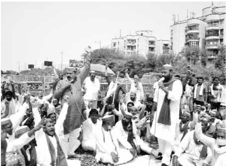
BKU supporters and farmers arrive at the Delhi-Noida border to protest against Farm Bills and other issues in Noida on Friday.

into consideration by the Delhi government keeping in mind the hardships being faced by the people in the backdrop of the Covid-19 pandemic," it added.