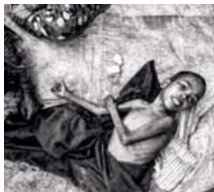
Not all have home in a village to go back to — life goes on in makeshift homes under the Dwarka flyover

then the narrative changed when the COVID death rate started rising. There was one thing — either I stopped there or I continue shooting. And so it happened. I continued capturing the migrants, doctors in the COVID wards and the burial grounds and crematoriums.