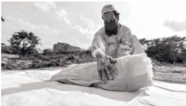
'Surely we belong to Allah, and to Him shall we return'