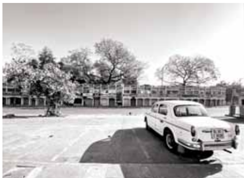
A solitary vintage Fiat in Connaught Place's Outer Circle, facing the shut stores on the side of Minto Bridge