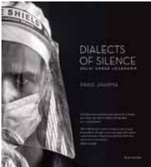
Dialects of Silence (Cover)

No, when I took to the streets, there was no thought of getting a book published in my mind. It was just my obsession with photography and my passion. It was very frightening because there was nobody on the streets. Everything was shut, and not a single soul was seen in miles. I began with capturing the architecture and the deserted roads but