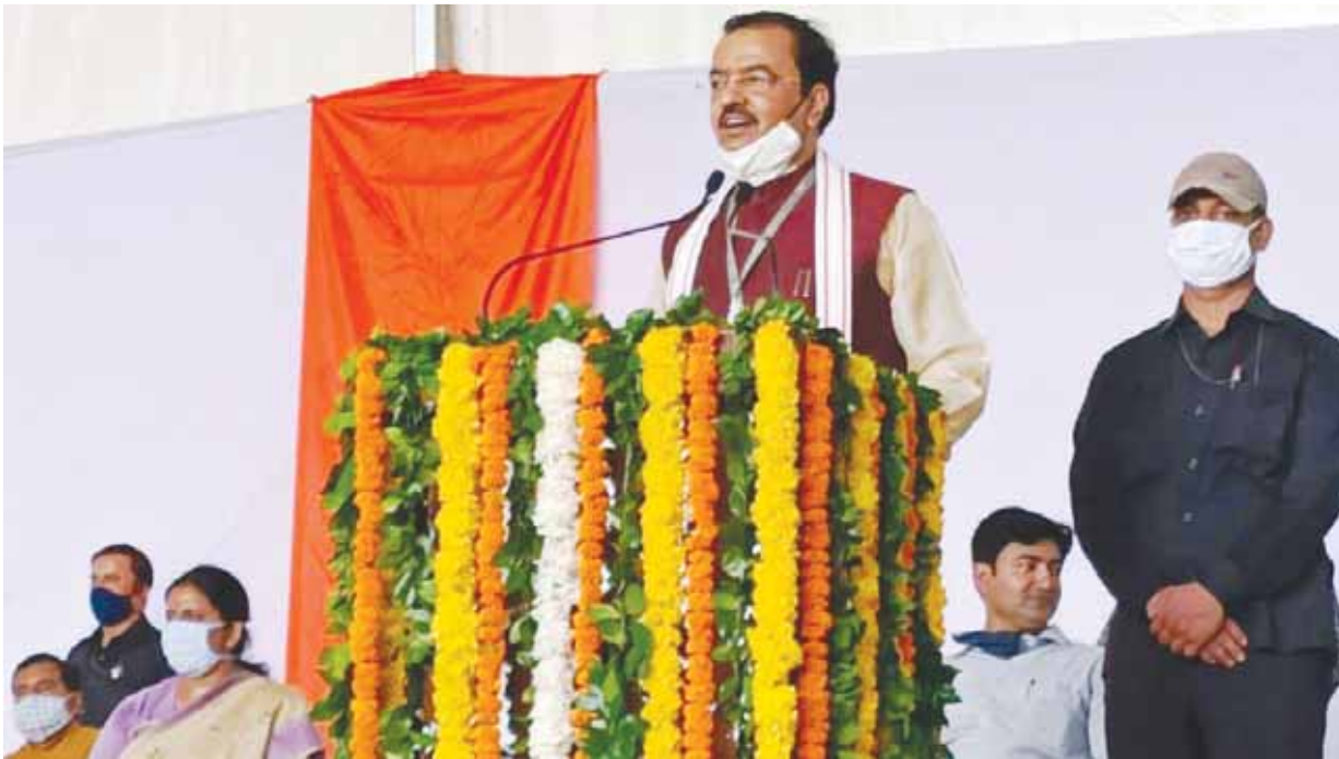
The Deputy Chief Minister, Keshav Prasad Maurya lays foundation stones of 71 projects worth Rs 242 crore at Ghatampur on Tuesday

The deputy chief minister said that during lockdown, the migrant workers were given