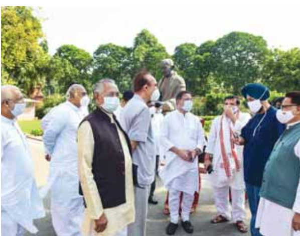
Congress MP Ghulam Nabi Azad and other Opposition MPs stage a walkout from the Rajya Sabha, demanding suspension of 8 lawmakers be revoked, during the ongoing Monsoon Session of Parliament, at Parliament House in New Delhi on Tuesday