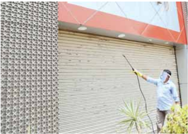
A worker sanitising shop in Prayagraj,

The district administration and CMO have postponed the system of providing information about how many suspected corona patients are