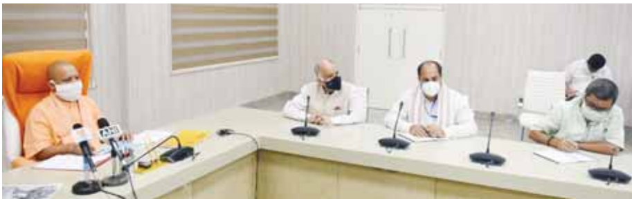
CM Yogi Adityanath reviewing development projects of Varanasi division through video conferencing on Monday evening

During the meeting the local officers had informed