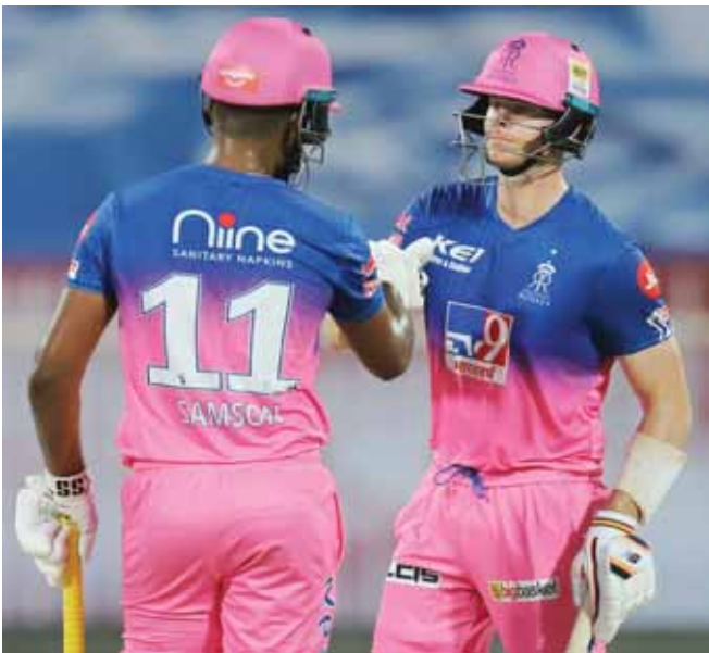
Steve Smith congratulates Sanju Samson after he completes his fifty.

Asked why he came so low, the CSK skipper said, "I haven't batted for a long time. 14-day