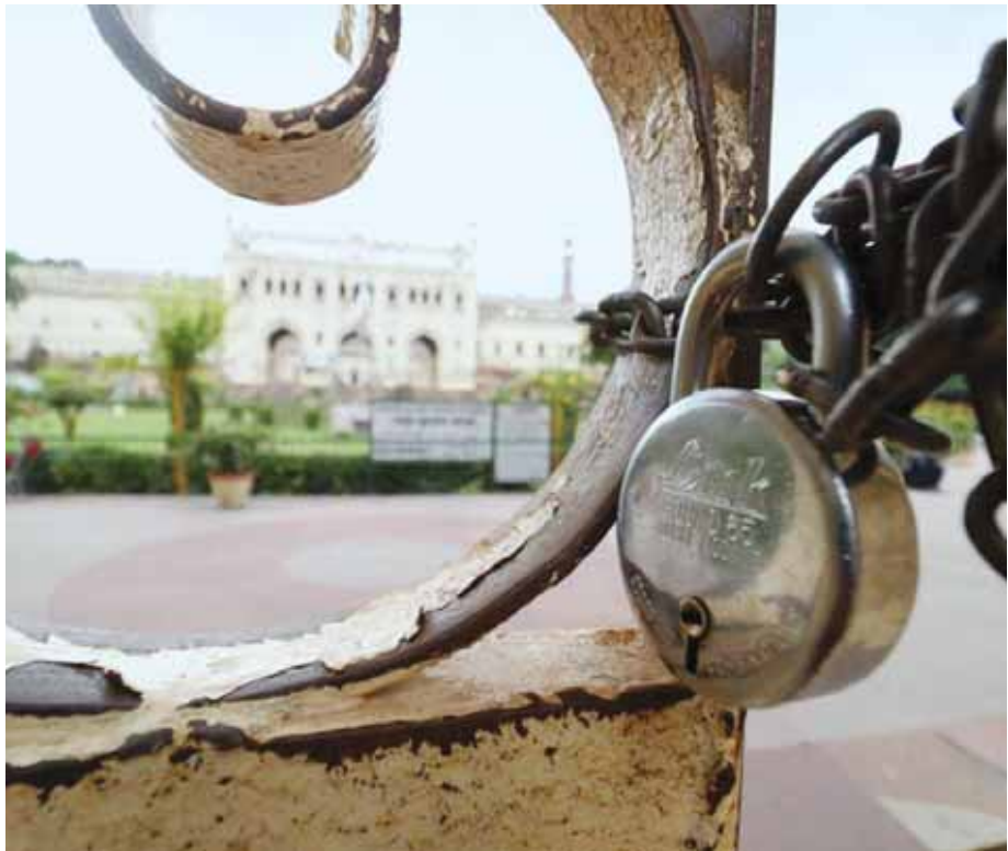
District Magistrate Abhishek Prakash informed mediapersons late Tuesday evening that the historic Asafi (Bada) Imambara, Chhota Imambara and Picture Gallery will reopen on September 24 with complete adherence to Covid protocol

As per Health department figures, of total number of people having tested positive for coronavirus in Lucknow till now, 34.9 per cent have been females while 65.1 per cent males.