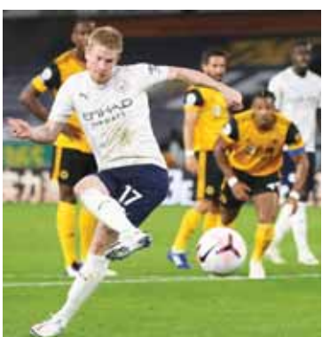
Kevin de Bruyne scores Man City opening goal.

While City equalled Aston Villa's record of winning 10 consecutive opening fixtures to a top-flight season, there