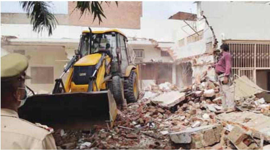
JCB demolishing house of Atique Ahmed in Chakiya in Prayagraj

When the demolition team reached Atique's Chakia residence it found the gate locked. When the lock could not be removed, a JCB machine uprooted the gate to give way to the whole team to