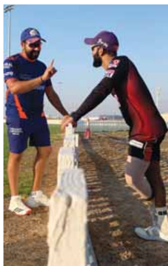
Mumbai Indians skipper Rohit Sharma chats with Kolkata Knight Riders captain Dinesh Karthik during training session.

"One of the tough points for KKR at this point of time is picking the right XI. A lot of guys have put their hands up and are ready for