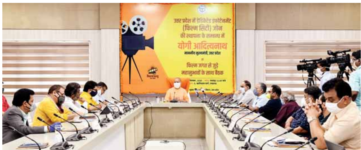
Chief Minister Yogi Adityanath meeting with film personalities on the Film City project on Tuesday

He also said that due to its proximity to the Taj City Agra and Lord Krishna's birthplace Mathura, the proposed zone