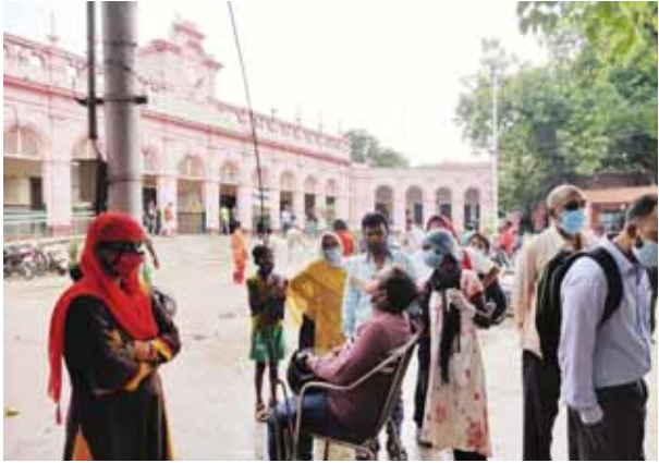
Antigen testing being done at SSPG Hospital in Varanasi