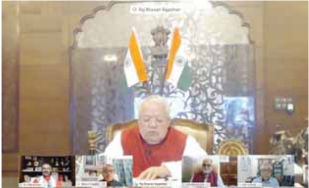
Rajasthan Governor Kalraj Mishra addressing national webinar on NEP-20 at IUCTE in Varanasi on Tuesday

Culturally, India has been, and continues to be, a cradle of great diversity in all walks of life, with its myriad languages and dialects, with as many as seven classical dance forms and two classical music forms, many well-developed traditions of folk arts and music, pottery, sculptures and bronzes,