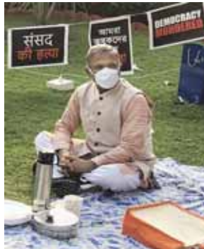
Deputy Chairman of Rajya Sabha Harivansh Narayan Singh offers tea to suspended MPs on the premises of Parliament on Tuesday morning