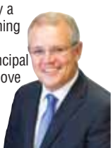
Australian PM —Scott Morrison

I think home quarantine can play a role in the future and it’s something that is being considered by the Australian Health Protection Principal Committee, particularly as we move beyond the phase we’re in now.