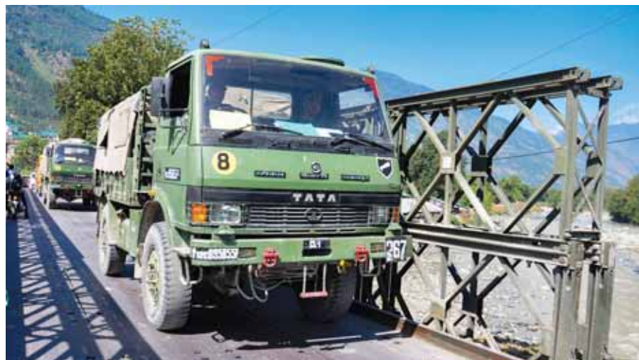
An Army convoy moves towards Ladakh amid border tension with China, at Manali-Leh highway

Brushing aside the Chinese claim of the perception,