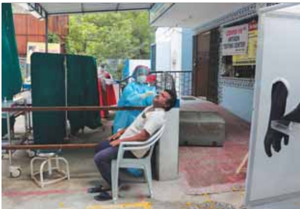
A health worker collects a nasal swab sample to test for Covid-19 in Hyderabad on Tuesday