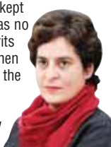
Congress General Secretary —Priyanka Gandhi

Yogi Adityanath Government kept sitting for eight days. Why was no action taken against the culprits all these days? It was only when the case was highlighted that the administration woke up.