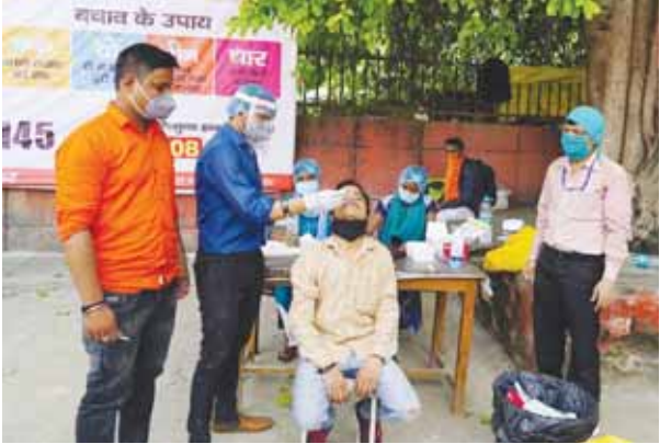
Antigen testing being done at SSPG Hospital in Varanasi on Tuesday