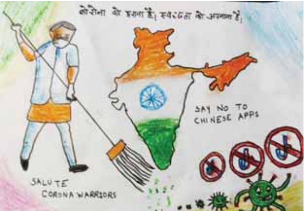
A painting of a child on cleanliness at DLW in Varanasi on Tuesday

Under the ongoing 'Cleanliness Fortnight' being organised on the instructions of the Ministry of Railways, a painting competition was organised for school-children under 'Diesel Locomotive Works (DLW)' here on Tuesday. During the fortnight the entries of painting competition on the subject of COVID-19 and sanitation were invited online from the schoolchildren from the families of DLW workers. The contest was divided into two categories, for students up to Class V and above. A large number of entries were received in this painting competition in which the children have brilliantly highlighted the