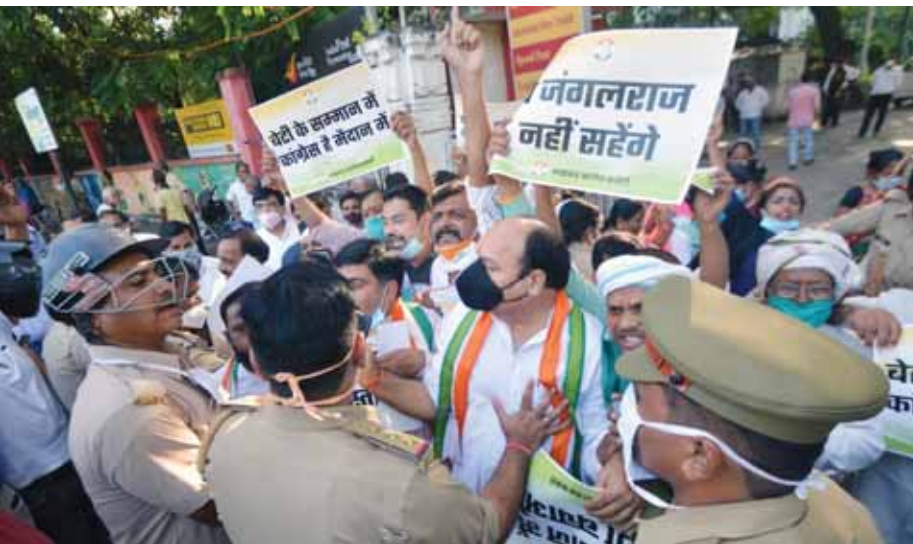
Congress (left) and Samajwadi Party workers staging protest against Hathras gang-rape and the deteriorating law and order in the state, in Lucknow on Tuesday

In a curious move, the then government recommended a CBI probe into case number 197 but case No. 198 against the accused politicians was handed over to the CBI wing of UP Police.