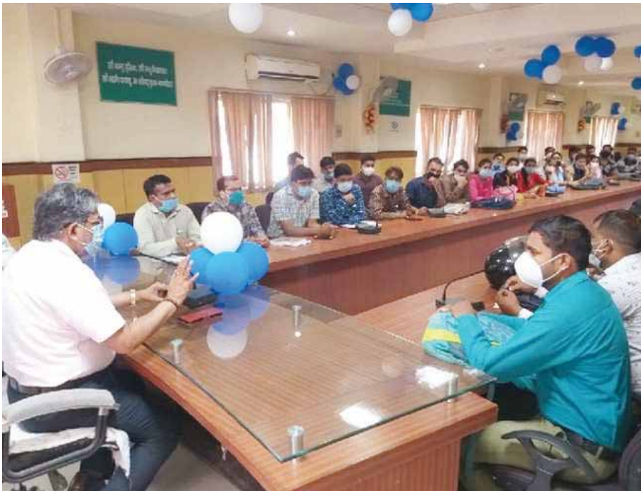
CDO and CMO hold meeting with agitating lab technicians at UHM Hospital conference room on Tuesday.