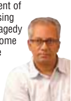
Artist —Atul Dodiya

There is an undercurrent of painful events — passing away of people, the tragedy of migrants walking home — everything is in the back of my mind.