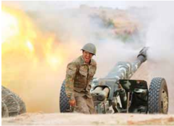
an Armenian soldier fires an artillery piece during fighting with Azerbaijan's forces in the breakaway region of Nagorno-Karabakh on Tuesday