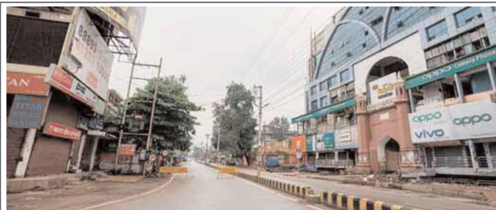
Empty Streets: The prominent streets of capital city Raipur are deserted during the lockdown imposed since September 21 due to a spurt in Covid-19 cases. Minimum movement of vehicles is seen on the roads. The lockdown will end on September 28.

The arrested men said they were operating the betting racket inside cars as they did not get a room in any hotel or any other safe place due to the lockdown, Yadav said.