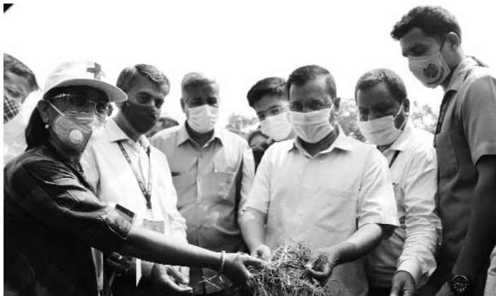
burning every year. A technique has been developed by the scientists of IARI

Taking to social media, he tweeted, "Farmers are also worried about the pollution that is caused due to stubble burning every year. A technique has been developed by the scientists of IARI