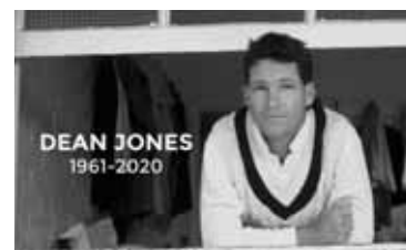
DEAN JONES 1961-2020 A player well ahead of his time, Jones scored over 6068 ODI runs at an average of 44.61 with seven hundred and 46 fifties. For Indian fans, he will forever remain in their memory for the timeless Test in Chennai, where he laid the foundation of a big Australian score with an unbeaten double hundred in challenging conditions.

PTI ■ MUMBAI Former Australia batsman Dean Jones, one of the finest exponents of ODI cricket, died of a sudden cardiac arrest in Mumbai on Thursday. Jones, 59, was in Mumbai with the Star Sports' commentary team for the Indian Premier League. He was in a bio-bubble in a city hotel. He is survived by his wife and two daughters. Jones played 52 Tests and 164 ODIs for Australia and was part of the 1987 World Cup winning team. "It is with great sadness that we share the news of the passing away of Mr Dean Mervyn Jones AM. He died of a sudden cardiac arrest," Star Sports said in a press release. "We express our deep condolences to his family and stand ready to support them in this difficult time. We are in touch with the Australian High Commission to make the necessary arrangements," the release added. According to an IPL source, it happened in matter of seconds. "Deano was standing in the hotel lobby and he suddenly collapsed. Brett Lee was standing by his side. Brett tried to revive him by applying CPR (Cardio Pulmonary Resuscitation) but he didn't respond," said the source. "He was then taken to Harkisan Das Hospital in Girgaon where he was announced dead on arrival." Jones' family is in Melbourne and the Australian High Commission is in touch with them.