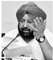
Capt Amarinder dismissed SAD leader Harshmat Kaur Badal's resignation from the Union Cabinet as a mockery of the Akali history of sacrifices, before the Badals hijacked the party and converted it into their personal fiefdom for their own gains.

Reacting to Tomar's latest remarks on the issue, the Chief Minister termed it a pack of outrageous lies. "The entire