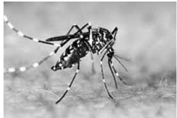
thrombocytopenia requires SDP for immediate recovery," she added.

"Instructions have been issued to the authorities concerned in Gurugram, Bhiwani and others to ensure dengue cases do not increase in their districts. Moreover, Senior Health officers have been monitoring the prevalence Dengue effectively. To prevent mortality due to Dengue, new initiative, i.e. the provision of free Single Donor Platelets (SDP) has been made for dengue patients admitted in Government Hospitals as some dengue patients with severe