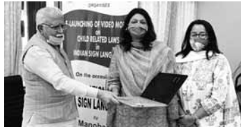
guage in the New Education Policy. On one hand, having a common sign language will make conversation easy for the hearing impaired persons, while on the other, it will also open the way for their success at the national level. He said that the rights given to the hearing impaired persons in the New Education Policy will open the way for their success and development in the coming time.

The Chief Minister said that the Central Government has taken historic decision to introduce common sign lan-