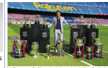
Luis Suarez poses with all the trophies that he won during his 6-year Barcelona's career which includes 2015 UEFA Champions League, UEFA Super Cup, FIFA Club World Cup, 4 La Liga, 4 Copa del Rey, one Supercopa de España

London: Chelsea on Thursday announced the signing of goalkeeper Edouard Mendy from Rennes on a five-year deal for a reported fee of 22 million pounds. The Senegalese international will compete with Kepa Arrizabalaga and Willy Caballero for a starting spot at Stamford Bridge. "I am so excited to be joining Chelsea," said Mendy. "It's a dream for me to be a part of this exciting squad and to work with Frank Lampard and all of his coaching staff." "I look forward to meeting my team-mates and can't wait to get started." AFP keeper Jordan Pickford. Also, Newcastle thrashed League Two Morecambe 7-0.