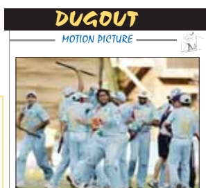
DUGOUT MOTION PICTURE

We were actually keeping things pretty simple, we knew what strokes are to be executed on this ground, so we just stuck to our plan and it went out really well