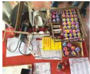
various locations in India, including West Bengal and Kerala.

The search operation followed registration of a case (No.RC-31/2020/NIA/DLI) by NIA on September 11 and subsequent investigation into the matter. This led the NIA to learn about an inter-State module of al-Qaeda operatives at