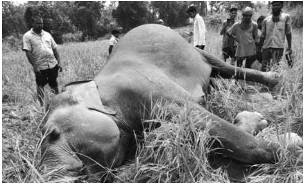
People gather around the body of a giant elephant, which died during movement in paddy-field due to electric shock, at Khalari area near Ranchi, on Saturday.

Forest officials recently chased away a herd of elephants from Dhelwatand village, and the female elephant who died on Saturday is assumed to be a member of the same herd. The elephant came in contact with the naked wire, hanging from a pole, while she was crossing the farm field, forest officials said.