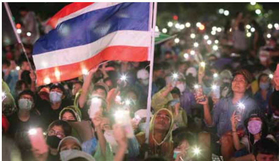
Pro-democracy protesters wave a flag and hold up lights during a protest at Sanam Luang in Bangkok on Saturday

About 500 US troops are deployed in the northeastern part of Syria to fight against the Islamic State terror group and secure the oil fields operated by Kurdish forces. IAN S