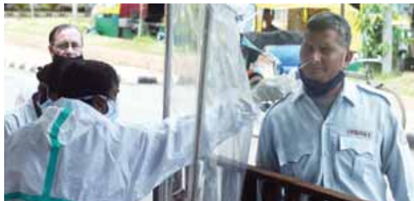
A health worker collects swab samples from a security guard for COVID-19 test, during Unlock 4.0, in Ranchi on Saturday

While the count of patients recovering from the infection has been fast increasing in Jharkhand, as many as 615 Covid fatalities have been reported in the state so far. On Saturday, as many as 10 Covid patients, including two each in Ranchi, East Singhbhum and West Singhbhum, died during