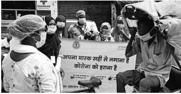
Volunteers of UNICEF distribute face masks among poor people during a awareness campaign organized by District Administration, in Ranchi on Saturday.

As per the home isolation norms set by the Government, patients in home isolation should have an oximeter at home to keep a check on the oxygen level in their body. However, many patients could not afford an oximeter, officials said. The inspection teams will identify such patients, who do not have an oximeter at home, and measure their oxygen level in the first phase of the drive. "The teams will take all