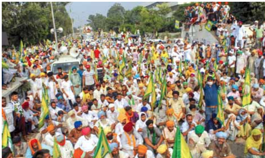
Members of various farmers’ organisations block Sangrur road during a protest against the Central Government over agriculture related Bills, in Patiala on Saturday

A day after Prime Minister Narendra Modi blamed the Opposition for misleading the farmers, the BKS said the Bill is “tilted heavily towards the corporate” and would not improve the lives of farmers and should be whetted by the