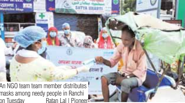
An NGO team member distributes masks among needy people in Ranchi on Tuesday.

Covid patients undergo RT PCR test before qualifying as Covid negative. Asymptomatic patients, however, may be treated as Covid negative if RAT test concludes the same, officials added. The decision of making RT PCR tests mandatory for symptomatic Covid-19 patients, officials said, was taken in accordance with the Indian Council of Medical Research (ICMR) guidelines. "The decision has been taken in accordance with the ICMR guidelines. Researchers at ICMR may have found that RT PCR tests were more reliable than rapid tests in detecting