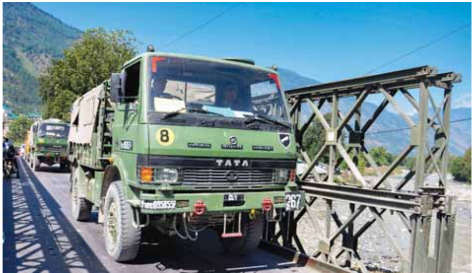
An Army convoy moves towards Ladakh amid border tension with China, at Manali-Leh highway

Brushing aside the Chinese claim of the perception,