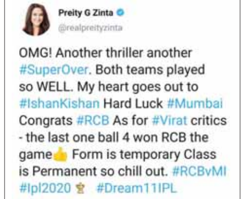
After Virat Kohli managed to score just combined 18 runs in his first three innings, KXIP owner Preity Zinta defended him. "As for Virat's critics - the last one ball 4 won RCB the game...Form is temporary, class is permanent. So, chill out," she tweeted