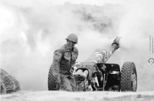
an Armenian soldier fires an artillery piece during fighting with Azerbaijan's forces in the breakaway region of Nagorno-Karabakh on Tuesday

fighting killed dozens and left scores wounded. The Nagorno-Karabakh Defense Ministry reported 84 servicemen killed so far.