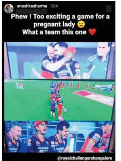
Reacting to RCB win over MI on Super Over's last ball, actress Anushka Sharma took to Instagram Story and wrote, "Phew! Too exciting a game for a pregnant lady! What a team this one!"