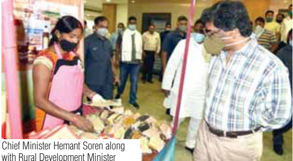
Chief Minister Hemant Soren along with Rural Development Minister Alamgir Alam, Labour Minister Satyanand Bhokta visit ‘Palash’ exhibition stall at Project building in Ranchi on Tuesday

Speaking on the occasion, Rural Development Minister Alamgir Alam said the Government has been successful in giving employment to 7 lakh 62 thousand people in the event of lockdown. Currently 6 lakh 50 thousand people are