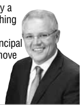
Australian PM —Scott Morrison

I think home quarantine can play a role in the future and it’s something that is being considered by the Australian Health Protection Principal Committee, particularly as we move beyond the phase we’re in now.