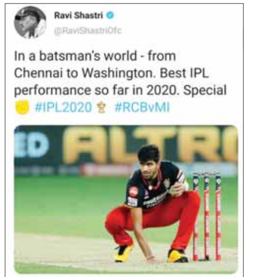
Team India head coach Ravi Shastri took to Twitter to praise RCB's off-spinner Washington Sundar for his performance against MI. Washington registered figures of 4-0-12-1 including 13 dot balls and did not concede any boundary.