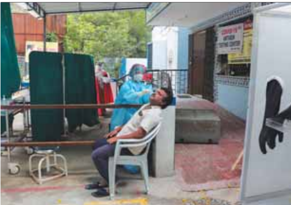
A health worker collects a nasal swab sample to test for Covid-19 in Hyderabad on Tuesday