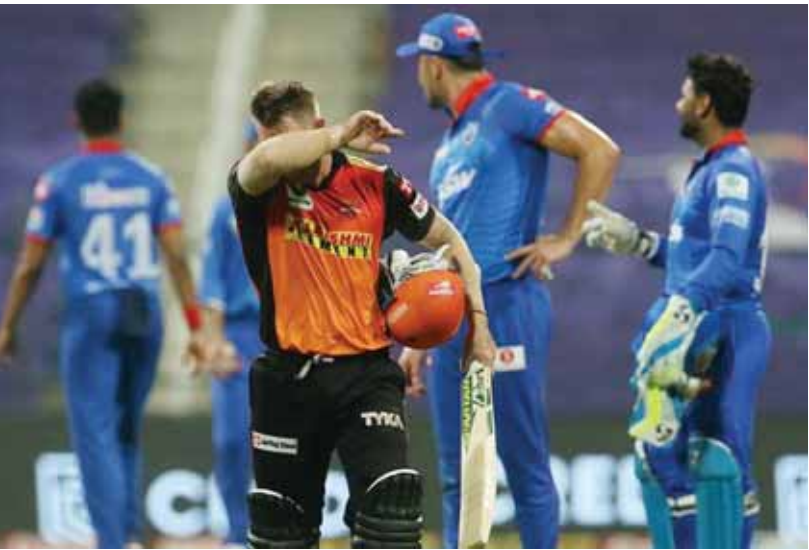
Sunrisers Hyderabad captain David Warner walks back to the pavilion after getting out