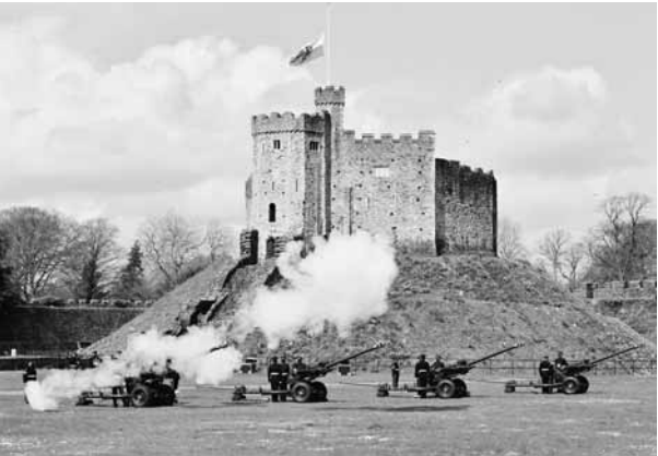
Members of the 104th Regiment Royal Artillery fire a 41-round gun salute in the grounds of Cardiff Castle in Cardiff on Saturday

"The tradition of Gun Salutes being fired throughout