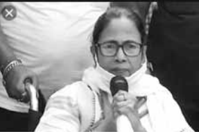
The EC had on Thursday issued a notice to Mamata for her provocative remarks against Central forces

Mamata also urged the poll body to rescind its notice, contending she has not violated the model code or the various sections of the Indian Penal Code. She claimed that a girl was allegedly molested by an unidentified CRPF personnel in the early hours of April 6 at Ramnagar, under Tarakeswar police station and the matter was reported to the