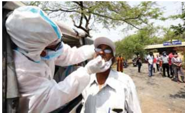
A health worker takes a swab sample from a man for Covid-19 test at a primary health centre, in Bhopal on Saturday

Similarly, rural and urban areas of Barwani, Rajgarh and Vidisha will be under absolute prohibitive measures till April 19 morning. Balaghat, Narsinghpur, Seoni and urban areas of Jabalpur will be put