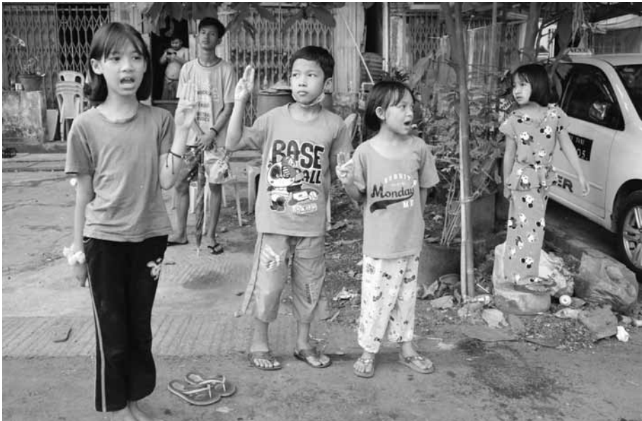
Children flash the three-fingered symbol of resistance as they join an anti-coup protest in Yangon on Saturday

On Wednesday, attacks were launched on opponents of military rule in the towns of Kalay and Taze in the country's north. In both places, at least 11 people — possibly including some bystanders — were reported killed. Security forces