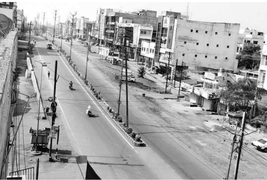
Roads wear a deserted look in Kolar locality during nine-day complete lockdown due to the rise in the COVID-19 cases, in Bhopal on Saturday. Authorities have imposed weekend lockdown in all cities of the State from 6pm Friday to 6 am till Monday in view of the rising COVID-19 cases

In the two-month training, 30 young men and women of the tribe are being trained in the mode of data entry operator and computer operator.