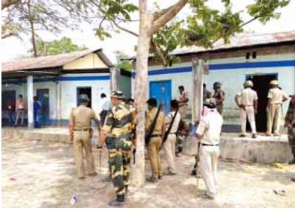
Security personnel keep vigil at a polling station after Election Commission ordered of stopping the voting exercise at polling station number 126 in Sitalkuchi, where clashes erupted between locals and Central Forces, at Sitalkuchi in Cooch Behar district on Saturday

Four persons Hamidul, Manirul and Samiul (three of