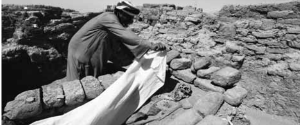
A man covers a skeleton in a 3,000-year-old lost city in Luxor province, Egypt on Saturday