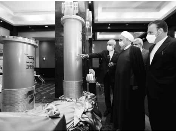
In this photo released by the official website of the office of the Iranian Presidency, President Hassan Rouhani, second right, listens to head of the Atomic Energy Organization of Iran Ali Akbar Salehi while visiting an exhibition of Iran's new nuclear achievements in Tehran, Iran on Saturday

Since January, Iran has begun enriching uranium at up to 20% purity, a technical step away from weapons-grade levels, though Iran's leadership insists the country has no desire to develop a nuclear weapon. Former US President Donald Trump pulled the US