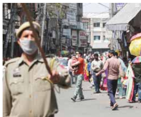
A policeman tries to ensure people wear face masks as a precaution against the coronavirus at a Sunday market in Jammu on Sunday

Record over 1.57 lakh cases in a day as Covid 2nd wave grips India