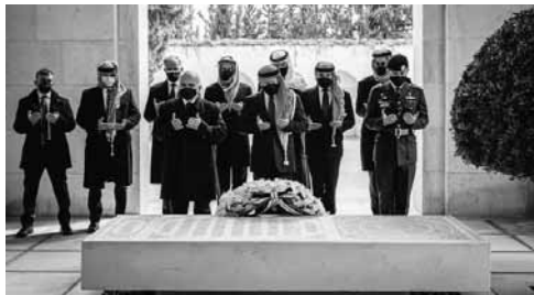
This photo from the Royal Court twitter account, shows Jordan's King Abdullah II, centre, Prince Hamzah bin Al Hussein, second left, and others during a visit to the tomb of the late King Hussein, in Amman Jordan on Sunday AP

The royal palace released a photo and video with Abdullah, Hamzah, Crown Prince Hussein and other dignitaries at the grave of King Talal in Amman, Jordan's cap-