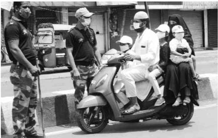
Security personnel stop commuters during weekend lockdown in Bhopal on Sunday