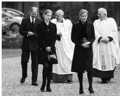
Britain's Prince Edward, Sophie Countess of Wessex and their daughter Lady Louise Windsor, attend the Sunday service at the Royal Chapel of All Saints at Royal Lodge, Windsor, in England on Sunday

"I feel very sorry and supportive of my mother, who's feeling it more than everybody else. The Queen, as you would expect, is an incredibly stoic person and she described his passing as a miracle, and she's contemplating. She