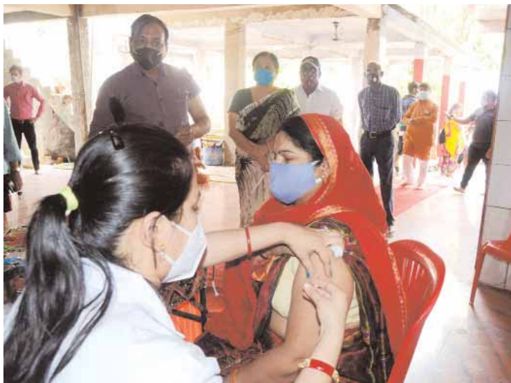
A health worker administers Covid-19 vaccine to a beneficiary at a vaccination camp during nationwide 'Tika Utsav' programme at Sheela Mata temple in Bhopal on Sunday

Bhopal police had appealed to citizens to wear the mask compulsorily in public places, to maintain social distancing. Participate in public participation by helping police and administration in prevention of corona infection.