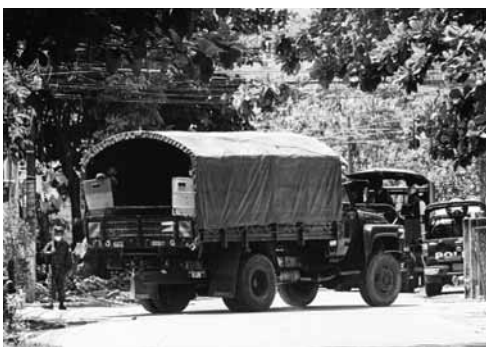
with the details published on their website.

The death toll of 82 was a preliminary one compiled by the Assistance Association for Political Prisoners, which issues daily counts of casualties and arrests from the crackdown in the aftermath of the Feb. 1 coup that ousted the elected government of Aung San Suu Kyi. Their tallies are widely accepted as highly credible because cases are not added until they have been confirmed,