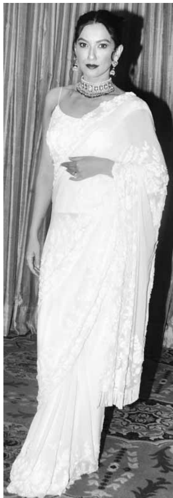
Actor Gauhar Khan launches The Park Holidays International Mobile App in Delhi.

A young woman discovers that both her husband and their new home harbour sinister secrets after they leave Manhattan for small-town life. Starring Amanda Seyfried, James Norton and Natalia Dyer, it releases on Netflix on April 29.