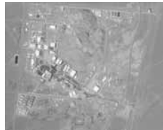
This satellite photo from Planet Labs Inc. shows Iran's Natanz nuclear facility

Dubai: Iran's underground Natanz nuclear facility lost power Sunday just hours after starting up new advanced centrifuges capable of enriching uranium faster, the latest incident to strike the site amid negotiations over the tattered atomic accord with world powers.