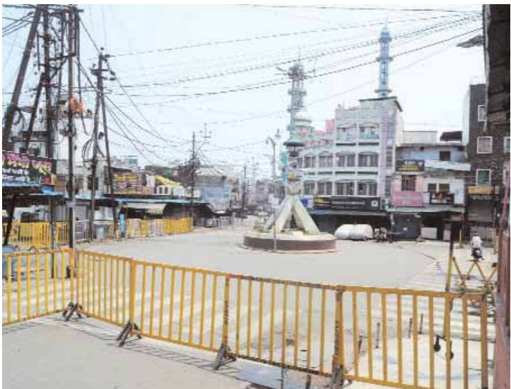
A city road wears a deserted look during weekend lockdown imposed due to a spike in the Covid-19 cases in Bhopal on Sunday

Notably, in these dance forms body language is major criteria. Shrey said that it is important to keep body flexible and free at the same time to bring out the essence of the dance form. Then he stated that it is also important to feel the music and feel the dance together.