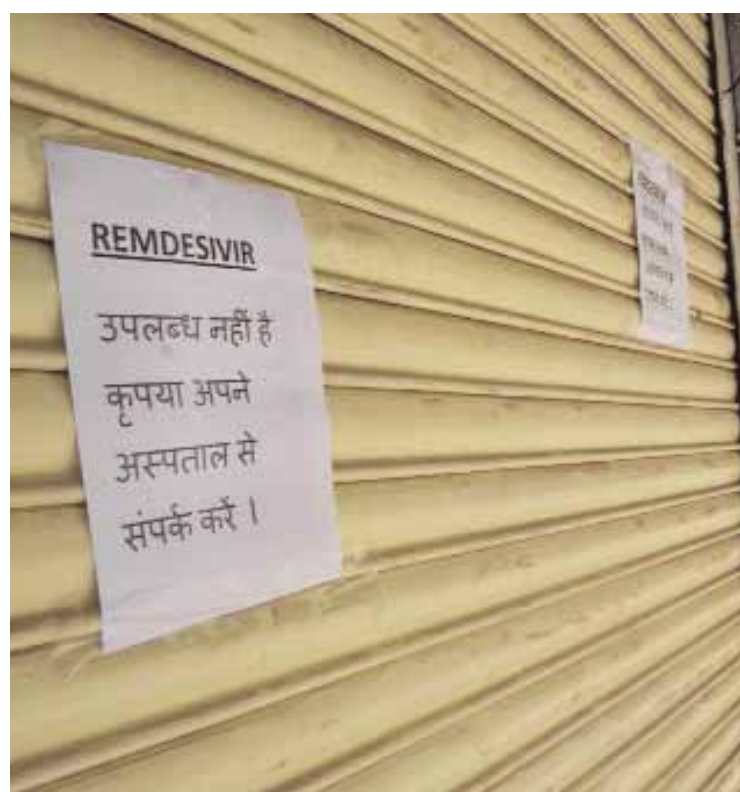
A medical shopkeeper pastes a notice of non-availability of Remdesivir injections outside his closed shop during weekend lockdown amid coronavirus pandemic, at wholesale medicine market in Bhopal on Sunday