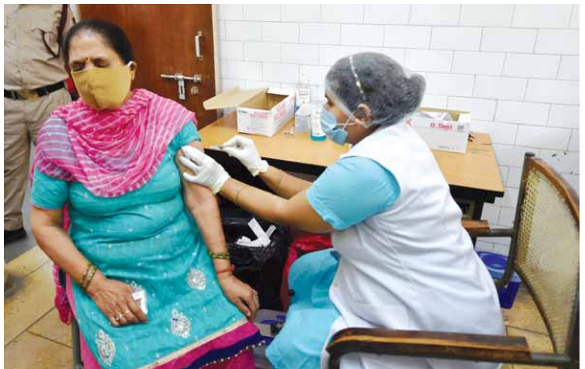
A medic prepares to administer a dose of Covid-19 vaccine during the vaccination festival Tilka Utsav, at EDMC Vishwarkarma Park Dispensary in New Delhi