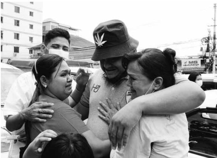
A man is embraced by two women outside Insein prison in Yangon, Myanmar on Saturday

According to the Assistance Association for Political Prisoners, which monitors casualties and arrests, government forces have killed at least 728 protesters and bystanders since the takeover. The group says 3,141 people, including Suu Kyi, are in detention.