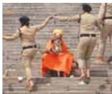
Vijay Rupani said those found infected will be isolated for 14 days.

Maharashtra Minister Anil Parab has announced those coming into the State from Kumbh Mela will be quarantined. Nasik district administration is also taking necessary steps for quarantining those coming from Kumbh.