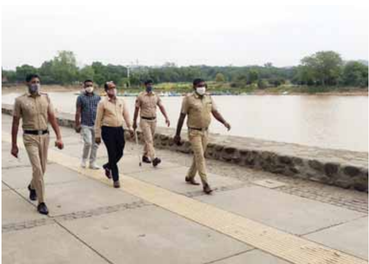
Due to the weekend lockdown imposed by Chandigarh Administration, the popular tourist place of Sukhna Lake remained deserted and the crowded Sector 22 Market remained closed on Saturday