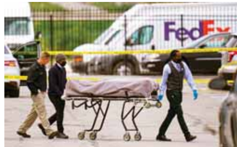
A body is taken from the scene where multiple people were shot at a FedEx Ground facility in Indianapolis on Friday

On Friday night, the Marion County Coroner's Office and Indianapolis