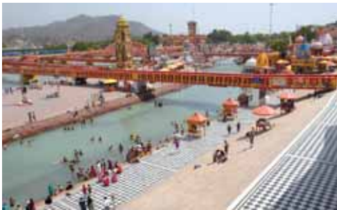
Har Ki Pauri Ghat wears a deserted look during Kumbh Mela 2021 following a surge in Covid-19 cases in Haridwar on Saturday

Thousands of Kumbh visitors have tasted Covid-19 positives and dozens of seers have