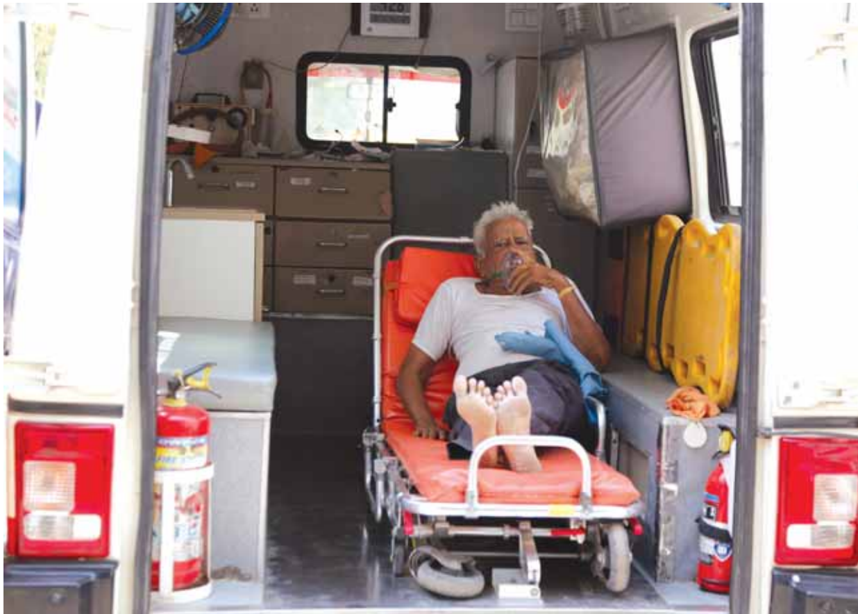
A patient waits inside an ambulance to be admitted to a dedicated Covid-19 hospital in Ahmedabad on April 15, 2021

However, despite having a high percentage of diabetes, the