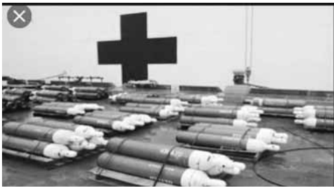
PNS ■ NEW DELHI

Grappling with the surge in Covid-19 cases, various States in a meeting with the Centre on Saturday highlighted the shortage of oxygen cylinders, ventilator stocks and poor supply of vaccine doses. Eleven States and Union Territories, including Maharashtra, Uttar Pradesh and Delhi, account for 79.32 per cent of the new coronavirus cases in the country were present at the meeting. The high-level meeting was chaired by Union Health Minister Harsh Vardhan with the Health Ministers of 11 States and Union Territories to review measures taken by them for prevention, containment and management of the recent surge in Covid-19 cases.