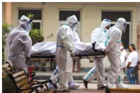
Health workers and family members carry the body of a patient who died of Covid-19 for cremation amid surge in coronavirus cases in Jammu on Saturday

Amid the alarming rise in new infections and deaths, the country is battling a paucity of hospital beds, oxygen supply, ventilators, and life-safe antiviral drug Remdesivir. A major-