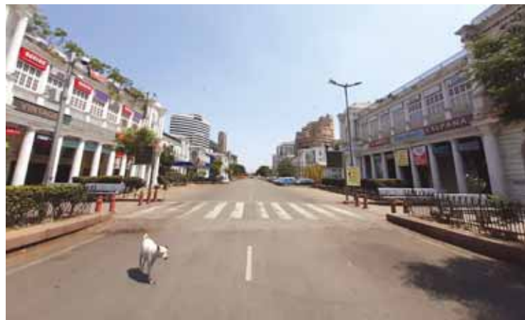
A dog trots along a deserted street during a weekend lockdown in New Delhi on Saturday

Meanwhile, the weekend curfew aimed at breaking the chain of spiralling coronavirus