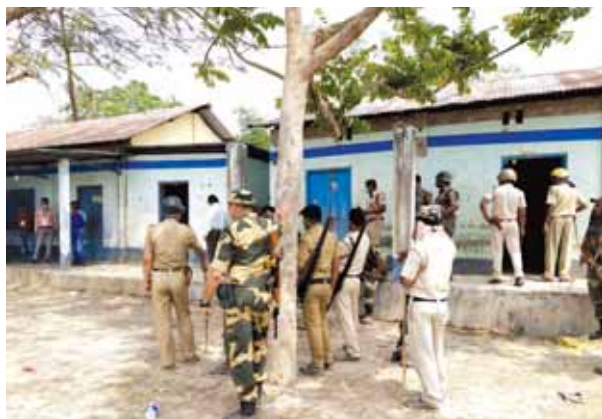
Security personnel keep vigil at a polling station after Election Commission orders stopping of the voting exercise at polling station number 126 in Sitalkuchi, where clashes erupted between locals and Central Forces, at Sitalkuchi in Cooch Behar district on Saturday

Four persons Hamidul, Manirul and Samilul (three of the same family) died when