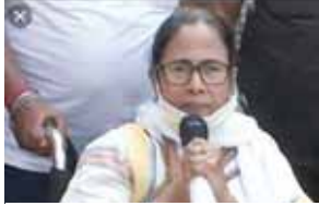
The EC had on Thursday issued a notice to Mamata for her provocative remarks against Central forces

Defending her controversial remarks over the Central forces’ alleged partisan role in the ongoing State Assembly polls, West Bengal Chief Minister Mamata Banerjee said there was no attempt to threaten, incite or influence the electorate against the force and any allegations to the contrary were unfounded’ and ‘denied’. Responding to the Election Commission’s notice Mamata said she has the highest regard for the Central forces and ‘commend and laud their contributions to the safety and the security of the country’.