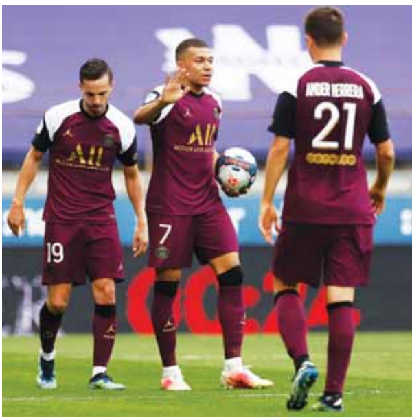
PSG's Kylian Mbappe, second, right, celebrates with teammate Pablo Sarabia, second left, after he scores goal against Strasbourg

Leeds' approach was rewarded in stoppage time when Dallas galloped clear down the middle of a vacant City defence to slot home.