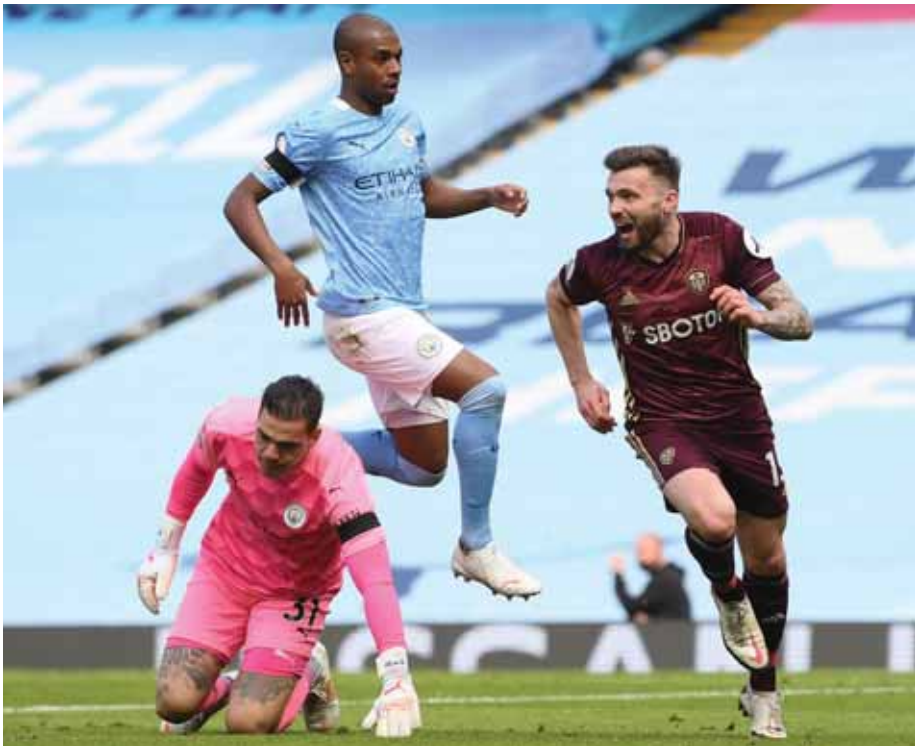
Leeds United's Stuart Dallas, right, reacts after scoring his team's second goal against Manchester City at Etihad Stadium

City noticeably missed Kevin De Bruyne, Ilkay Gundogan, Riyad Mahrez, Phil Foden and Ruben Dias, who