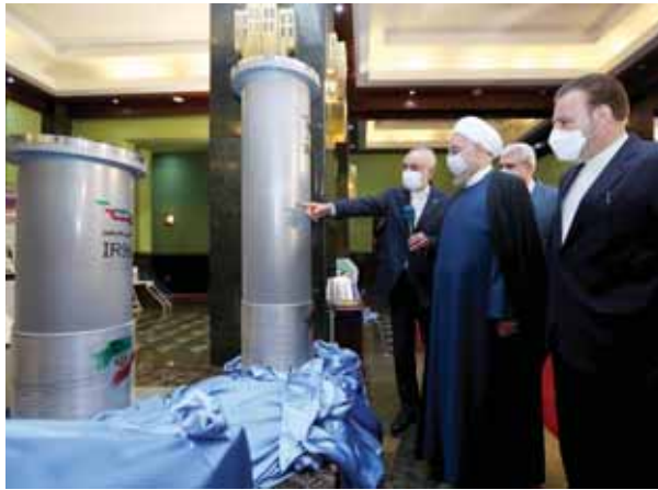
In this photo released by the official website of the office of the Iranian Presidency, President Hassan Rouhani, second right, listens to head of the Atomic Energy Organization of Iran Ali Akbar Salehi while visiting an exhibition of Iran's new nuclear achievements in Tehran, Iran on Saturday

Since January, Iran has begun enriching uranium at up to 20% purity, a technical step away from weapons-grade levels, though Iran's leadership insists the country has no desire to develop a nuclear weapon. Former US President Donald Trump pulled the US