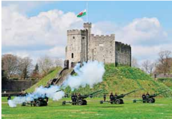
Members of the 104th Regiment Royal Artillery fire a 41-round gun salute in the grounds of Cardiff Castle in Cardiff on Saturday

"The tradition of Gun Salutes being fired throughout