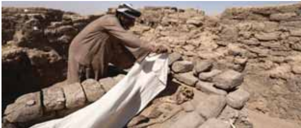
A man covers a skeleton in a 3,000-year-old lost city in Luxor province, Egypt on Saturday