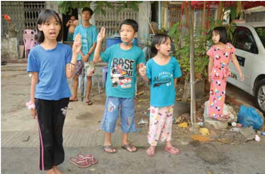
Children flash the three-fingered symbol of resistance as they join an anti-coup protest in Yangon on Saturday

On Wednesday, attacks were launched on opponents of military rule in the towns of Kalay and Taze in the country's north. In both places, at least 11 people — possibly including some bystanders — were reported killed. Security forces