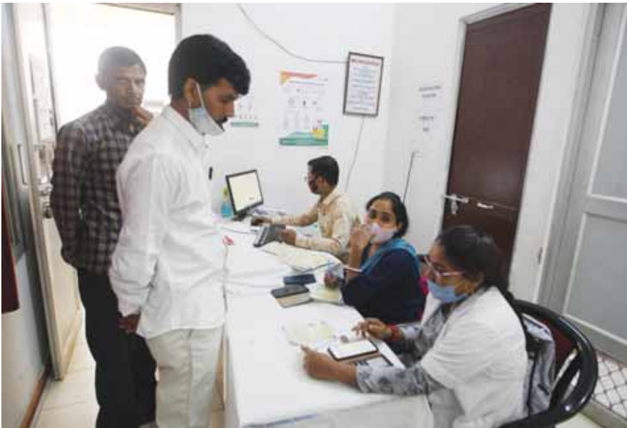
People getting registration done before receiving a dose of covid vaccine in Prayagraj

The situation on corona on Saturday was frightening. The doctors treating the patients