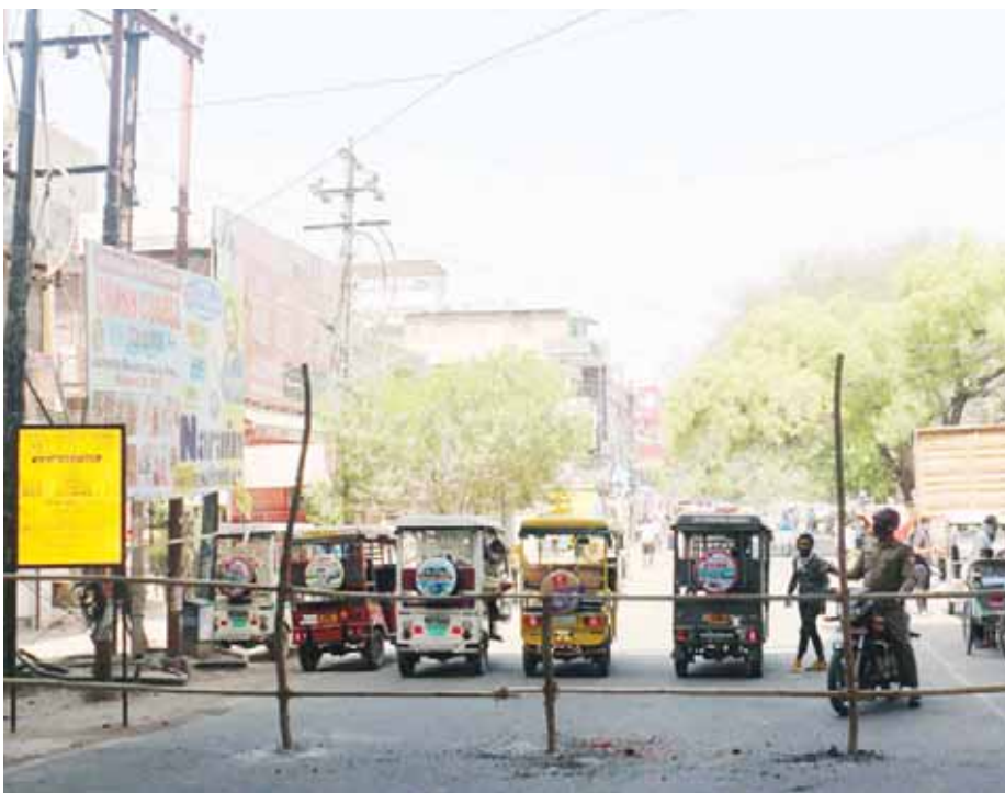
An area in Krishnanagar sealed after detection of Covid positive cases

In more than 20 districts, the administration has strictly enforced the corona curfew from 9 pm to 6 am. Three districts of Uttar Pradesh reported infections are four digits in the last 24 hours while in 26 districts, the number of new positive cases is in three digits. Only in two districts -- Hathras