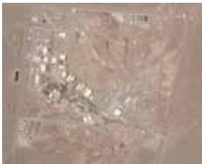
This satellite photo from Planet Labs Inc. shows Iran's Natanz nuclear facility

Dubai: Iran's underground Natanz nuclear facility lost power Sunday just hours after starting up new advanced centrifuges capable of enriching uranium faster, the latest incident to strike the site amid negotiations over the tattered atomic accord with world powers.