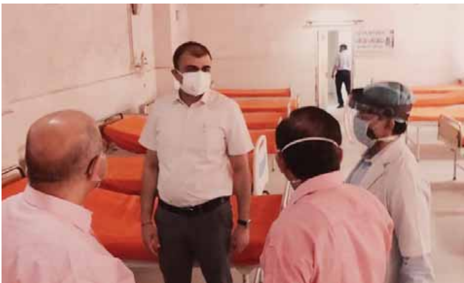
DM during an inspection of Balrampur Hospital on Sunday

The DM went around the hospital to check out on hygiene and sanitisation measures. He interacted with patients and directed the authorities to ensure all the