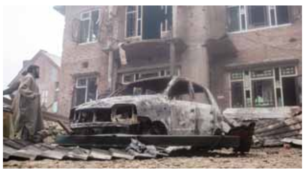
Villagers gather near a car and a house damaged during a gun battle between security forces and terrorists in Bijbehara, south of Srinagar, on Sunday

According to police records, he had joined the