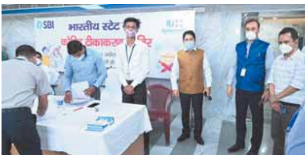
State Bank of India organised a Covid vaccination camp for staff and their family members at the head office in Lucknow in coordination with Apollo Medics and SBILD, in coordination with Health department on Sunday

"Even in the second wave, with teamwork we will definitely win the battle. Last year, because of the contribution of those involved in dealing with the pandemic, international organisations like the World Health Organisation praised the