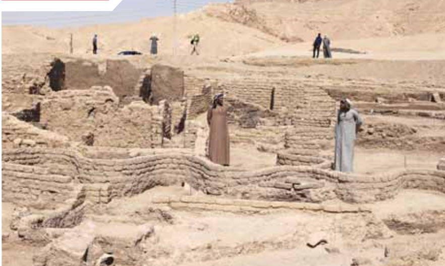
A 3,000-year-old lost city in Luxor, Egypt, which was unearthed recently