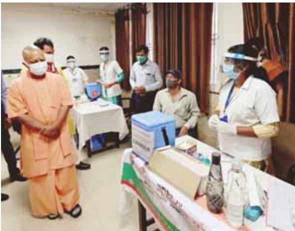
Chief Minister taking stock of vaccination under Tika Utsav at Shakti Bhawan in Lucknow on Sunday

"Caution is very important even after taking the vaccine. Treatment is an important protection against illness. Therefore, to avoid coron-