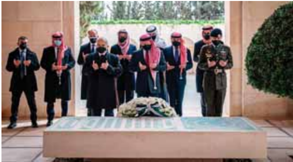
This photo from the Royal Court twitter account, shows Jordan's King Abdullah II, centre, Prince Hamzah bin Al Hussein, second left, and others during a visit to the tomb of the late King Hussein, in Amman Jordan on Sunday AP

The royal palace released a photo and video with Abdullah, Hamzah, Crown Prince Hussein and other dignitaries at the grave of King Talal in Amman, Jordan's cap-