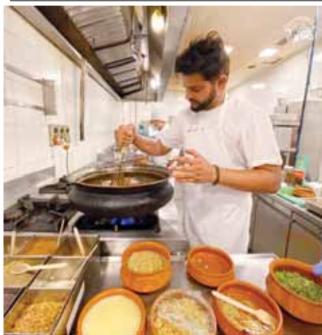
Chennai Super Kings' Suresh Raina spends time in kitchen @chennaiIPL