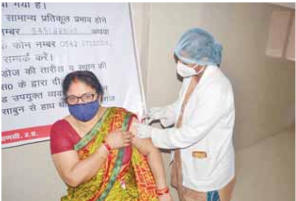
Four days vaccination festival begins in Varanasi on Sunday

Meanwhile, the district administration and Health department have started Tika Utsav on the call given by the Prime Minister Narendra Modi which will continue till April 14. The vaccination drive was launched at as many as 60 cen-