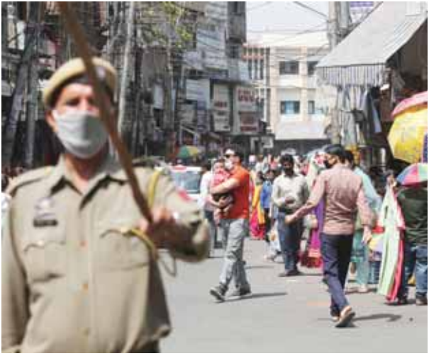
A policeman tries to ensure people wear face masks as a precaution against the coronavirus at a Sunday market in Jammu on Sunday