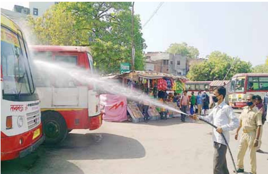
Buses being sanitised at Qaiserbagh bus station on Sunday

In the last 24 hours 390 fresh cases were reported in Gorakhpur, 291 in Jhansi, 255 in Meerut, 222 in Ballia, 221 each in Bareilly and Banda, 219 in Gautam Buddha Nagar (Noida), 214 in Chandauli, 210 each in Rae Bareli and Mirzapur, 188 in Moradabad, 162 in Jaunpur, 155 in Ghaziabad, 152 in Muzaffarnagar, 142 in Ghazipur, 140 each in Agra and Saharanpur, 138 in Mathura, 133 each in Lalitpur and Sonbhadra, 126 in Gonda, 105 in Barabanki, 103 in Bahrach and 102 in Sitapur.