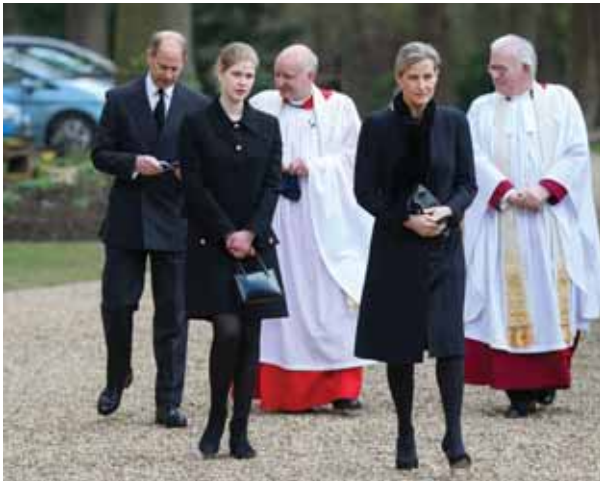
Britain's Prince Edward, Sophie Countess of Wessex and their daughter Lady Louise Windsor, attend the Sunday service at the Royal Chapel of All Saints at Royal Lodge, Windsor, in England on Sunday

"I feel very sorry and supportive of my mother, who's feeling it more than everybody else. The Queen, as you would expect, is an incredibly stoic person and she described his passing as a miracle, and she's contemplating. She