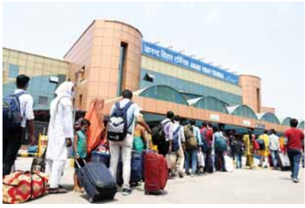
Passengers stand in a queue outside Anand Vihar Railway Station as they arrive to board train for their native place amid rise in Covid cases in New Delhi on Friday

Chandigarh: The Haryana Government on Friday announced consolidated guidelines to contain the spread of Covid-19, ordering closure of schools, colleges and coaching institutes till April 30 and capping number of attendees at gatherings and passengers in vehicles.