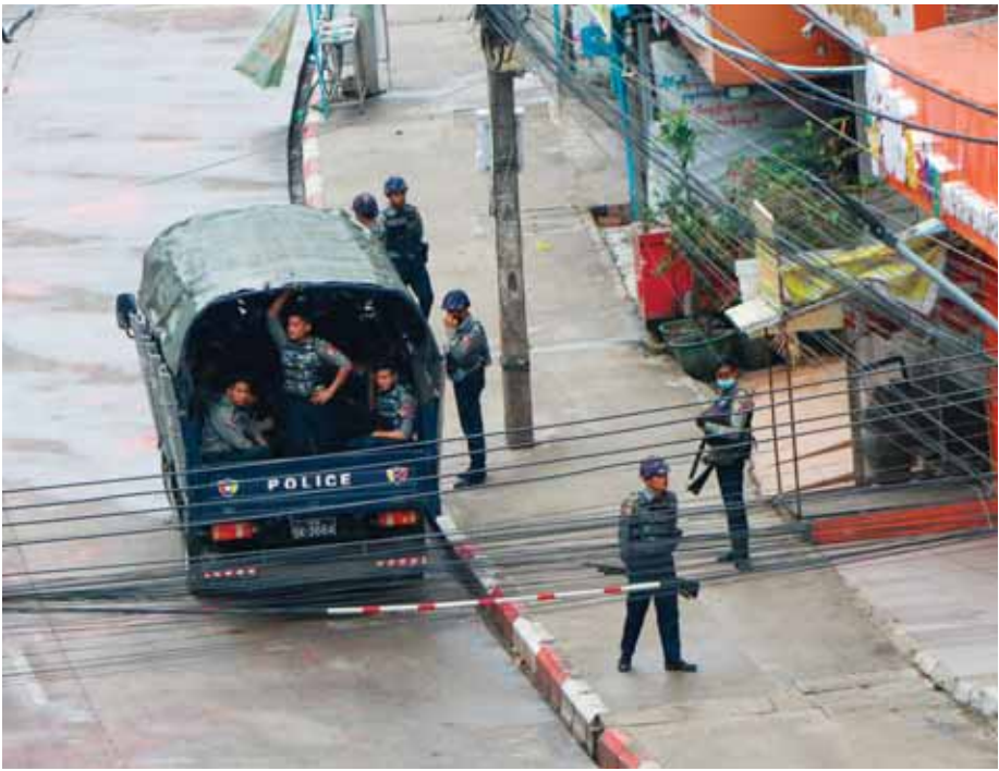
Police security forces stand by inside a police vehicle and on the sidewalk of Hledan Road in Kamayut township in Yangon, Myanmar on Friday