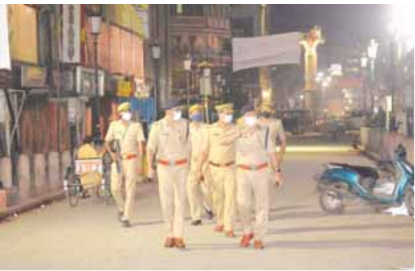
Police officers patrolling to ensure the protocol of COVID-19

In the first report of the day, 948 positive patients were found out of 2,967 reports received and this figure increased to 2,002 as per report provided by the Health department in the evening increasing the active cases to 13,114. Earlier, in view of finding hundreds of new positive cases, with 16 new hotspots, the number of active hotspots has increased to 490 with 10 green zones having been converted to