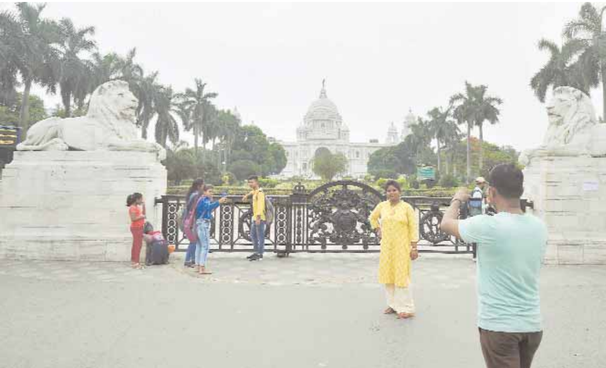
Visitors stand outside the closed gate of Victoria Memorial, amid rise in coronavirus cases across the country, in Kolkata on Friday