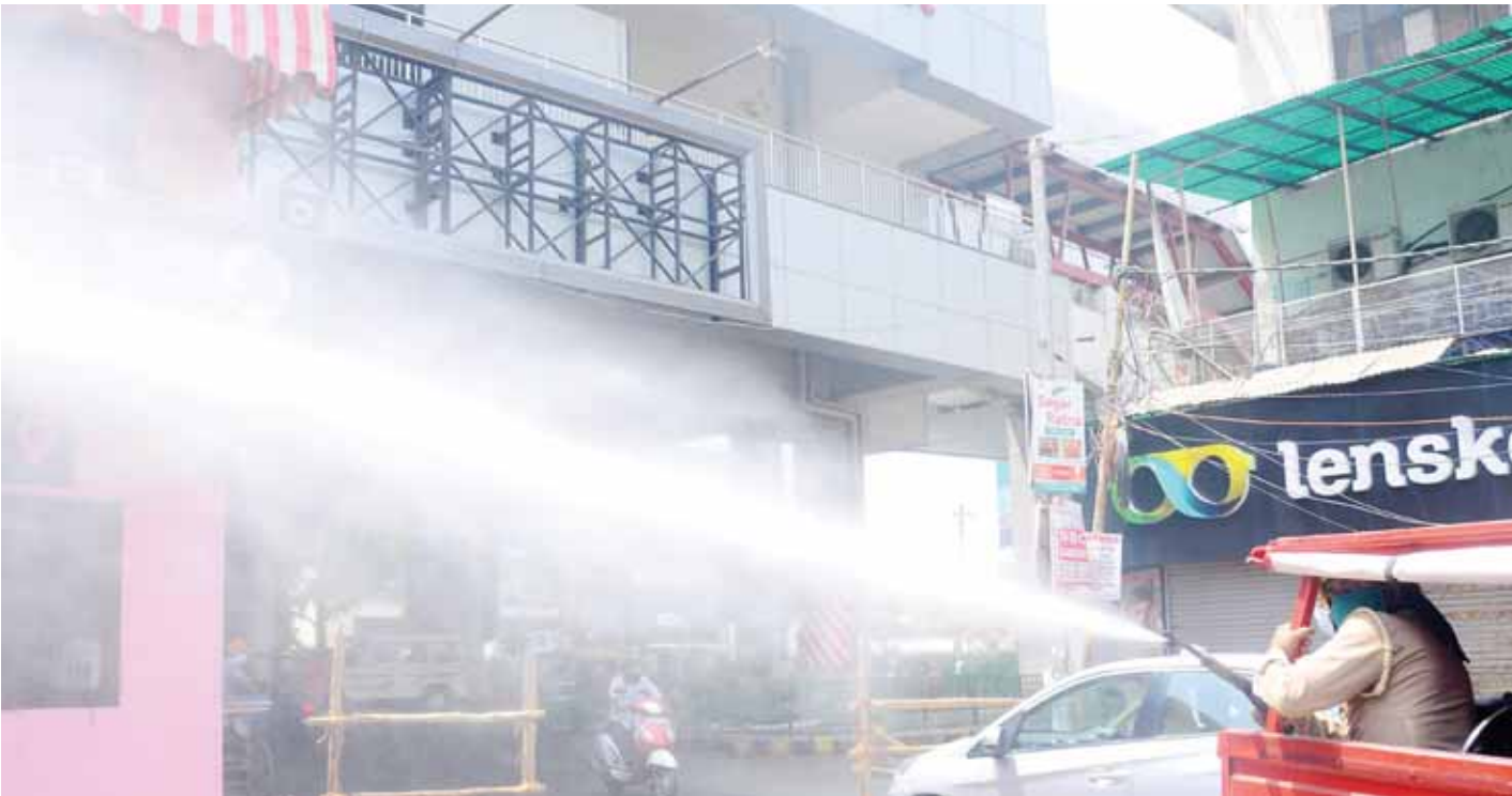
Fire Services department personnel carrying out sanitisation in Lucknow's Bhoolnath market on Friday