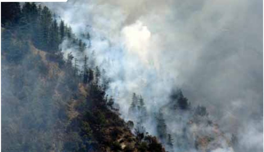
Smoke billows from a forest fire at the Ketti area in Shimla