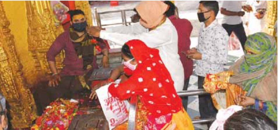
Devotees worshipping at the temple of Goddess Kushmanda in Durgakund on the fourth day of Chaitra Navratri

It is to be mentioned that the temple of Shringar Gauri is opened only one day in the year on the fourth day of Chaitra Navratri for the devotees. Thus,