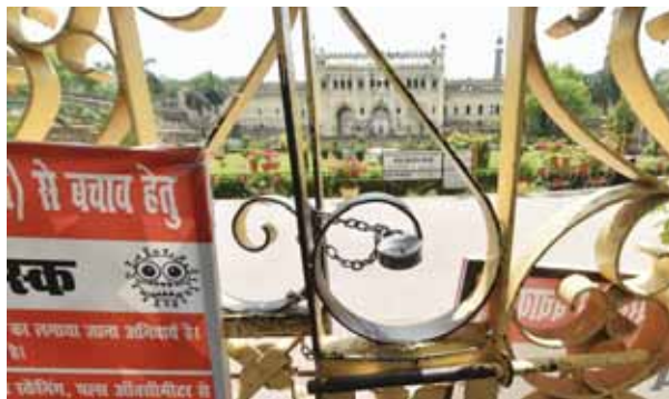
A view of the iconic building of Lucknow, Imambada. ASI protected monuments remained shut for visitors in view of the rising Covid-19 cases in the country, in Lucknow on Friday

In the review meeting, the CM ordered closure of markets, offices and other business establishments on Sunday so as to allow sanitisation of the markets across the State. "There will be a weekly closure in all rural and urban areas of the State on Sunday. Only sanitisation and emergency services will operate