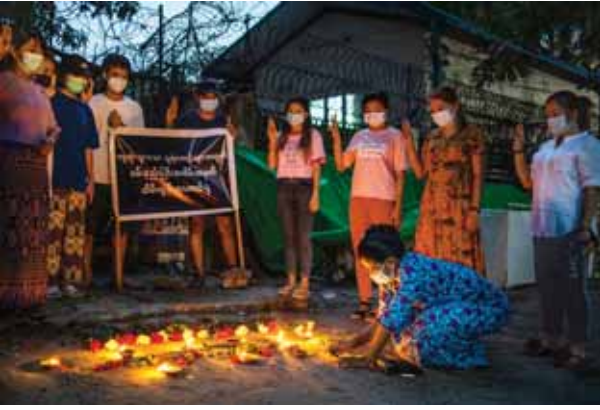
A woman lights a candle while others flash the three-fingered sign of resistance during a candlelight vigil to remember those who died in the military junta's violent response to anti-coup demonstrations in Yangon, Myanmar on Friday

Opponents of Myanmar's ruling junta went on the political offensive on Friday, declaring they have formed an interim national unity Government with members of Aung San Suu Kyi's ousted Cabinet and major ethnic minority groups. The move comes on the eve of a diplomatic initiative to solve Myanmar's crisis by the Association of Southeast Asian Nations, which is expected to hold a summit next week. A violent crackdown by the junta has failed to stem Opposition to the coup, and as the Army has spread the fight to ethnic minorities in border areas, some ASEAN members believe the crisis threatens regional stability. Opponents of the coup have been seeking an alliance with ethnic minority groups as a way of strengthening their resistance. The minorities for decades have kept up on-again, off-again armed struggles for