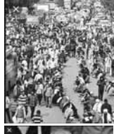
Tomar had identified their concerns and offered them a proposal to suspend the laws for 1.5 years and set up a committee to examine them.

Union Agriculture Minister Narendra Singh Tomar on Saturday appealed to the farmers protesting at Delhi borders to call off their long-running agitation in view of second wave of Covid-19 cases, saying the Government is ready for a discussion whenever they come with a concrete proposal. Tomar expressed concerns about the farmers' health and wellbeing as India witnessed a record surge of over 1.45 lakh coronavirus cases on Saturday. "Thousands of farmers have been protesting against the three new agri-marketing laws for nearly five months now, braving the raging pandemic. There has been no headway in the logjam over the issue since January 22, when the 11th and the last round of formal talks happened between the Central government and the protesting farmer unions. "Now in the second wave of pandemic, the entire nation and the world is following COVID protocols. Even the protesting farmers should follow the protocols. Their life is important for us," Tomar said. "In the current COVID-19 situation, I urge them (agitating farmers) to call off their protest. The government is ready for a discussion whenever they come with a proposal," he said. Stating that there is no "dissatisfaction" among the farming community across the country over the new farm