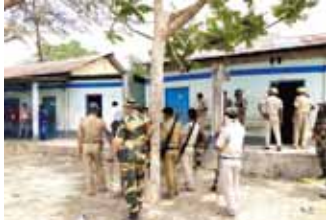
Security personnel keep vigil at a polling station after Election Commission ordered of stopping the voting exercise at polling station number 126 in Sitalkuchi, where clashes erupted between locals and Central Forces, at Sitalkuchi in Cooch Behar district on Saturday

Manirul and Samuil (three of the same family) died when the Central Forces opened fire to disperse a crowd of 300-400 villagers that had attacked booth number 126, following rumours that a child had been beaten to death by the CISF personnel. Five others too were injured in the firing and had been admitted to the local hospital, sources said.