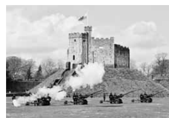
Members of the 104th Regiment Royal Artillery fire a 41-round gun salute in the grounds of Cardiff Castle in Cardiff on Saturday

Gun salutes in all capitals of the United Kingdom as well as aboard some Royal Navy ships on Saturday honour Prince Philip, the husband of Queen Elizabeth II, and the Duke of Edinburgh, who passed away aged 99 at Windsor Castle on Friday. The 41 rounds fired in London, Cardiff, Belfast and Edinburgh at a rate of one shot per minute from midday local time on Saturday mark the start of an eight-day national mourning period. "The tradition of Gun Salutes being fired throughout