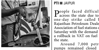
er, continues to remain over Rs 100 a litre in the city as is the case with several cities across the country.

In Mumbai, petrol continues to be priced at Rs 96.98 a litre and diesel at Rs 87.96 a litre. Premium petrol, however,