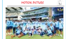
WE'RE A TEAM: Delhi Capitals players and support staff pose for group photo at the end of final training session ahead of IPL 14 first game against Chennai Super Kings