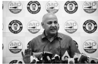
Deputy Chief Minister Manish Sisodia Saturday requested the Prime Minister Narendra Modi to cooperate with Delhi Chief Minister Arvind Kejriwal in the fruitful dialogue for our nation's progress.

With the Government's concept of home isolation, creating micro-containment zones and other Covid-19 protocol followed by other States and even the BJP, ruled centre is reiterating the same. Deputy Chief Minister Manish Sisodia Saturday requested the Prime Minister Narendra Modi to cooperate with Delhi Chief Minister Arvind Kejriwal in the fruitful dialogue for our nation's progress. "We are happy that the Central Government is following the Covid-19 protocol conceptualised by the Delhi Government. I would recom-