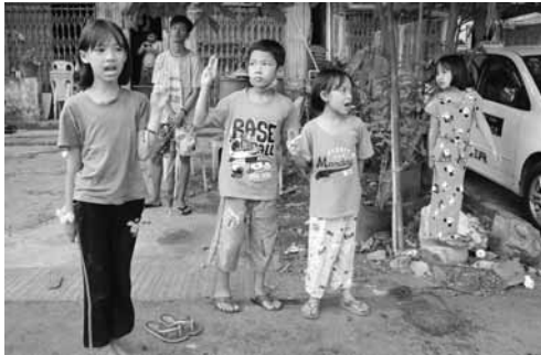
Children flash the three-fingered symbol of resistance as they join an anti-coup protest in Yangon on Saturday

On Wednesday, attacks were launched on opponents of military rule in the towns of Kaley and Taze in the country's north. In both places, at least one person — possibly including some bystanders — were reported killed. Security forces