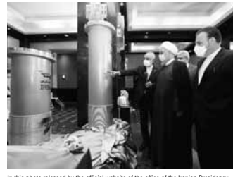
In this photo released by the official website of the office of the Iranian Presidency, President Hassan Rouhani, second right, listens to head of the Atomic Energy Organization of Iran Ali Akbar Salehi while visiting an exhibition of Iran's new nuclear achievements in Tehran, Iran on Saturday

Iran's nuclear program is also developing IR-8 centrifuges. Since January, Iran has begun enriching uranium to up to 20% purity, a technical step away from weapons-grade levels, though Iran leadership insists the country has no desire to develop a nuclear weapon. Former US President Donald Trump pulled the US