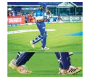
Mumbai Indians skipper Rohit Sharma wore shoes highlighting the great one-horned rhinoceros during the IPL opener against Royal Challengers Bangalore on Friday to help build awareness about conserving the endangered species

decides to open, he definitely would have worked out the combination of the Indian line-up as well. The IPL matches are just going to give him that greater exposure to open and structure the innings because we (India) are leading into the World Cup. "And if Virat and Rohit Sharma open in the World Cup and lay a strong foundation, it will be easy for players like Suryakumar and Hardik to follow," she added. One thing that makes this edition different from yesteryears is that there are no home games for any team. It is going to play a key role in the tournament, according to the former India captain. "The neutral venue concept will affect a lot in this tournament because teams make strategies according to home conditions. When it was announced that the tournament would be held in India, it meant seven home games for every team. So everyone picked the players according to that but now when it is not there, it will have an impact," Anjum opined. "On the 'one player to watch out for' in the tournament, she put her weight behind Hardik Pandya. "He will have a fantastic tournament. He had one in Dubai too and, this time, he will do even better," she concluded.