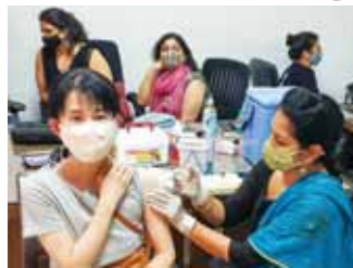
A medic administers the Covid-19 vaccine dose to a Japanese woman at IMT Industrial Association office, at Manesar in Gurugram district on Saturday

Meanwhile, stopping short of announcing a full-fledged lockdown in West Bengal, Chief Minister Uddhav Thackeray said the State Government would have no alternative but to resort to stern restrictions to break the chain of transmission