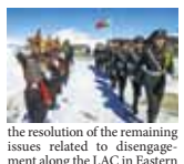
from their "leaders", continue their communication and work towards a mutually acceptable resolution of remaining issues at earliest. The two commanders also agreed to "jointly maintain stability on the ground, avoid any new incidents and jointly maintain peace in the border areas."

In a statement issued here on Saturday, the Defence Ministry said the two sides had a detailed exchange of views for