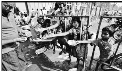
It said that a person, who is compelled to beg due to certain circumstances, cannot be faulted for his actions.