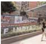
Pointing to the recent rise in Covid-19 cases, the EC said instances had come to its notice where norms of social distancing, wearing of masks, etc. have been flouted in disregard to the Commission's guidelines dated August 21, 2020, on Covid-19 safe poll campaigning.

In a letter to leaders of all recognised political parties, the EC said, "It is widely known that in recent weeks, Covid cases are being reported in larger numbers. However, instances of election meetings/campaigns have come to the notice of the commission, where norms of social distancing, wearing masks have been flouted in disregard to the commission's guidelines."