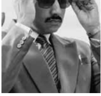
evidence of his singular non-guilt. The system, the corruption in high places and the personal betrayal are all placed on the stock market to prop up this man's innocence, or should we say his personal argument.