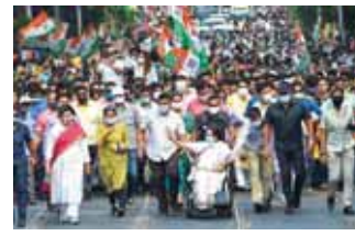
West Bengal Chief Minister Mamata Banerjee during a roadshow campaign in Kolkata on Thursday.

This comes after the EC, laid Friday, sent a letter to all political parties in the fray in