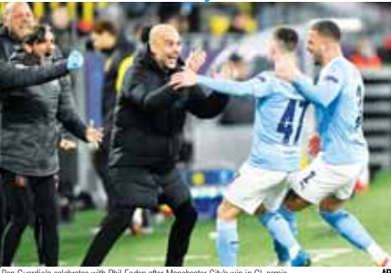
Pep Guardiola celebrates with Phil Foden after Manchester City's win in CL semis

(PSG) are, Neymar is an excellent player and they have eliminated the world's best team," said Guardiola.