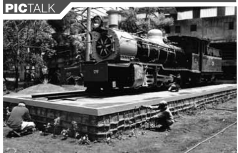
Preparations to showcase a heritage engine, on the eve of the 168th anniversary of the first train run in India, in Thane

Johnson said the rapid drop in the COVID-19 deaths in the UK was because of the three-month lockdown and not so much because of the vaccination. We don't know whether he has any empirical evidence to back his claim, but the fact remains that the condition in his country has steadily improved while India has consistently been climbing the chart of the worst-hit countries, lagging behind only the US at the number two position, for now. Our leaders, therefore, should be ashamed of facing the electorate, for whatever it is worth, rather than milling with them to garner votes. God forbid, but if they do contract the virus — as has become the lot of a host of them — they immediately quarantine themselves in the best of medical institutes and access the best of medical care, of course at the cost of the taxpayers' money. But what about the fate of the poor masses that they leave behind, afflicted? It is for several similar reasons that after almost winning the war against COVID, we are again pinned down on the mat; thanks partly to our insouciance and largely to our political leaders. All the festivals, including the celebration of democracy, can be cherished in the real sense only when the nation's people remain healthy and enjoy their basic right to life.