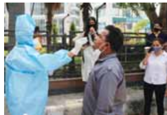
A health worker collects swab samples from a man as coronavirus cases surge across the national Capital in New Delhi on Thursday.

Keeping in mind the essential nature of work and jobs done during weekdays, the Government has decided to issue curfew passes.