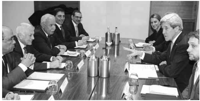
Carta of Women (1999)

Gender equality is a basic human right enshrined in our Constitution and its achievement has multiplier socio-economic benefits. India is committed to the timelines of the Sustainable Development Goals (SDGs) set by the United Nations which place gender parity at the heart of bringing a gender perspective to all development initiatives. However, the COVID-triggered economic stress will defer the timelines for achieving the SDGs by 2030. The post-pandemic policy initiatives require increased gender-specific budgeting and recovery strategies: The Modi Government's flagship schemes that positively impacted women during the first term are an outcome of closely aligning with the Gender Responsive Budgeting (GRB) norms of the 'UN Women'. The GRB is a globally followed "best practice" among nations which allocates fiscal expenditure with specific gender perspectives. Though the Magna