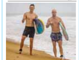
SURFING THEIR WAY: Mumbai Indians' foreign recruits — Trent Boult, left, and Chris Lynn spend time in Chennai beach on Thursday enjoying water sport