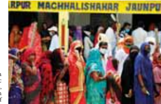
People stand in queues to cast their votes during local elections in Kurapur village in Uttar Pradesh on Thursday.

At present, corona curfew is being enforced in these districts between 9 pm and 6 am. To prevent the spread of the disease among the children