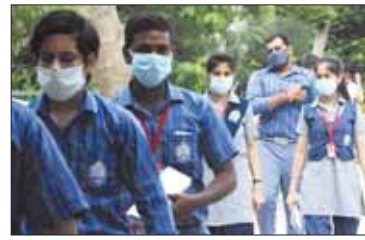
Also, the government last month decided to close all schools, central and private schools and to promote the students of all classes except X and XII without examining them.

The Chhattisgarh Board of Secondary Education (CGBSE) on Saturday described as "completely wrong" that it has postponed the Class XII Board examination in the state amid the Covid-19 crisis. CGBSE Secretary V.K. Goyal clarified that no such order has been issued. A reported order which went viral on social media is "totally fake", he said in a press release. On April 9, the CGBSE announced it was postponing the Class X examination that was scheduled to be held from April 15 to May 1 due to a spike in coronavirus cases in the state.