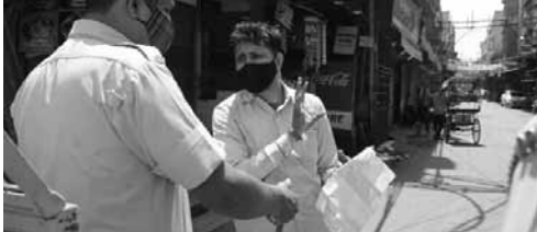
Delhi police personnel checks passing during weekend curfew in Delhi on Saturday

Life in the national Capital came to a halt after weekend curfew was imposed by the Delhi Chief Minister Arvind Kejriwal, amid rise in Covid-19 cases. The CM also appealed to people to adhere to the restrictions. Roads, markets and buses across Delhi were closed from Saturday morning, as the weekend curfew began in the city. Apart from essential service providers working in pharmacies, grocery shops, hospitals, some restaurants, police stations, and banks, a majority of the National Capital's residents appeared to have stayed at home. The weekend curfew aimed at breaking the chain of spiralling coronavirus infections were clamped at 10 pm on Friday and will continue till 5 am on Monday. Deputy Police Commissioner, S N Shrivastava also remained in the field and visited several places across the city. Police pickets could be seen around the city with police personnel and officials were deployed, checking people having valid movement passes and issuing challoan to those not following the guidelines. Since Saturday morning, all the major markets including Sarojini Nagar, Connaught