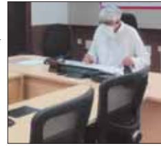
"We are expending two lakh active cases in the second wave and so we need 40,000 oxygenated beds," he said.

Expressing concern over the Covid-19 crisis, Chhattisgarh Health Minister T.S. Singh Deo on Saturday raised the issue of shortage of Remdesivir injection and about establishment of oxygen plants in the state. In a virtual review meeting, Singh briefed Union Health Minister Dr Harsh Vardhan about the grim situation in the state. Dr Harsh Vardhan was reviewing the situation in 11 states. He said there was 100 per cent occupancy of ICU beds.