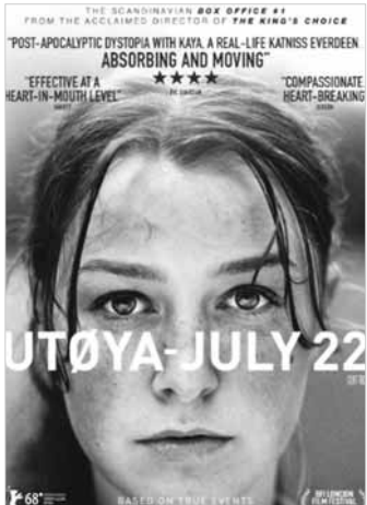
UTOYA, JULY 22

Here, the movie pans out through the eyes of youngsters and the terrorist is given a grand go-by, being allowed to view the screen only in pitiful scenes with almost an abstract presence to give the audience some shape of the orchestrator. An English version of this film is all set to premiere on Netflix and that promises to take over in starkness, blood and gore from Utoya. For now, however, Utoya is a powerful story told candidly