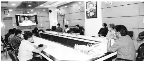
Chief Minister Hemant Soren during a virtual all party meeting about the rising infection of coronavirus, in Ranchi on Saturday

Holding an all-party meeting on virtual mode here on Saturday Chief Minister Hemant Soren appreciated all the political parties for making suggestions in the meeting. "With the cooperation of all, we will be able to prevent the infection of Corona once again. Strict steps will be taken to break the corona chain," he said. At the same time, various political parties told the CM that in this time of crisis, they are with the government. Whatever decision will be taken by the government, they will cooperate. There will be no politics of any kind in this. The CM discussed in detail with representatives of various political parties for effective control over Covid-19. During this time, several important suggestions were made by political parties in relation to prevention and control of Corona. The CM said that the important suggestions that have come up during the deliberations in the all-party meeting