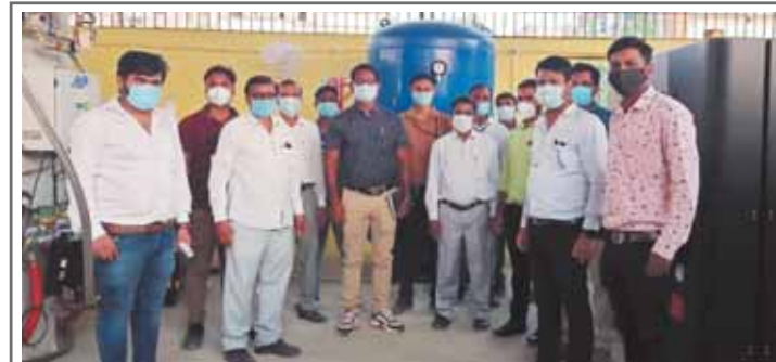
An oxygen production unit started at the Medical College Hospital in Jagdalpur, the divisional headquarters of Bastar region. The unit will help combat the Covid-19 pandemic in Chhattisgarh.

Milk parlours and bakeries will open between 6 to 9 am and 5 to 7 pm. Newspapers can be delivered during this time. Also, 24x7 home delivery of milk will be allowed, the order said. Vegetable vends and fruit shops can open from 9.00 am to 1.00 pm. All liquor shops, commercial and departmental zones, temples and tourism sites will be shut. All Central, state government, semi government and private offices as well as banks will be closed. Telecom, sanitation, water supply, maintenance and health departments will work. Only 20 people will be allowed in marriages and social gatherings. Narayanpur is among 23 districts where lockdown has been imposed amid a surge in Covid-19 cases and fatalities in Chhattisgarh.