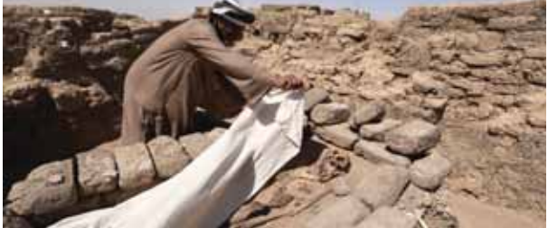
A man covers a skeleton in a 3,000-year-old lost city in Luxor province, Egypt on Saturday