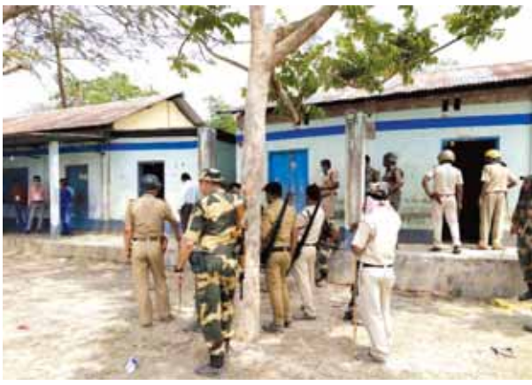
Security personnel keep vigil at a polling station after Election Commission ordered to stop the voting exercise at polling station number 126 in Sitalkuchi, where clashes erupted between locals and Central Forces, at Sitalkuchi in Cooch Behar district on Saturday