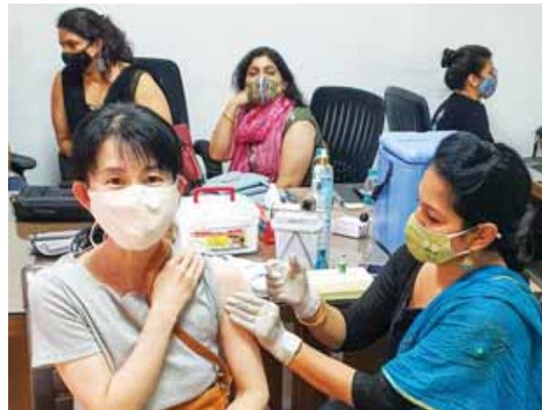
A medic administers the Covid-19 vaccine dose to a Japanese woman at IMT Industrial Association office, at Manesar in Gurugram district on Saturday

Meanwhile, stopping short of announcing a full-fledged lockdown in worst Covid-19 hit Maharashtra, Chief Minister Uddhav Thackeray said the State Government would have no alternative but to resort to stern restrictions to break the chain of transmission