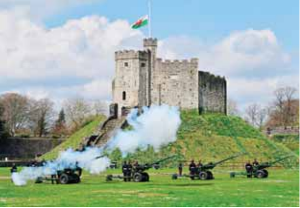
Members of the 104th Regiment Royal Artillery fire a 41-round gun salute in the grounds of Cardiff Castle in Cardiff on Saturday

"The tradition of Gun Salutes being fired throughout