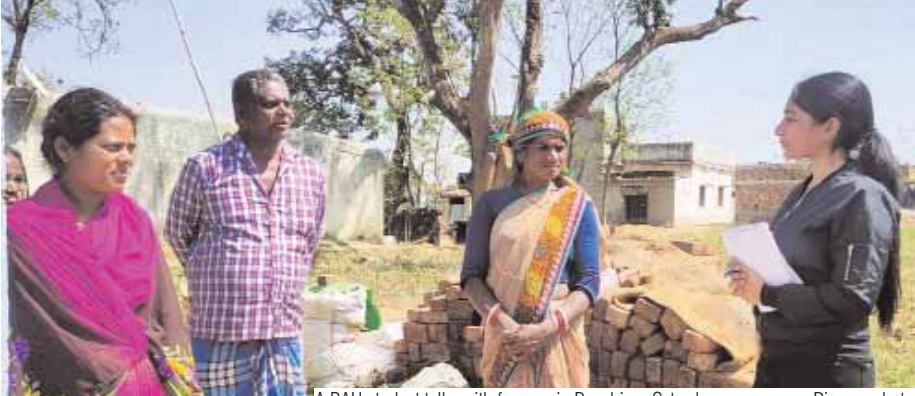
A BAU student talks with farmers in Ranchi on Saturday

Due to the lockdown, the students were instructed to complete the RAVE program in their nearest villages. For the first time agricultural graduate students made direct contact