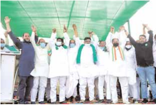
Chief Minister Hemant Soren, JMM candidate Hafizul Ansari alongwith party leaders join hands during an election campaign rally ahead of the Madhupur bypoll in Deoghar district on Saturday

Soren said that there are six candidates in Madhupur bye-