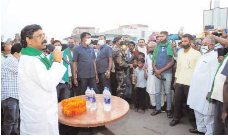
Chief Minister Hemant Soren addresses a gathering during an election campaign rally in support of JMM candidate Hafizul Hassan ahead of the Madhupur bypoll in Deoghar district on Saturday

“Everyone needs a roof, everyone needs food and this work cannot be done in the name of caste and religion. But, people will come to divide you in the name of caste and reli-