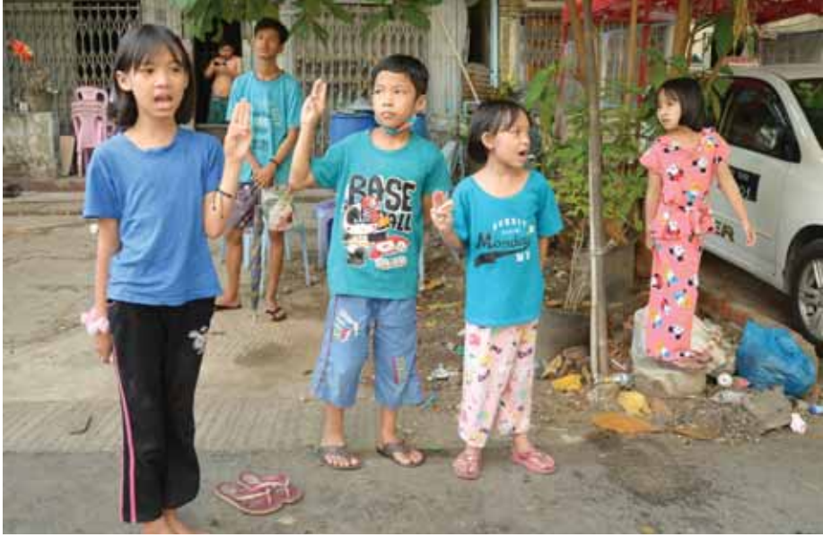
Children flash the three-fingered symbol of resistance as they join an anti-coup protest in Yangon on Saturday

On Wednesday, attacks were launched on opponents of military rule in the towns of Kalay and Taze in the country's north. In both places, at least 11 people — possibly including some bystanders — were reported killed. Security forces