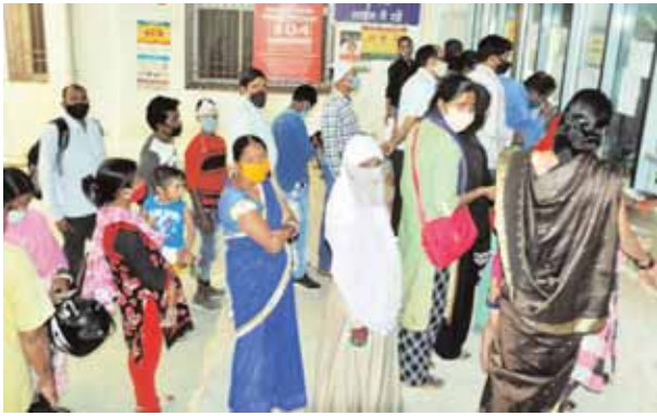
People stand in a queue at a Covid-19 sample collection centre in Ranchi on Saturday

As per figures compiled by the National Health Mission (NHM), Ranchi accounts for 41 of the 82 Covid casualties reported in the state in the past one month. On the other hand, East Singhbhum, which con-