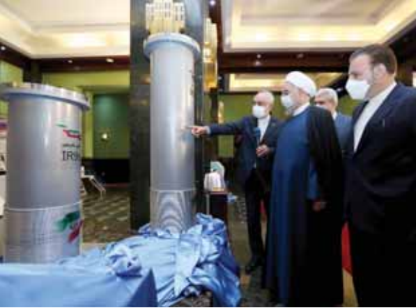
In this photo released by the official website of the office of the Iranian Presidency, President Hassan Rouhani, second right, listens to head of the Atomic Energy Organization of Iran Ali Akbar Salehi while visiting an exhibition of Iran's new nuclear achievements in Tehran, Iran on Saturday

Since January, Iran has begun enriching uranium at up to 20% purity, a technical step away from weapons-grade levels, though Iran's leadership insists the country has no desire to develop a nuclear weapon. Former US President Donald Trump pulled the US