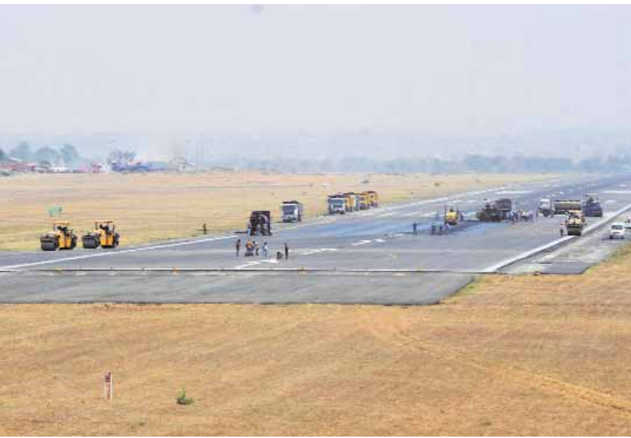
Runway repair in progress at Birsa Munda International Airport in Ranchi on Saturday. Ranchi Airport will be inoperative flights every day for 7 hours for the next 2 months

However, in the past one month, the state reported 50 per cent of the casualties. East Singhbhum, on the other hand, accounts for 363 Covid deaths, which is the highest among the 24 districts in the state, and is about 30 per cent of the total Covid casualties.