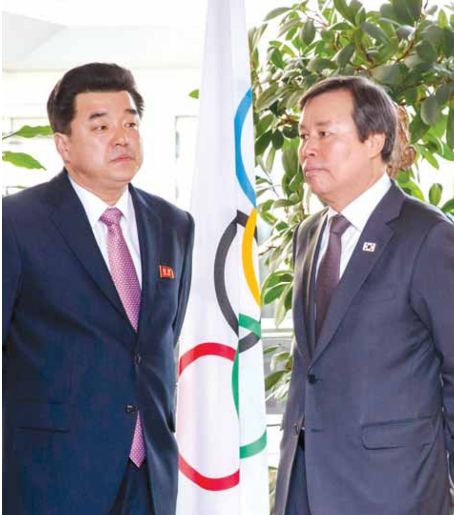
In this Feb. 15, 2019, file photo, North Korea’s Olympic Committee President and Sports Minister Kim Il Guk, left, and South Korean Sports Minister Do Jong-hwan attend a meeting with the IOC for their bid to co-host the 2032 Summer Olympics, at the IOC Headquarters in Lausanne, Switzerland

Pyongyang has developed a reputation for withdrawing from talks with Seoul and Washington before returning at the last minute to boost its bargaining power. But given that the country has been on high alert over Covid-19, experts say there is little chance that it will