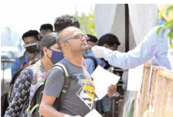
A medic collects swab samples from a person for Covid-19 test at a camp in Ranchi on Saturday

As per Government data, Dhanbad and Hazaribag also