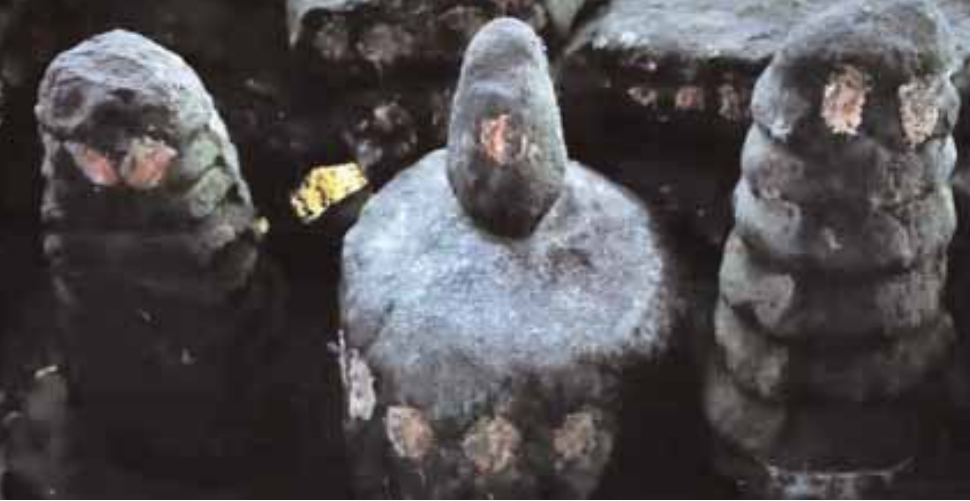
A representational picture of Buddhist era relics found in Hazaribag