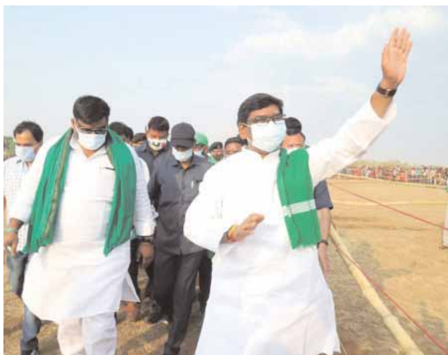
Chief Minister Hemant Soren waves to people during an election campaign rally in support of JMM candidate Hafizul Hassan ahead of the Madhupur bypoll in Deoghar district on Saturday

Meanwhile, the State on Saturday administered the first dose of the vaccine against Covid-19 to 90,243 people, thereby achieving 75 per cent of the target for the day. The second dose was administered to only 6,613 people, hardly 3 per cent of the beneficiaries registered for the job on the day.