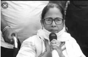
The EC had on Thursday issued a notice to Mamata for her provocative remarks against Central forces

Defending her controversial remarks over the Central forces’ alleged partisan role in the ongoing State Assembly polls, West Bengal Chief Minister Mamata Banerjee said there was no attempt to threaten, incite or influence the electorate against the force and any allegations to the contrary were unfounded’ and ‘denied’. Responding to the Election Commission’s notice Mamata said she has the highest regard for the Central forces and ‘commend and laud their contributions to the safety and the security of the country’.