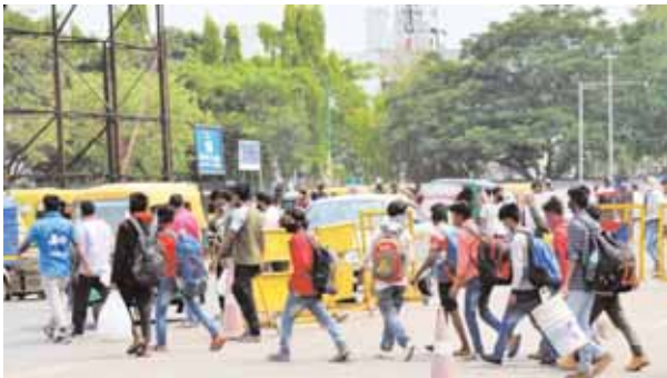
Migrants workers from different parts of country arrive at Hatia Railway station via Bhubaneswar and Raipur, amid the second wave of coronavirus pandemic, in Ranchi on Saturday

A National Lok Adalat was organised by Jharkhand State Legal Services Authority across the State under the aegis of National Legal Services Authority on Saturday. The National Lok Adalat was in virtual mode, on all matters. As 15,765 matters were disposed of and an amount of Rs 24,96,35,395 was settled in the National Lok Adalat.