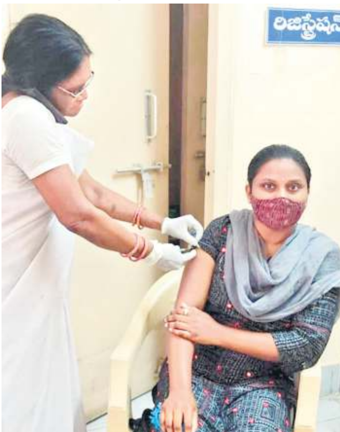
A nurse administers Covid-19 vaccine while speaking over the phone in Vizianagaram's Parvathipuram. With the picture going viral on social media, the district health officials served a show-cause notice on the nurse.