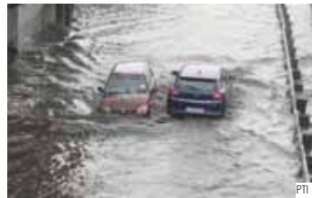
Maharana Pratap Chowk, Atul Kataria Chowk, IIT Manesar Chowk, HUDA City Centre Road, Sukhrali Road, old Delhi-Gurugram Road, Sector 30 underpass, Sector 22-23 Road, between Jawala Mill and Dundahera and service lane of the eastern side of the highway.

The Delhi-Jaipur Expressway was also witnessed waterlogging. Not only highway and State highways Gurugram's major roads like Hero Honda Chowk, Signature Tower, Bansa Chowk, Huda City Centre Road and more were found to be waterlogged. "The crucial points" where the waterlogging witnessed are Hero Honda Chowk, Rajiv Chowk, Signature Tower Chowk, Bansa Chowk, Huda City Centre Road, Subhash Chowk, Sohna Road, Golf Course Extension Road, the main Sohna Chowk,