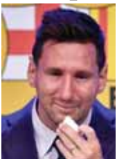
Lionel Messi cries at the start of a press conference at the Camp Nou stadium in Barcelona on Sunday. (2nd photo) Lionel Messi shows to photo with all the trophies he won as a player with FC Barcelona

"I have still not come to terms with the reality of leaving this club now, changing my life. I love this club."