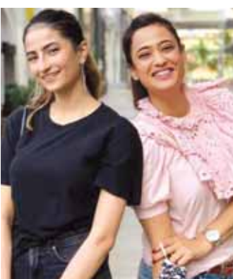
Shweta, who is a part of the 11th season of Khatron Ke Khiladi , hosted by filmmaker Rohit Shetty on Colors, revealed that now since her daughter has joined showbiz, there are a lot of common topics to discuss.

"I am not a star, I am an actor. People know me, yes, but I won't say I am a star by any means," she shared with a laugh.