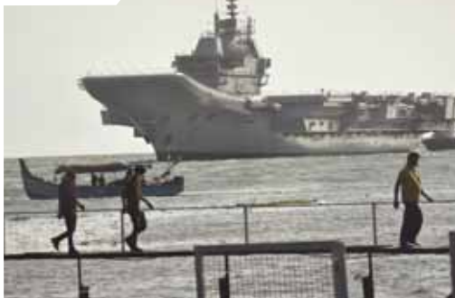
Indigenous Aircraft Carrier Vikrant returns after successful maiden sea voyage, in Kochi