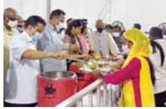
Delhi Chief Minister Arvind Kejriwal distributes food during the launch of the Night Shelter Feeding Initiative in association with the Akshaya Patra Foundation

The chief minister said "The poorest of the poor people reside in the shelter homes operated by the Delhi Government. They are those