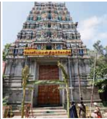
Devotees offer prayers on the occasion of Anuvahya in front of the closed Koniarnam temple ahead of the third wave of Covid-19, in Coimbatore on Sunday