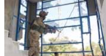
With a greater sense of urgency to the Afghan calls for civilian protection, ceasefire, an end to violence continue, I am heartbroken to note that there might be a grim new record of civilian harm by end of this year.