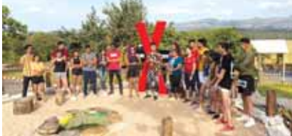
"We have devoted a lot of time and energy to this show, and the results are out there for everyone to see. The first two episodes of Extreme Survivors is streaming now on the TV and Movie app named 'VIS