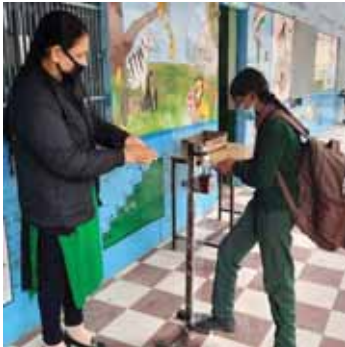
PTI ■ NEW DELHI

The Delhi Government on Sunday allowed students of Class 10 to 12 to visit schools from today for work related to admission, practical activities for board exam. It also allowed the health checkup camps situated on school campuses to resume.