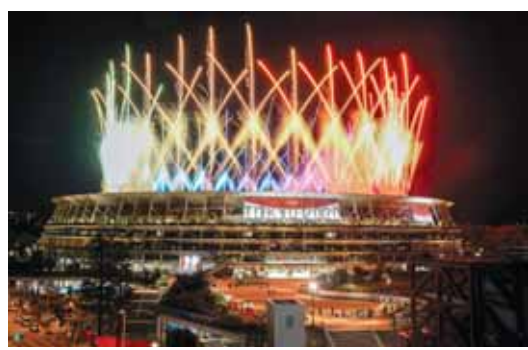
Fireworks at the stadium during the closing ceremony of the 2020 Tokyo Olympics on Sunday in Tokyo

"The members of the organisation have been collecting funds domestically and abroad through donations particularly in the form of Zakat,