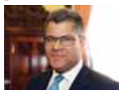
Minister said he was simply throwing everything at achieving a global consensus ahead of the talks in Glasgow.