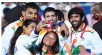
Athletes from India take a selfie during the closing ceremony in the Olympic Stadium at the 2020 Olympics on Sunday in Tokyo

From pizzas to free air travel, rewards are raining on the Indian athletes who won medals for the country at the Tokyo Olympics. As a token of appreciation, Go First, previously known as GoAir, on Sunday announced free travel for all six Indian athletes and the men's hockey team who won medals at the Tokyo Olympics. A Bengaluru-based regional carrier Star Air, which connects