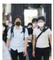
Concerns are growing over a potential collapse of the medical system and the further spread of the Delta variant during the Bon holiday period since people usually return to their hometowns or travel elsewhere during this period.

To curb the resurgence of the Covid-19 infections, the Olympics were mostly held with spectators absent. The state of emergency for Tokyo will not end when the Paralympics are scheduled to begin on August 24.