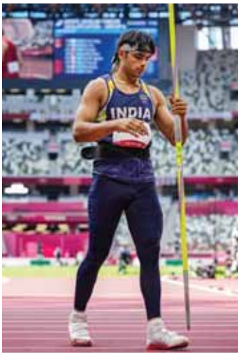
Neeraj Chopra in action during men's javelin throw event

The Lausanne (August 26) and Paris (August 28) legs as well as the Zurich finals (September 9) will have men's javelin events. The Olympics is the grandest stage for any athlete and can be intimidating but not for 23-year-old Chopra, who said he did