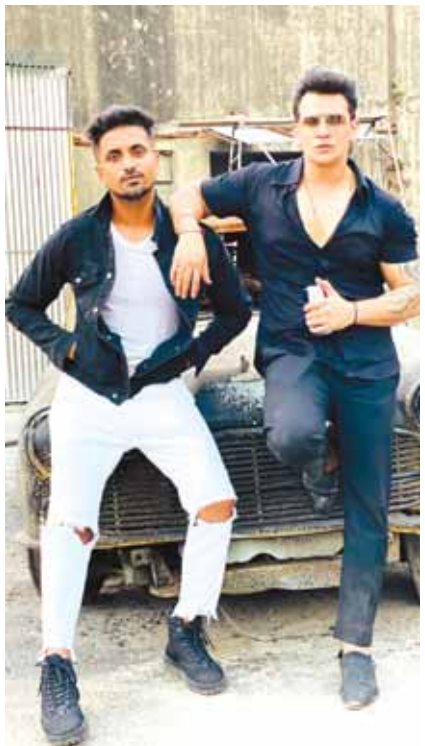
preneur working in the field for over eight years, expresses that the buzz surrounding Extreme Survivors is no fluke as it would be promising for audiences who love adventure and high-octane stunts and tasks.