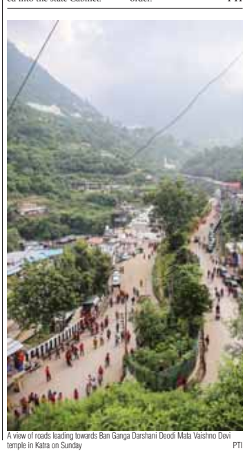
A view of roads leading towards Ban Ganga Darshani Deodi Mata Vashno Devi temple in Katra on Sunday