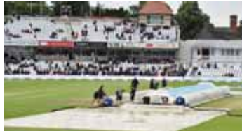
Groundsman cover the pitch area after rain delayed start of the fifth day play of first Test between England and India at Trent Bridge in Nottingham on Sunday

It would have taken a special bowling effort from England to stop India from