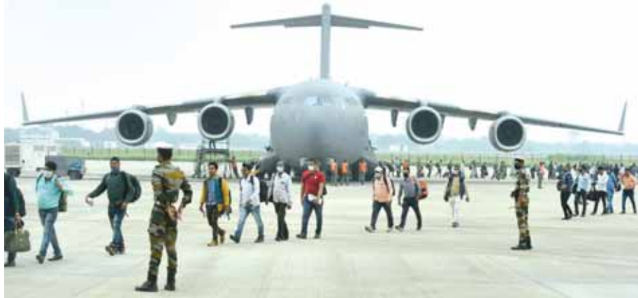
People who were stranded in crisis-hit Afghanistan arrive by a special repatriation flight of the IAF at the Hindon Air Force Station, in Ghaziabad on Sunday

"We have decided to vaccinate Afghanistan returnees with free polio vaccine — OPV