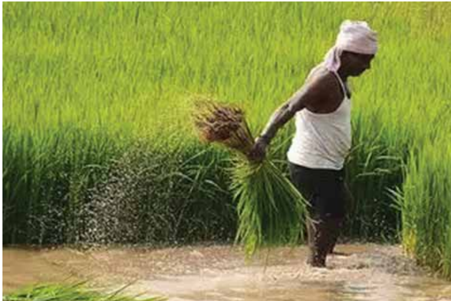
NEW DELHI

With monsoon deficiency still 8 percent in the country, area sown to summer crops like paddy was lagging behind by 1.55 per cent at 1,043.87 lakh hectare so far in the ongoing kharif season of the crop year 2021-22 (July-June) as against 1060.37 lakh hectare last year. The India Meteorological Department (IMD) on Sunday said that current rainfall activity over plains of northwest India was likely to reduce from Monday. The Ministry of Agriculture on Sunday released a kharif sowing data said that area sown to paddy (the main kharif crop) remained marginally lower at 374.03 lakh hectare till August 20 of this kharif season as against 378.07 lakh hectare in the year-ago period. Similarly, area sown to oilseeds remained slightly lower at 187.88 lakh hectare as against 189.98 lakh hectare, while that of coarse cereals