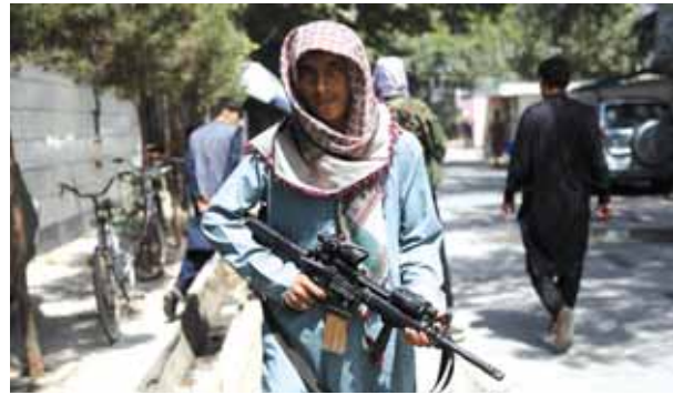
A Taliban fighter stands guard at a checkpoint in the Wazir Akbar Khan neighbourhood in the city of Kabul, Afghanistan on Sunday

The changes come as the US Embassy issued a new secu-