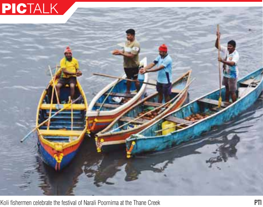
Koli fishermen celebrate the festival of Narali Purnima at the Thane Creek