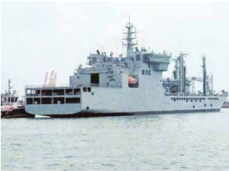
Indian Naval Vessel Shakti reaches Colombo, Sri Lanka with 100 tons of oxygen from Visakhapatnam, Andhra Pradesh. More oxygen consignments are scheduled from India