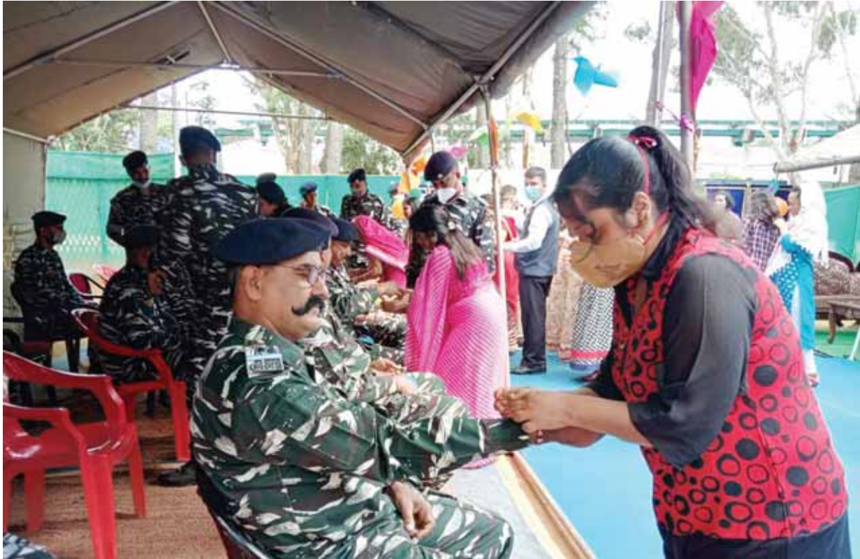
BSF jawans celebrate Raksha Bandhan at Indo Bangladesh border in Meghalaya