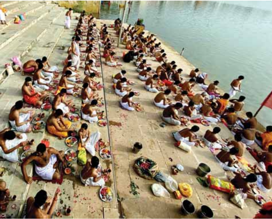
Hindus perform ritual for ‘aneu Sanskar’ (sacred thread) at the Holy lake of Pushkar, on the occasion of Sawan Purnima, in Pushkar, Rajasthan, on Sunday