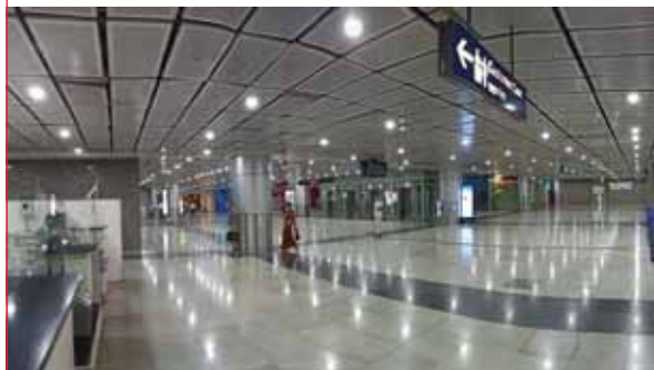
LED lighting system installed at the concourse area of Shivaji Station Airport Line as Delhi Metro is upgrading to LED system to save energy and provide a much better lighting experience