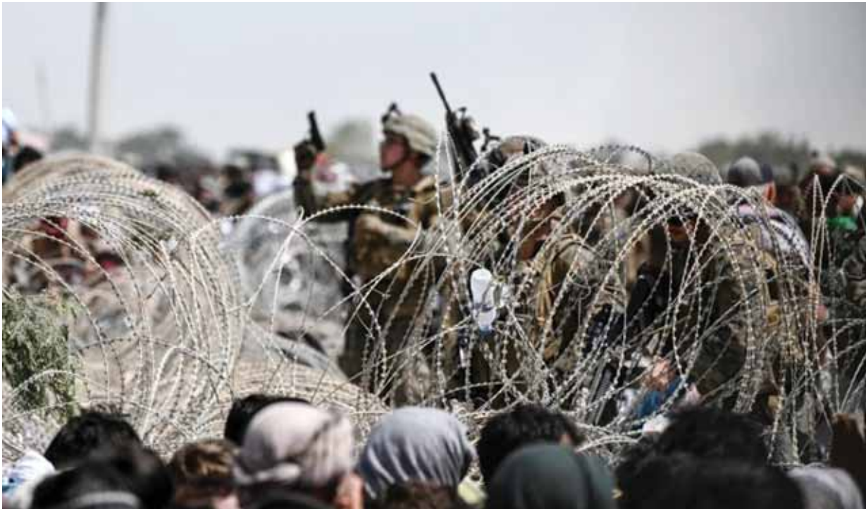
A US soldier shoots in the air with his pistol while standing guard behind barbed wire as Afghans sit on a roadside near the military part of the airport in Kabul

According to the Pentagon, the activation involves three