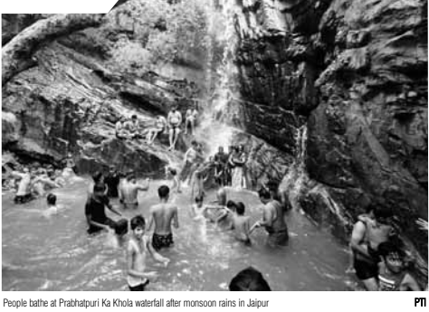
People bathe at Prabhakarji Ka Khola waterfall after monsoon rains in Jaipur