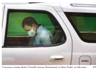
Congress leader Rahul Gandhi leaves Parliament in New Delhi on Monday

While the Opposition has been insisting on a full-fledged debate on the Pegasus issue, the Government's stand has been that it is ready to discuss anything but the tapping scandal.