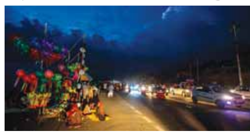
A migrant family sells balloons on a roadside as monsoon clouds gather over Srinagar on Sunday

The IMD said after witnessing uncharacteristically