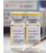
The US FDA authorised Johnson & Johnson's viral vector Covid-19 vaccine for emergency use in February 2021. However, weeks after its authorisation, the vaccine was linked to a rare but serious blood-clotting disorder.

It was reported earlier that a few thousand doses of Johnson & Johnson's vaccine could arrive in India in July.