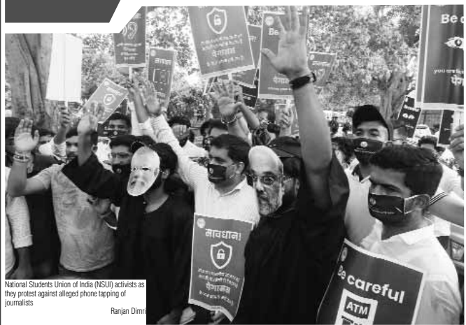
National Students Union of India (NSUI) activists as they protest against alleged phone tapping of journalists