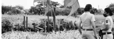
Police officials inspect the site after Shiv Sena workers damaged an Adani group signboard near the Shivaji Maharaj statue in Mumbai on Monday.

Monday's protests by the Shiv Sainiks were in line with the serious reservations expressed by Sena MP and party spokesperson Sanjay Raut over the renaming of CSMIA as Adani Airport Holding Ltd. (AAHL). "It is Chhatrapati Shivaji