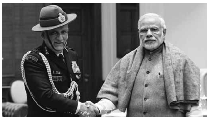
strength of character.

Prior to this, one may recall, General Milley had been excoriated by military veterans, politicians and the media for having unwittingly dragged the military into politics by being present, in uniform, at Trump's infamous 'Bible photo op' at the St John's Church, immediately after peaceful protesters had been forcefully evicted while demonstrating for racial equality. Indeed, that he then went on to tender a public apology for his error of judgement speaks volumes of his forthrightness, integrity and