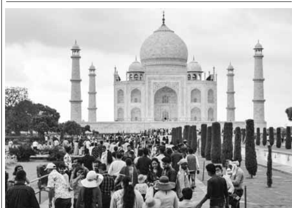
Tourists visit the historic Taj Mahal during a cloudy day in Agra on Monday.

Last week, the junior health inspector — arrayed as an accused in the case with regard to killing of the canines — moved the High Court seeking anticipatory bail and claimed that he was being falsely implicated in the case to divert the probe from the Chairperson and of the municipality and the chairperson of its standing committee on health.