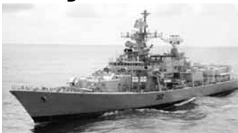
PNS ■ NEW DELHI

India, China agree to continue dialogue to ensure LAC disengagement