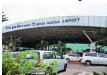
details shared by the airline company, the flight will take off from Lucknow at 10.55am and land in Ranchi at 12.05pm. It will again take off from Ranchi with about 70 passengers at 12.45 pm and land in Lucknow at 1.40pm. "Direct flights to Lucknow will begin in the first week of August. The dates have not been announced by the airlines yet. We will also have direct

The Indigo flight to Lucknow will be the first direct flight to any of the cities in Uttar Pradesh from Ranchi, the only city with an operational airport in the State. As per