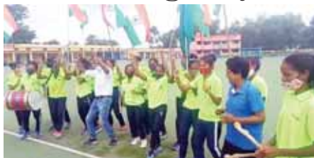
Fans of hockey player Salima Tete celebrate after Indian Women's hockey team won against Australia in the quarterfinal match at Tokyo Olympics, in Simdega on Monday