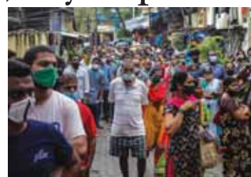
People line up to get inoculated against the coronavirus at a Covid-19 vaccination camp in Mumbai on Monday

Talking to a news agency, the researchers whose prediction is based on a mathematical model said that States