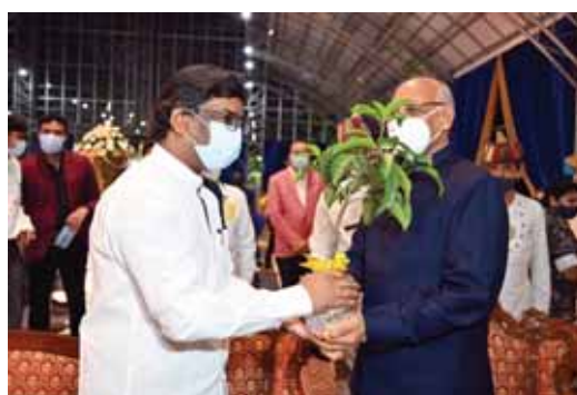
Chief Minister Hemant Soren gifts a Mango sapling to Governor Ramesh Bais on the occasion of the latter's birthday at Raj Bhawan in Ranchi on Monday