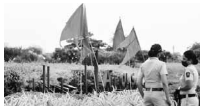
Police officials inspect the site after Shiv Sena workers damaged an Adani group signboard near the Shivaji Maharaj statue in Mumbai on Monday

Monday's protests by the Shiv Sainiks were in line with the serious reservations expressed by Sena MP and party spokesperson Sanjay Raut over the renaming over the CSMIA as Adani Airport Holding Ltd. (AAHL). "It is Chhatrapati Shivaji