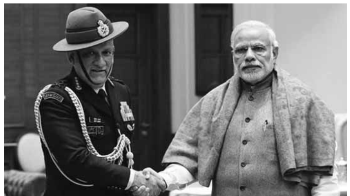
strength of character.

Prior to this, one may recall, General Milley had been excoriated by military veterans, politicians and the media for having unwittingly dragged the military into politics by being present, in uniform, at Trump's infamous "Bible photo op" at the St John's Church, immediately after peaceful protesters had been forcefully evicted while demonstrating for racial equality. Indeed, that he then went on to tender a public apology for his error of judgement speaks volumes of his forthrightness, integrity and