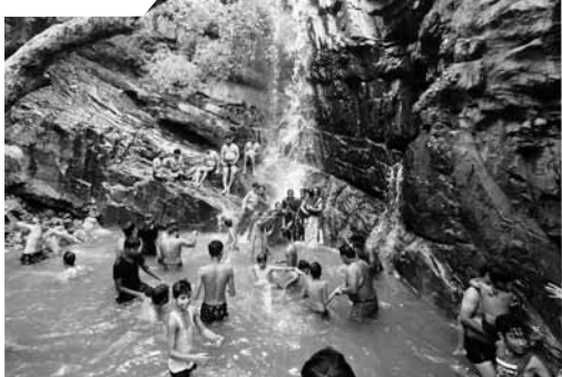
People bathe at Prabhathpuri Ka Khola waterfall after monsoon rains in Jaipur