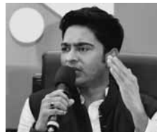
'Athithi Devo Bhava' (guest is God) ... but now they are attacking (the visitors). The people of Tripura will judge."

Alleging that the Tripura BJP and its Chief Minister Biplob Deb was "taking the state to new heights," Banerjee later tweeted "Democracy in Tripura under BJP... We are protesting against the state's heights." He further said "They (BJP) say