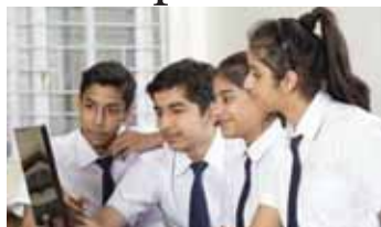
at Dr Shyma Prasad Mookerjee University requesting anonymity said, "Last year around 2.80 lakh students had cleared matriculation examination, while this year the number of students getting

Experts claim that getting admission to undergraduate courses at premier colleges will be tough this time due to the large number of students scoring good marks. A teacher