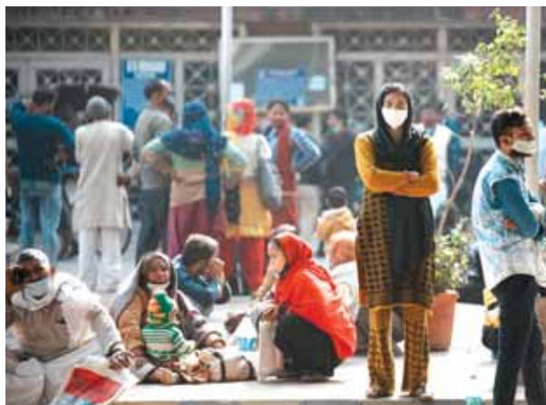
People wait on the premises of Lok Nayak Jai Prakash Narayan Hospital (LNJP) in New Delhi on Saturday. 12 patients suspected to be infected with the Covid-19 'Omicron' variant have been admitted in the hospital

He added, "We will test all his contacts once again after the reports confirmed that he carried the Omicron variant of the