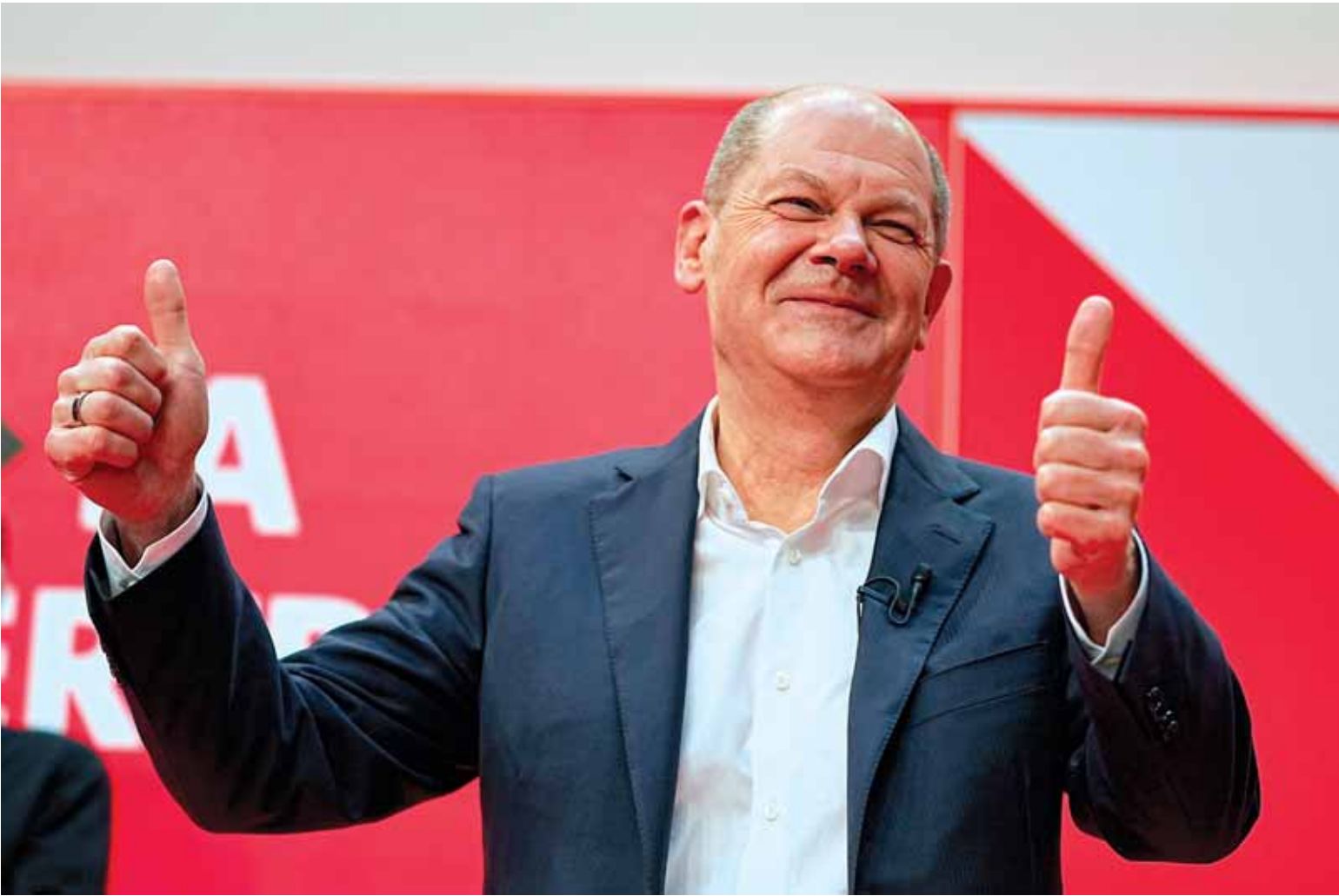
Olaf Scholz, SPD chancellor-designate and executive federal minister of finance, raises his thumbs after the SPD convention at Willy Brandt House approved the planned coalition agreement in Berlin, Germany, on Saturday. Delegates voted on a coalition agreement with the FDP and Bündnis90/Die Grünen to form a new federal government

German election heralds absolutely a messier political environment. It has gradually resulted into a much weaker leadership in comparison to Merkel for now. After the national election in this September, the new German Parliament looks like this: the Christian Democratic Union (CDU)/Christian Social Union (CSU) of Merkel gets 196 (-50) i.e. 24.1%; the Social Democratic Party (SPD) of