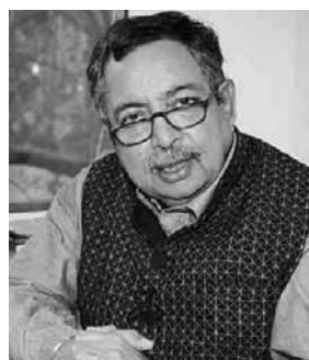
VINOD DUA *11 March 1954 - 4 Dec 2021*

Vinod Dua breathed his last at 5 pm at the Indraprastha Apollo Hospital where he was battling chronic liver disease, the hospital said in a statement.