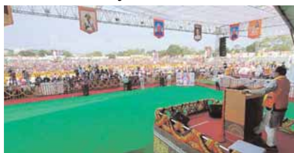
Madhya Pradesh Chief Minister Shivraj Singh Chouhan addresses a programme organised on the martyrdom day of tribal leader Tantya Bhil, in Indore, Madhya Pradesh on Saturday

In the remembrance program, Governor Patel and Chief Minister Chouhan worshiped the Gaurav Kalash Yatra organized in the memory of Jannayak Tantya Mama. They also paid