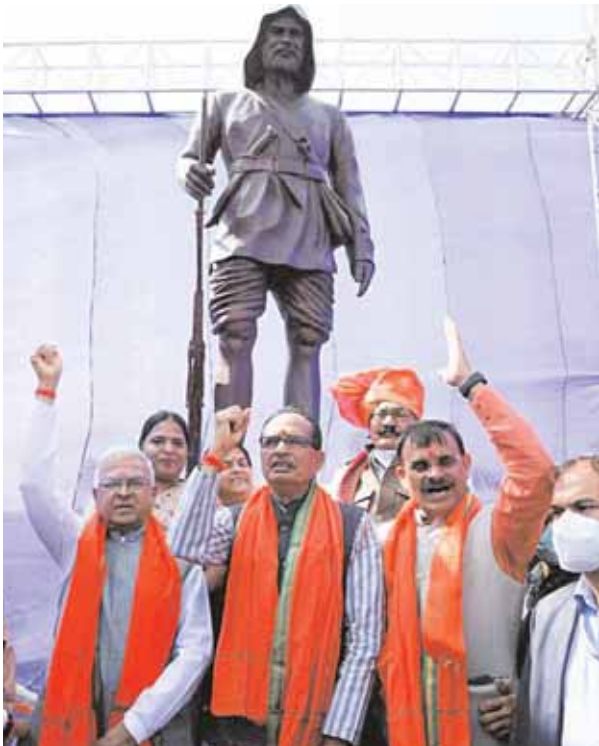
Madhya Pradesh Governor Mangubhai Patel along with Chief Minister Shivraj Singh Chouhan and BJP State President VD Sharma unveils a statue of tribal hero Tantya Bhil on his martyrdom day at Patalpani, Mhow Madhya Pradesh on Saturday

Chouhan said that Tantya Mama fought with the British against exploitation and injustice and fought decisive battle while playing an important role in freeing Mother India from the chains of slavery. The British also made a separate Tantya Police to catch Tantya Mama. Chouhan said that Patalpani, the place of work of such a brave person would be developed as a new pilgrimage. A meditation center will be built here, so that the coming generations can follow their