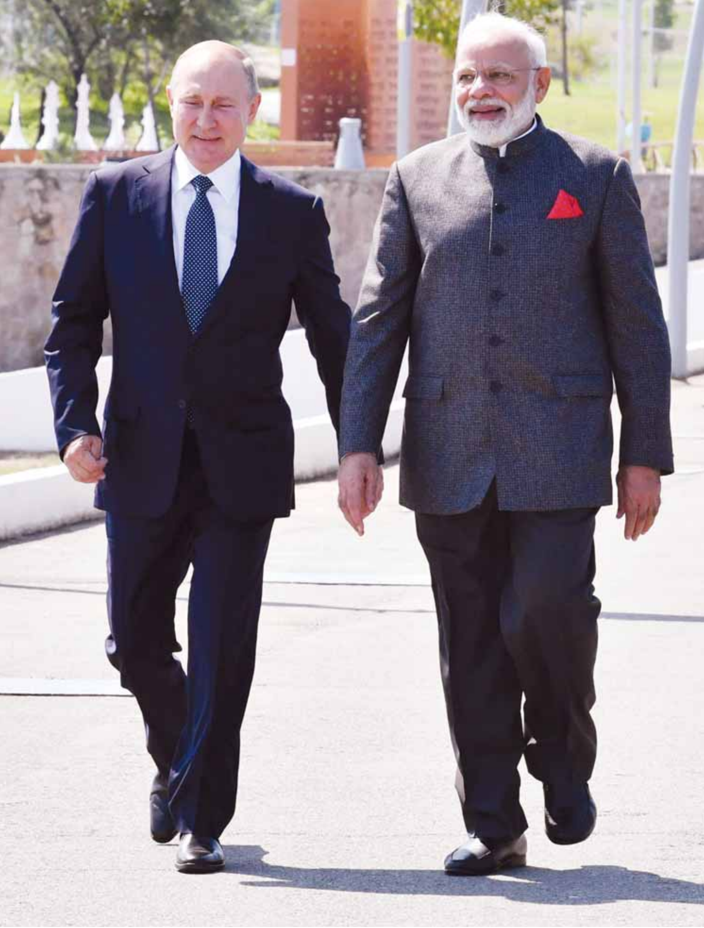
President Putin and Prime Minister Modi at Vladivostok Summit 2019

This interaction has been buttressed by consultations on India-Russia engagement on bilateral, regional, and multilateral issues. Experts