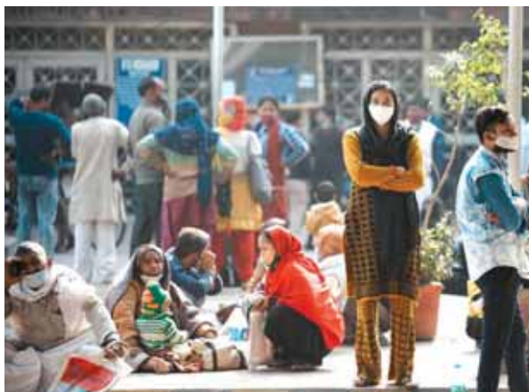
People wait on the premises of Lok Nayak Jai Prakash Narayan Hospital (LNJP) in New Delhi on Saturday. 12 patients suspected to be infected with the Covid-19 'Omicron' variant have been admitted in the hospital

He added, "We will test all his contacts once again after the reports confirmed that he carried the Omicron variant of the