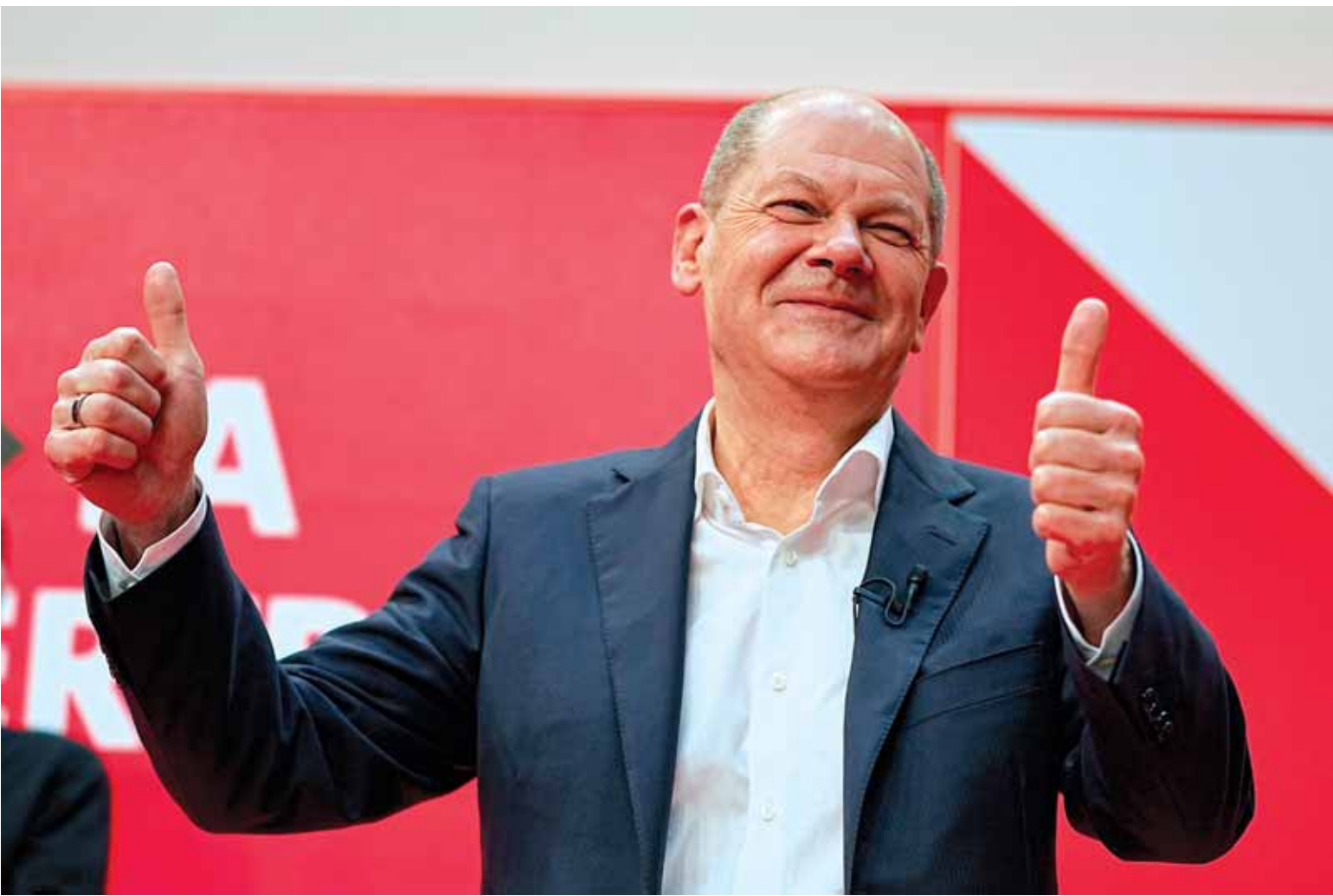
Olaf Scholz, SPD chancellor-designate and executive federal minister of finance, raises his thumbs after the SPD convention at Willy Brandt House approved the planned coalition agreement in Berlin, Germany, on Saturday. Delegates voted on a coalition agreement with the FDP and Bündnis90/Die Grünen to form a new federal government

German election heralds absolutely a messier political environment. It has gradually resulted into a much weaker leadership in comparison to Merkel for now. After the national election in this September, the new German Parliament looks like this: the Christian Democratic Union (CDU)/Christian Social Union (CSU) of Merkel gets 196 (-50) i.e. 24.1%; the Social Democratic Party (SPD) of