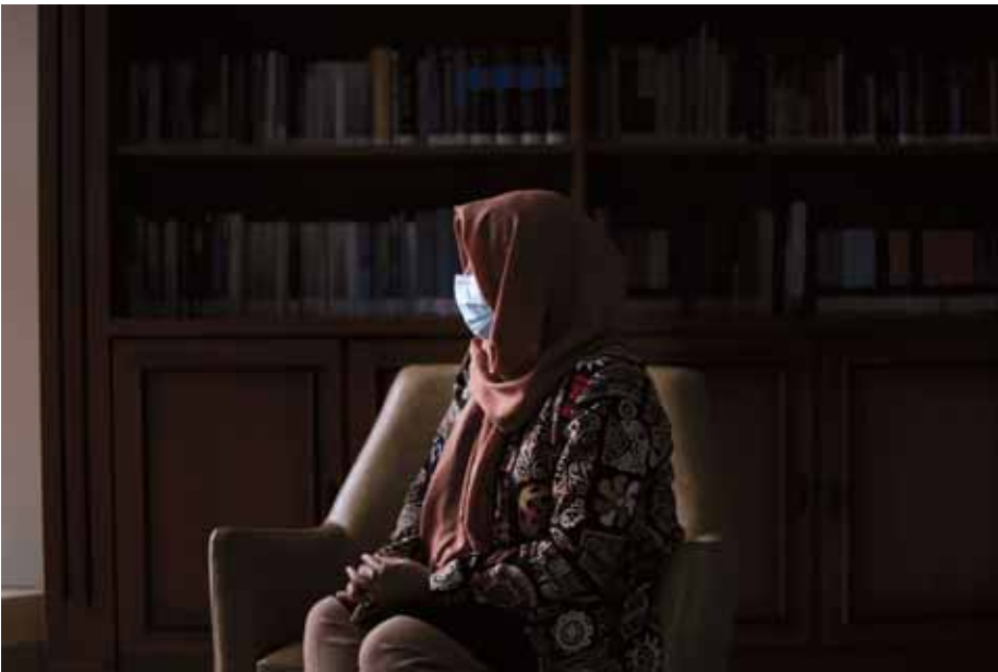
An Afghan judge who asked that her true name not be used, sits during an interview with AP in Brasilia on Wednesday. Seven Afghan female judges have taken refuge in Brazil due to fears of retribution from the Taliban

The judges who remain "are very scared, in hiding. They have serious financial problems, no salary, lost their