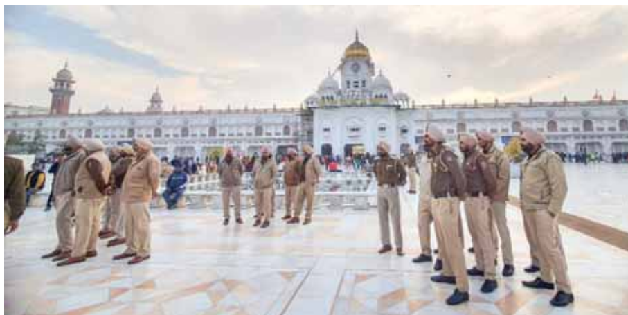
Police at the Golden Temple ahead of Punjab Chief Minister Charanjit Channi's visit, in Amritsar on Sunday. A man was beaten to death on Saturday after he allegedly attempted to commit a 'sacrilegious' act inside the historic temple