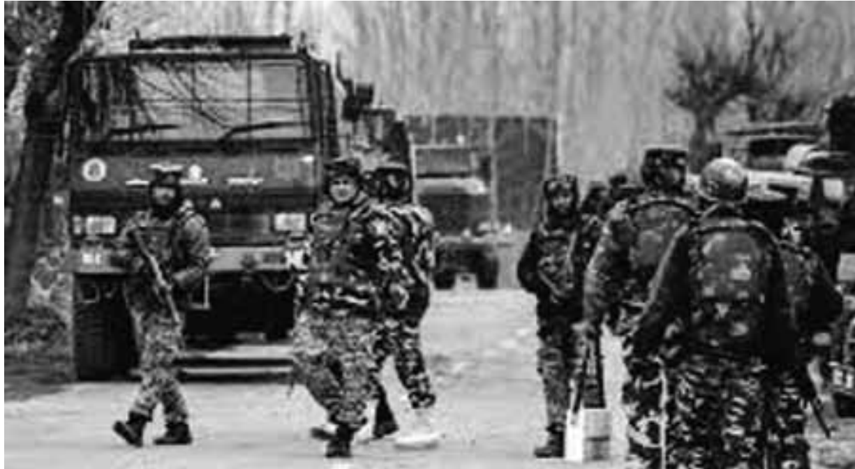
despatched over 5,000 more troops (50 companies, 25 each of the BSF and CRPF) to quell the terrorist violence there

Amid the spiraling terrorist violence in the Valley, the Centre had in October