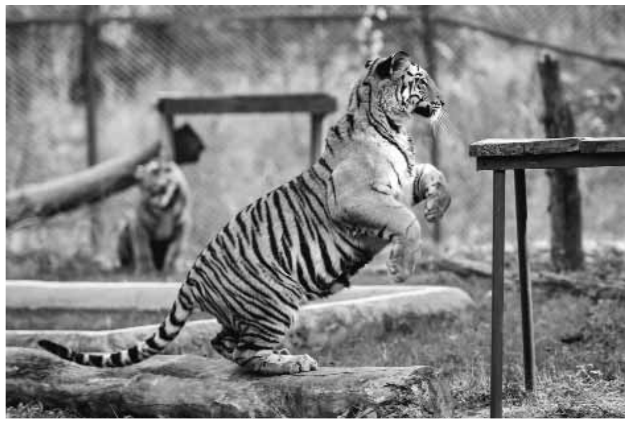
A tiger plays inside its enclosure at Lucknow zoo on Sunday

an ally of the CPI(M) once. Saturday saw the Congress-led opposition staging demonstrations across the State demanding the dropping of the K-Rail. Former Chief Minister Oommen Chandi said the Congress was totally against any project which would throw 35,000 people into the streets. Out of the 1,383 hectare land required for the project, 1200 hectare land was with poor people. "Let the Government come out with a detailed project report and environmental impact analysis. Then we will see the futility of the project," said Premachandran. V Muraleedharan, Union Minister of state for external affairs, said at Thiruvananthapuram that the project was yet to get approval either from the Railway ministry or from Union government. The K-Line project is already in the news because of the Kerala Government's decision to appoint relatives of ministers, MPs and party leaders in top positions. It was announced last week that wife of John Brittas, the CPI(M)'s Rajya Sabha MP, has been appointed as deputy general manager on deputation basis to K-Rail. This comes at a time when there are charges against the CPI(M) for appointing wives/close relations of at least a dozen senior leaders as associate professors and assistant professors in violation of all norms in various universities in the State.