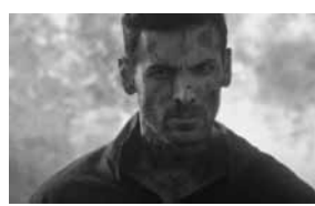
Entertainment, and Ajay Kapoor Production have formulated a remarkable strate-

gy by attaching a Bollywood movie teaser Attack to the prints of Spider Man — No Way Home in cinemas in India. The grand visuals of the high-octane action entertainer will indeed be a treat to watch on the big screen for the viewers.