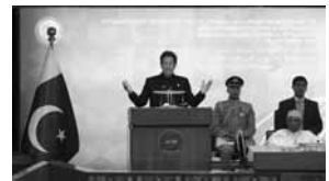
Pakistan Prime Minister Imran Khan, center, speaks during 17th extraordinary session of Organization of Islamic Cooperation (OIC) Council of Foreign Ministers, in Islamabad, Pakistan, Sunday, Dec. 19, 2021. The economic collapse of Afghanistan, already teetering dangerously on edge, would have a "horrendous" impact on region and world, successive speakers warned Sunday at start of a one-day summit of foreign ministers

The gathering also included the U.N. undersecretary general on humanitarian affairs as well as the president of the Islamic Development Bank Muhammad Sulaiman Al Jasser, who offered several concrete financing proposals. He said the IDB can manage trusts that could be used to move money into Afghanistan, jump-