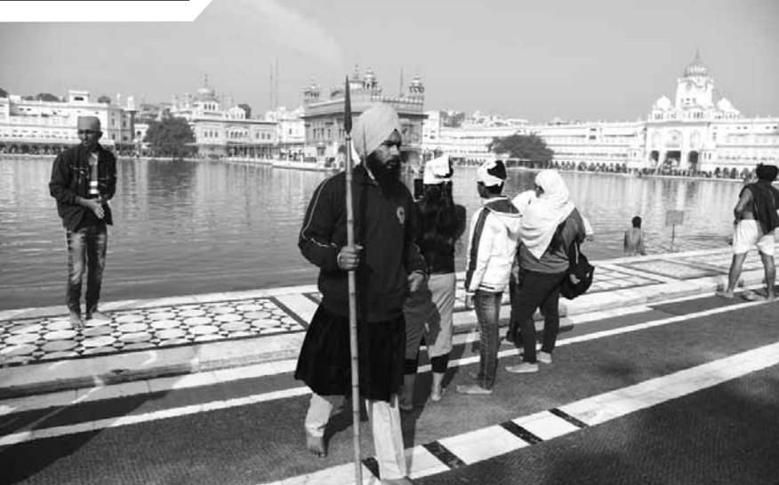
A Sikh guard holds a spear as devotees arrive at the Golden Temple