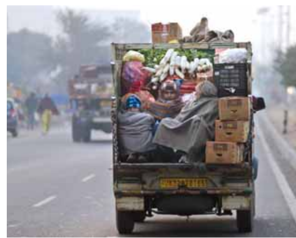
Workers huddle in the back of a vegetable truck as they travel on a cold and foggy morning in Jammu.

there would not be any let-up in the cold wave condition over the next three days. "Cold and dry north-westerly winds, gusting up to 15 kmph, are likely to continue over the plains of northwest India till Tuesday enhancing the adverse impact of the cold wave and cold day conditions", it said.