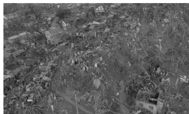
damaged houses and toppled trees lie in Dinagat Island, Surigao del Norte province, southern Philippines on Friday.