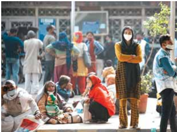
People wait on the premises of Lok Nayak Jai Prakash Narayan Hospital (LNJP) in New Delhi on Saturday. 12 patients suspected to be infected with the Covid-19 'Omicron' variant have been admitted in the hospital

He added, "We will test all his contacts once again after the reports confirmed that he carried the Omicron variant of the